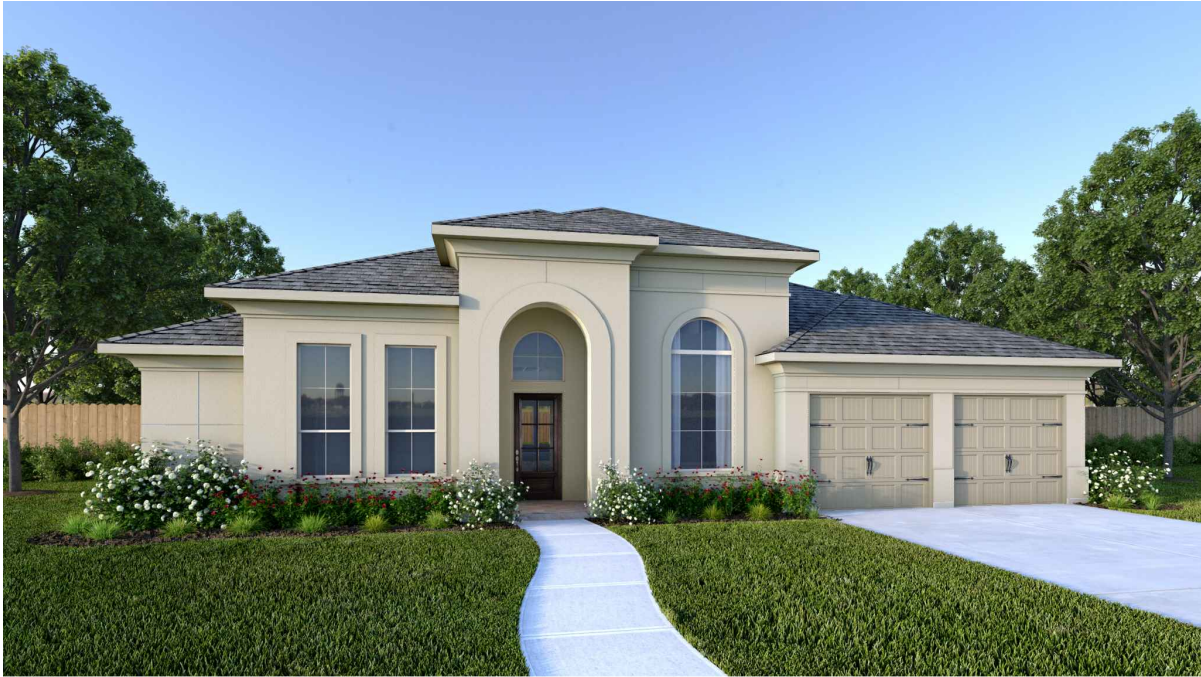
Design 3322S E-1