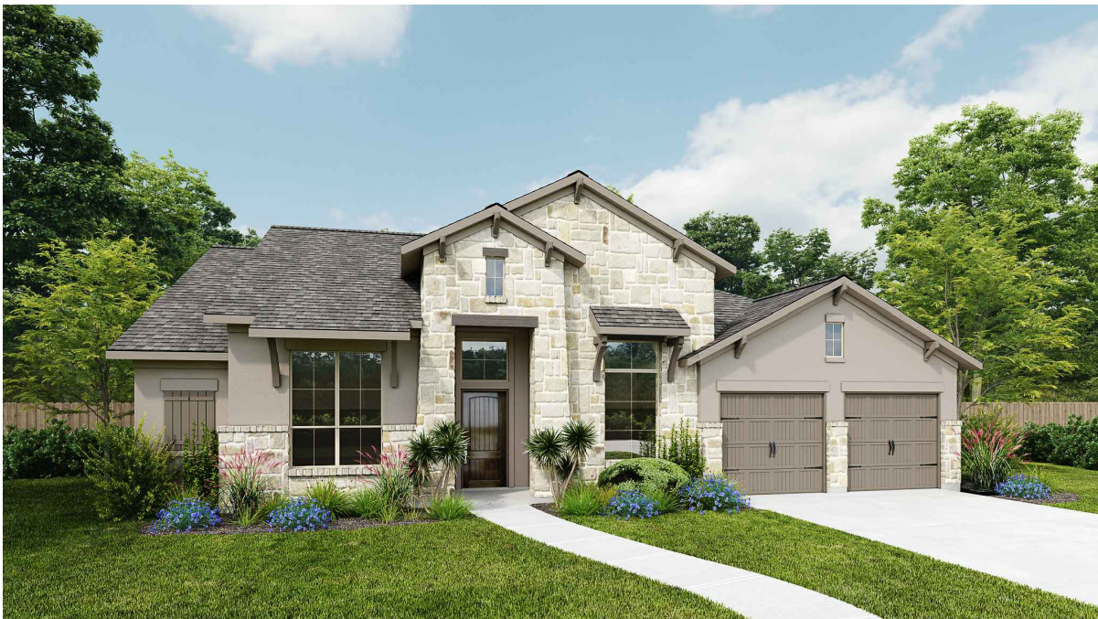
Design 3322S E-100

This design, as originally designed and prior to any changes you make, is estimated to yield approximately the number of square feet shown on page 1. All dimensions are approximate. Square footage may vary based on as-built dimensions, configurations, plan options and/or the method of calculation. Designs are not-to-scale, and are conceptual illustrations that may differ from construction plans or completed improvements. A design may depict features not available on all homesites or in all communities. Perry Homes reserves the right to make changes in plans and specifications, and to substitute material of similar quality. Prices, terms, promotions, plans, dimensions, features, options, amenities, elevations, designs, square footages, specifications, materials, and availability of homes or communities are subject to change without notice or obligation. All obligations will be governed by a written contract. This design does not constitute a commitment to build a particular floor plan or home in any given community. Some floor plans, options, and/or elevations may not be available on certain homesites or in a particular community and may require additional charges. Please check with Perry Homes to verify current offerings in the communities you are considering. This rendering is the property of Perry Homes, LLC. Any reproduction or exhibition is strictly prohibited.