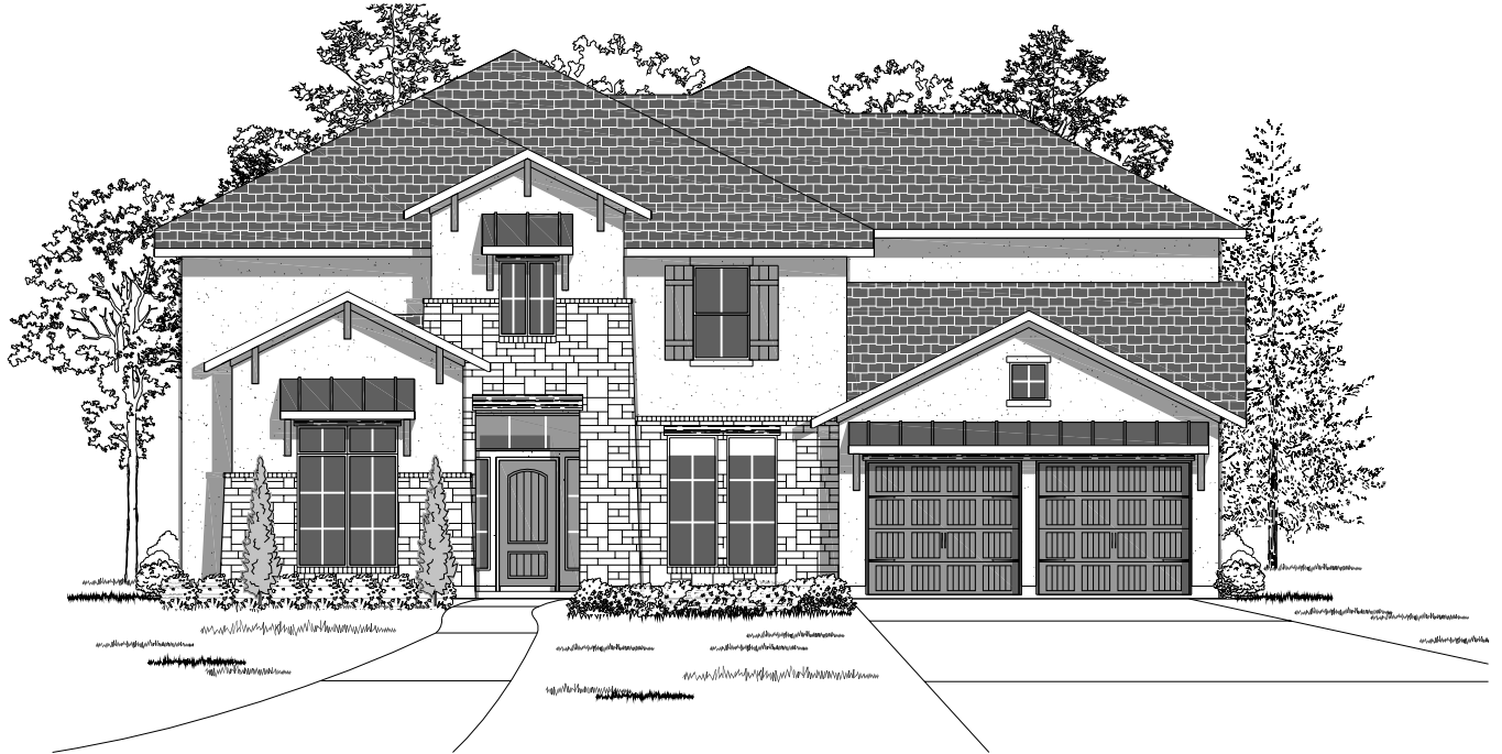
Design 4098S E-70

This design, as originally designed and prior to any changes you make, is estimated to yield approximately the number of square feet shown on page 1. All dimensions are approximate. Square footage may vary based on as-built dimensions, configurations, plan options and/or the method of calculation. Designs are not-to-scale, and are conceptual illustrations that may differ from construction plans or completed improvements. A design may depict features not available on all homesites or in all communities. Perry Homes reserves the right to make changes in plans and specifications, and to substitute material of similar quality. Prices, terms, promotions, plans, dimensions, features, options, amenities, elevations, designs, square footages, specifications, materials, and availability of homes or communities are subject to change without notice or obligation. All obligations will be governed by a written contract. This design does not constitute a commitment to build a particular floor plan or home in any given community. Some floor plans, options, and/or elevations may not be available on certain homesites or in a particular community and may require additional charges. Please check with Perry Homes to verify current offerings in the communities you are considering. This rendering is the property of Perry Homes, LLC. Any reproduction or exhibition is strictly prohibited. © Perry Homes, LLC 2019