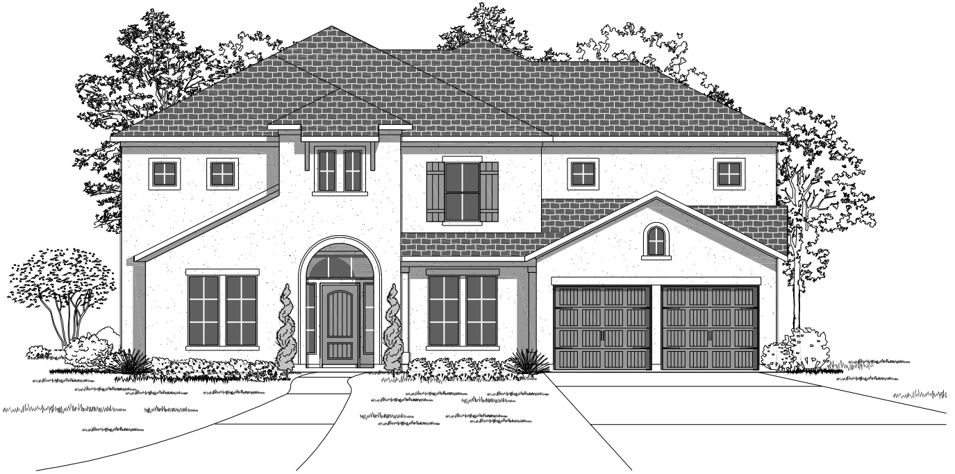
Design 4098S E-1 Includes Large Front Porch