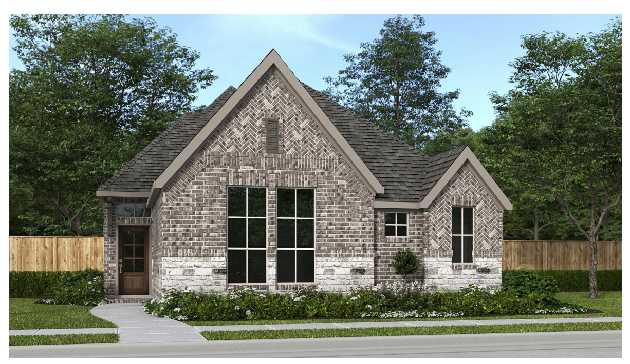
DESIGN 1503W E-30