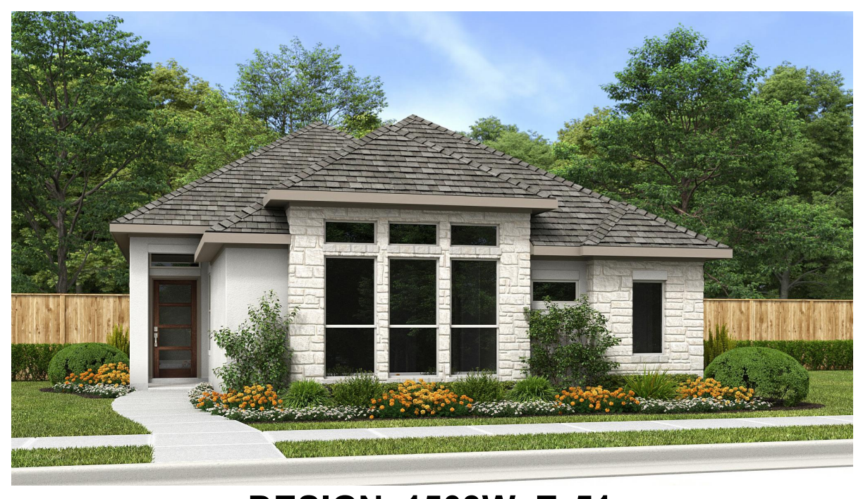
DESIGN 1503W E-51

This design, as originally designed and prior to any changes you make, is estimated to yield approximately the number of square feet shown on page 1. All dimensions are approximate. Square footage may vary based on as-built dimensions, configurations, plan options and/or the method of calculation. Designs are not-to-scale, and are conceptual illustrations that may differ from construction plans or completed improvements. A design may depict features not available on all homesites or in all communities. Perry Homes reserves the right to make changes in plans and specifications, and to substitute material similar quality. Prices, terms, promotions, plans, dimensions, features, options, amenities, elevations, designs, square footages, specifications, materials, and availability of homes or communities even to change without notice or obligation. All obligations will be governed by a written contract. This design does not constitute a commitment to build a particular floor plan or home in any given community. Some floor plans, options, and/or elevations may not be available on certain homesics or in a particular community and may require additional charges. Please check with Perry Homes to verify current offerings in the communities you are considering. This rendering is the property of Perry Homes. LLC. Any reproduction or exhibition is strictly prohibited. © Perry Homes, LLC 2023