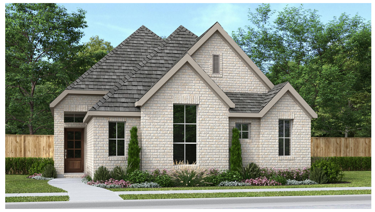
DESIGN 1503W E-1