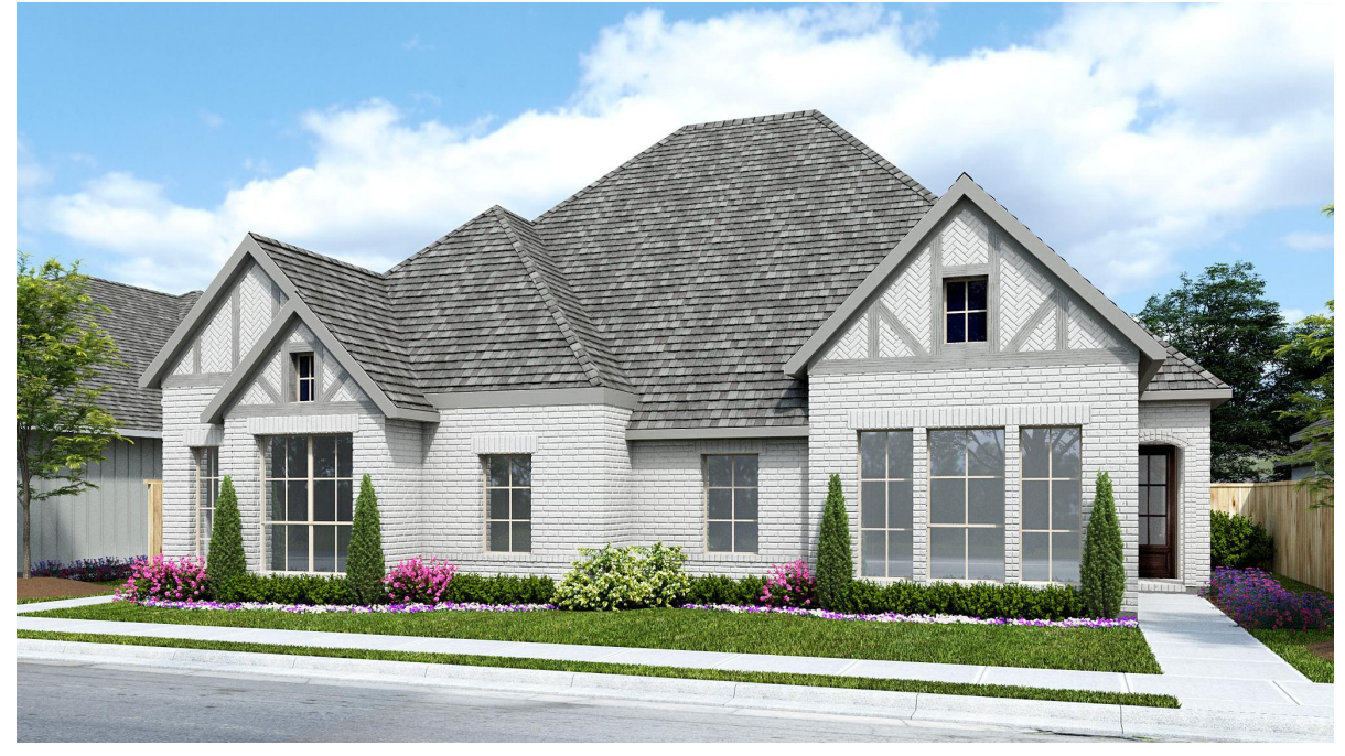
DESIGN 1534 E-51 DESIGN 1500 E-51

This design, as originally designed and prior to any changes you make, is estimated to yield approximately the number of square feet shown on page 1. All dimensions are approximate. Square footage may vary based on as-built dimensions, configurations, plan options and/or the method of calculation. Designs are not-to-scale, and are conceptual illustrations that may differ from construction plans or completed improvements. A design may depict features not available on all homesites or in all communities. Perry Homes reserves the right to make changes in plans and specifications, and to substitute material of similar quality. Prices, terms, promotions, plans, dimensions, features, options, amenities, elevations, designs, square footages, specifications, materials, and availability of homes or communities are subject to change without notice or obligation. All obligations will be governed by a written contract. This design does not constitute a commitment to build a particular floor plan or home in any given community Some floor plans, options, and/or elevations may not be available on certain homesites or in a particular community and may require additional charges. Please check with Perry Homes to verify current offerings in the communities are considering. This rendering is the property of Perry Homes II C. Any reproduction or exhibition is strictly prohibited @ Perry Homes II C. 2023