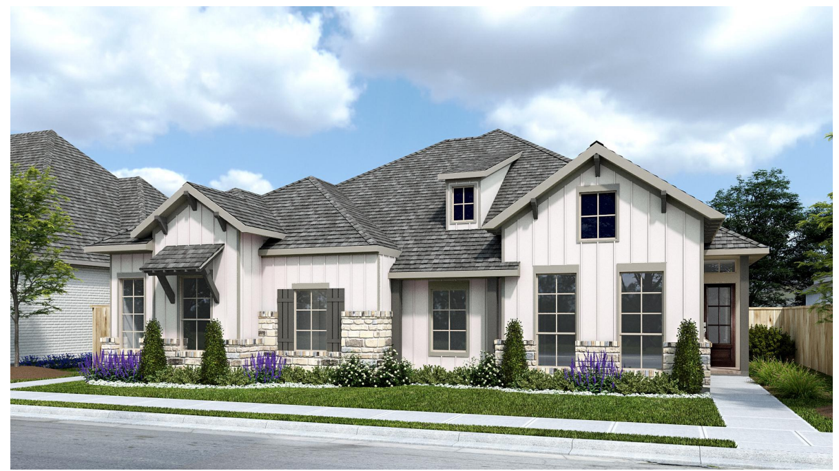
DESIGN 1534 E-30 DESIGN 1500 E-30