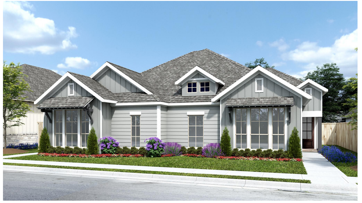
DESIGN 1534 E-1 DESIGN 1500 E-1