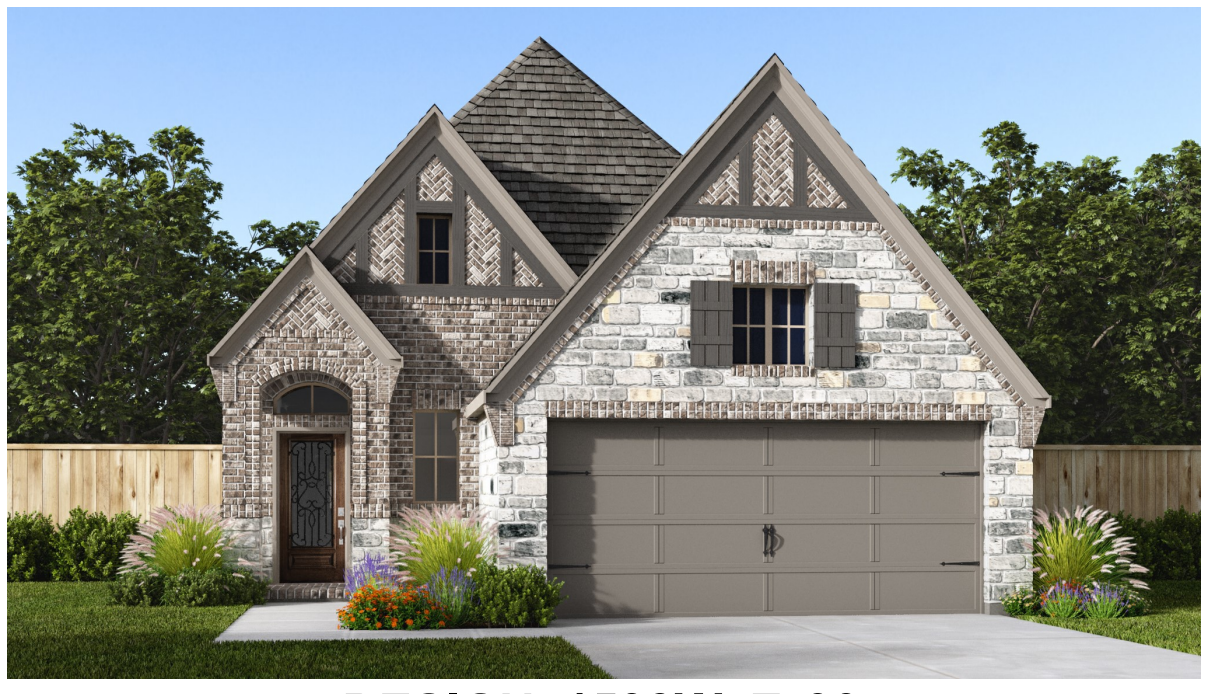
DESIGN 1593W E-90

This design, as originally designed and prior to any changes you make, is estimated to yield approximately the number of square feet shown on page 1. All dimensions are approximate. Square footage may vary based on as-built dimensions, configurations, plan options and/or the method of calculation. Designs are not-to-scale, and are conceptual illustrations that may differ from construction plans or completed improvements. A design may depict features not available on all homesites or in all communities. Perry Homes reserves the right to make changes in plans and specifications, and to substitute material of similar quality. Prices, terms, promotions, plans, dimensions, features, options, amenities, elevations, designs, square footages, specifications, materials, and availability of homes or communities to change without notice or obligation. All obligations will be governed by a written contract. This design does not constitute a commitment to build a particular floor plan or home in any given community. Some floor plans, options, and/or elevations may not be available on certain homesites or in a particular community and may require additional charges. Please check with Perry Homes to verify current offerings in the communities on a green considering. This rendering is the property of Perry Homes. LLC. Any reproduction or exhibition is strictly prohibited @ Perry Homes LLC. 2019.