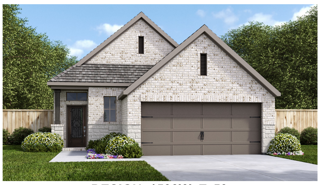
DESIGN 1593W E-50