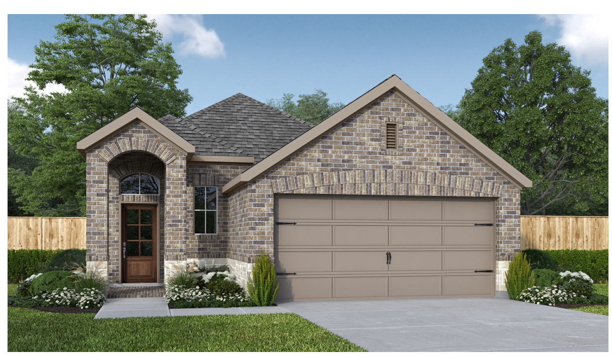
DESIGN 1593W E-30