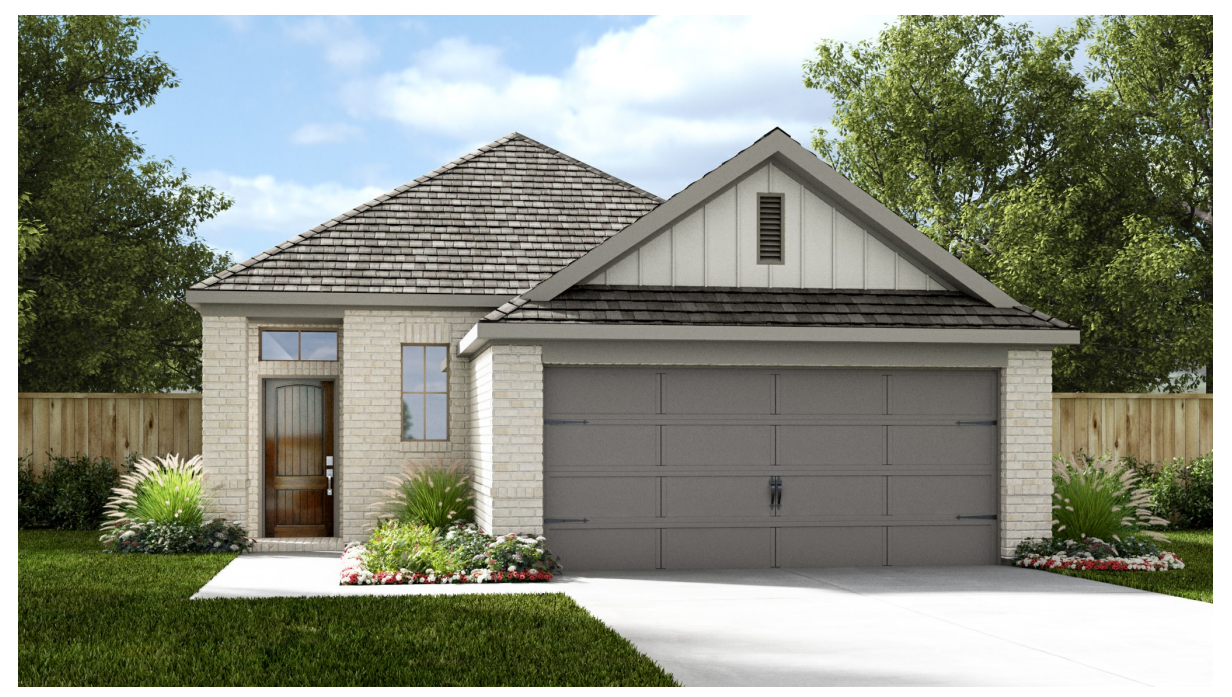
DESIGN 1593W E-1