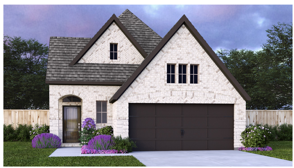
DESIGN 1593W E-71