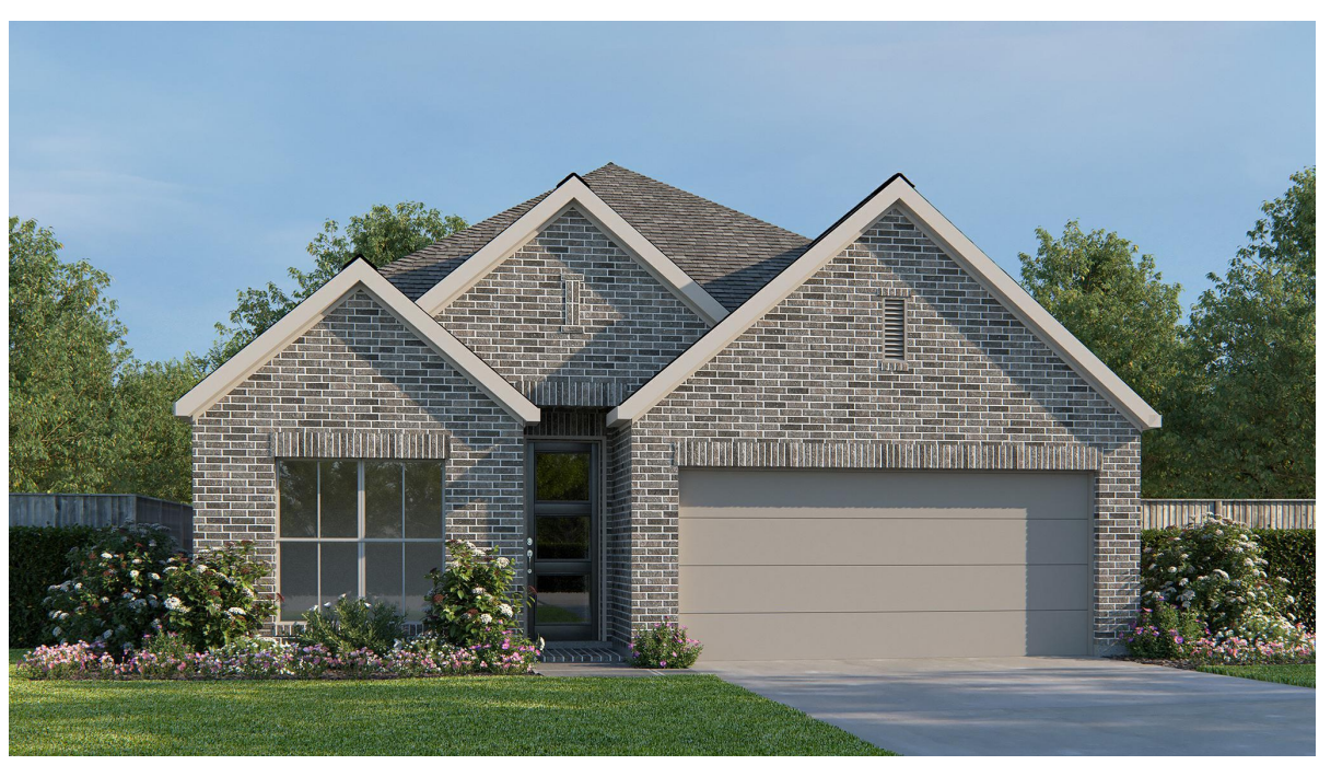
DESIGN 1653P E-1