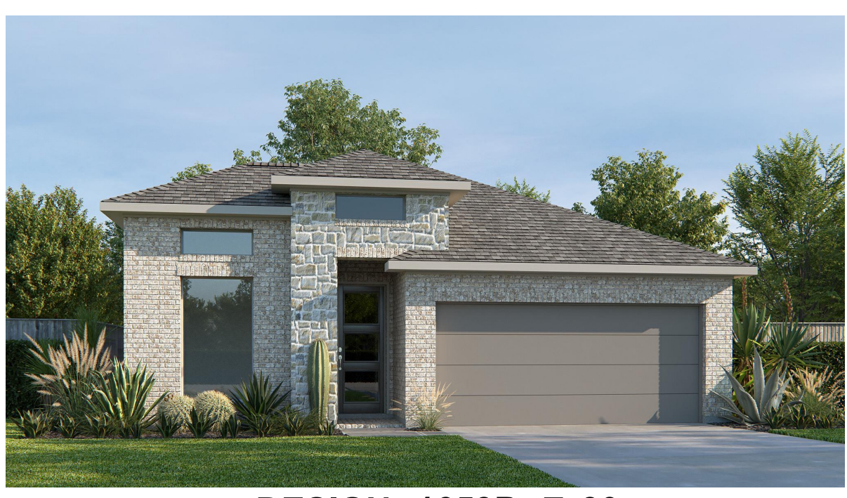
DESIGN 1653P E-30

Inis design, as originally designed and prior to any changes you make, is estimated to yelici approximately free humber of square feet shown on page 1. All dimensions are approximates. Square footage may vary based on as-built dimensions, configurations, plan options and/or the method of calculation. Designs are not-to-scale, and are conceptual illustrations that may differ from construction plans or completed improvements. A design may depict features not available on all homesites or in all communities. Perry Homes reserves the right to make changes in plans and specifications, and to substitute material of similar quality. Prices, terms, promotions, plans, dimensions, features, options, amenities, elevations, designs, square footages, specifications, materials, and availability of homes or communities are subject to change without notice or obligation. All obligations will be governed by a written contract. This design does not constitute a commitment to build a particular floor plan or home in any given community. Some floor plans, options, and/or elevations may not be available on certain homesites or in a particular community and may require additional charges. Please check with Perry Homes to verify current offerings in the communities you are considering. This rendering is the property of Perry Homes, LLC. Any reproduction or exhibition is strictly prohibited. © Perry Homes, LLC 2023