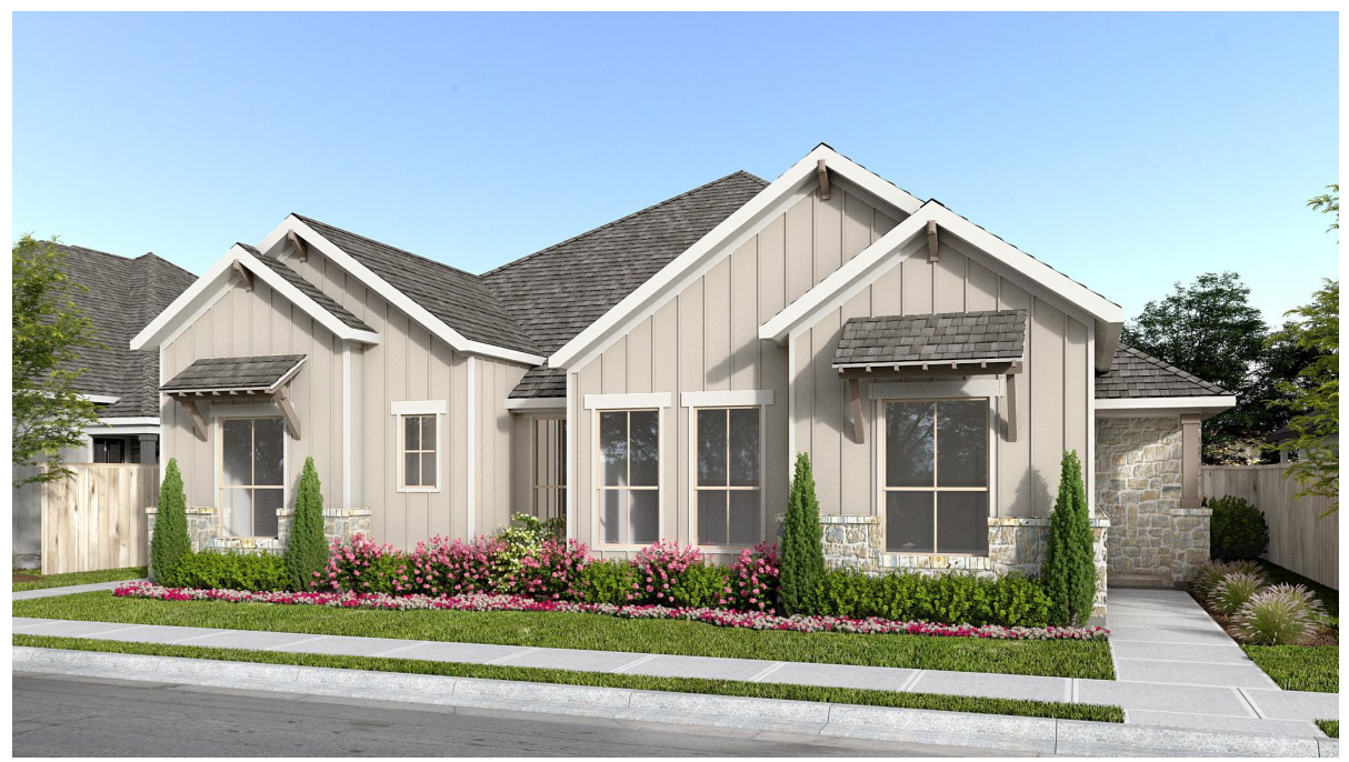
DESIGN 1711 E-50 DESIGN 1712 E-50