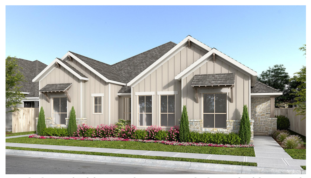
DESIGN 1711 E-50 DESIGN 1712 E-50