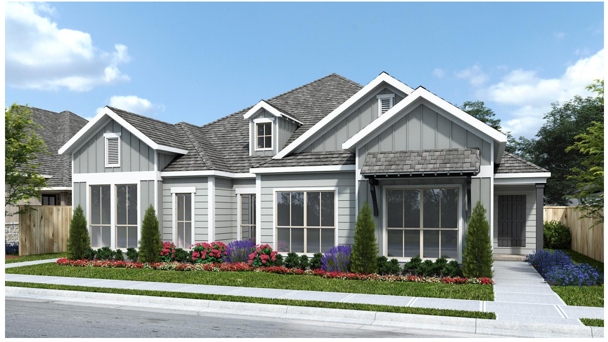
DESIGN 1711 E-1 DESIGN 1712 E-1