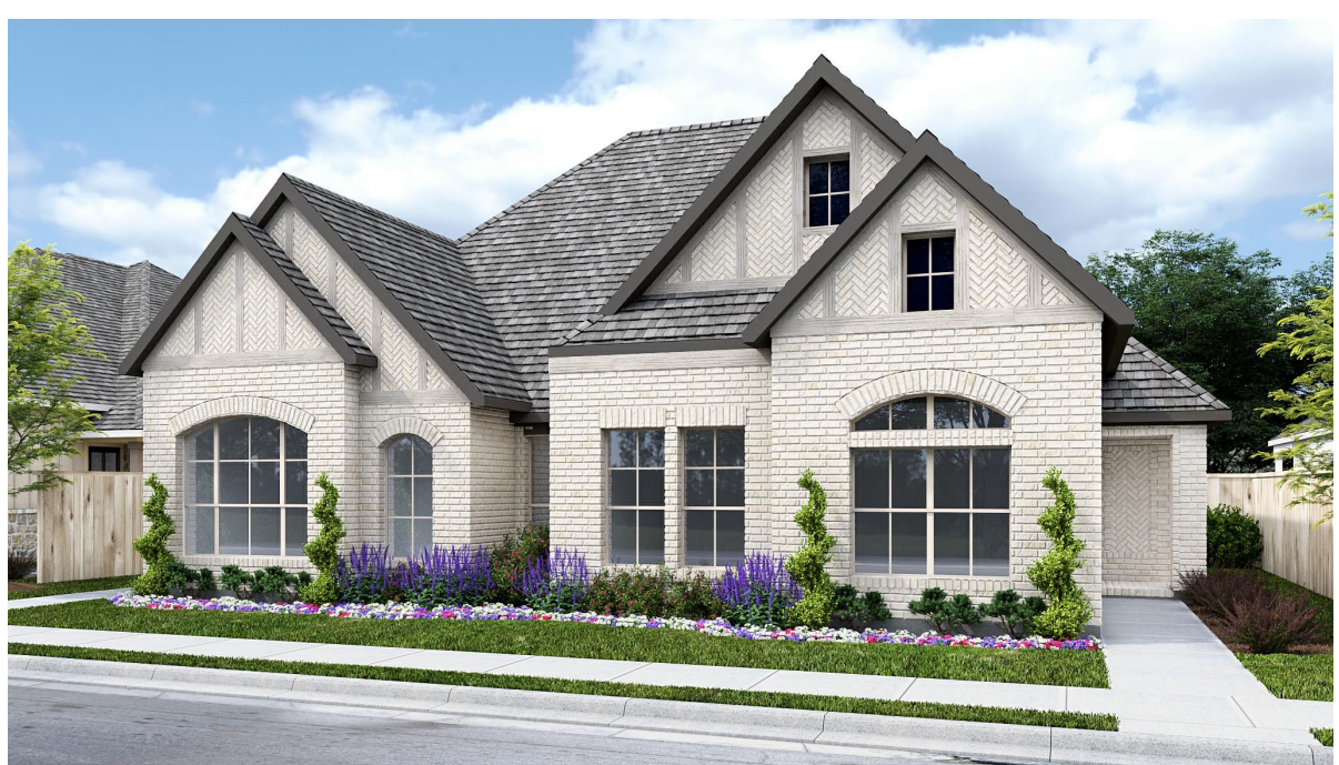
DESIGN 1711 E-71 DESIGN 1712 E-71

This design, as originally designed and prior to any changes you make, is estimated to yield approximately the number of square feet shown on page 1. All dimensions are approximate. Square footage may vary based on as-built dimensions, configurations, plan options and/or the method of calculation. Designs are not-to-scale, and are conceptual illustrations that may differ from construction plans or completed improvements. A design may depict features not available on all homesites or in all communities. Perry Homes reserves the right to make changes in plans and specifications, and to substitute material of similar quality. Prices, terms, promotions, plans, dimensions, features, options, amenities, elevations, designs, square footages, specifications, materials, and availability of homes or communities are subject to change without notice or obligation. All obligations will be governed by a written contract. This design does not constitute a commitment to build a particular floor plan or home in any given community Some floor plans, options, and/or elevations may not be available on certain homesites or in a particular community and may require additional charges. Please check with Perry Homes to verify current offerings in the communities are considering. This rendering is the property of Perry Homes 11 C. Any reproduction or exhibition is strictly prohibited @ Perry Homes 11 C. 2023