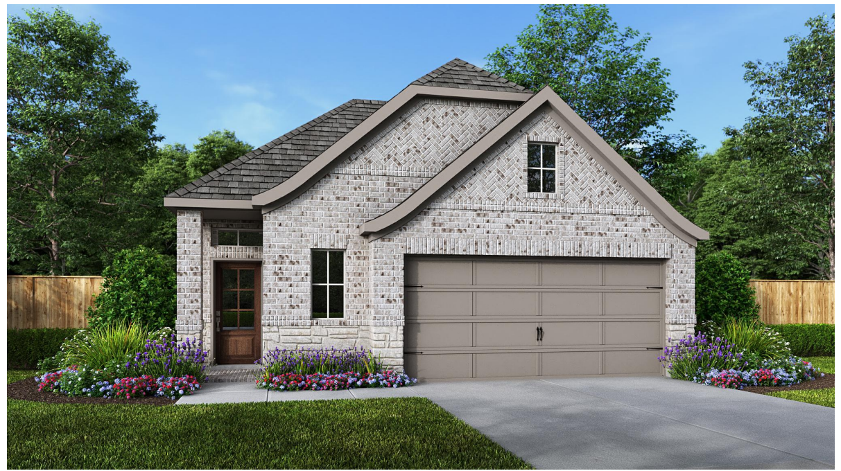
DESIGN 1736W E-51