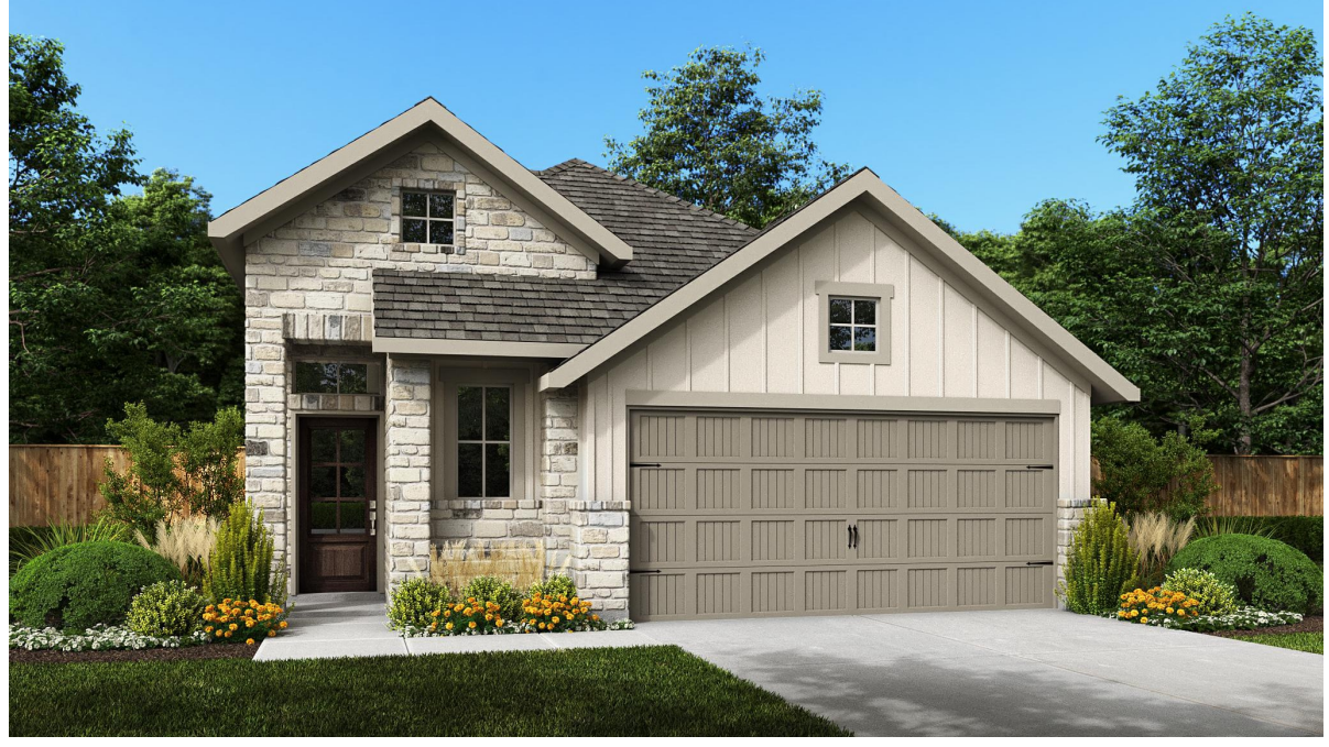
DESIGN 1736W E-52

*See Page 3 for Details and Disclaimers | © Perry Homes, LLC 2024 | 2/15/2024 1:07:46 PM (40' CL) PerryHomes.com