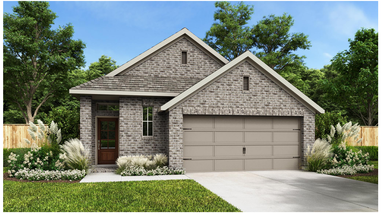
DESIGN 1736W E-1