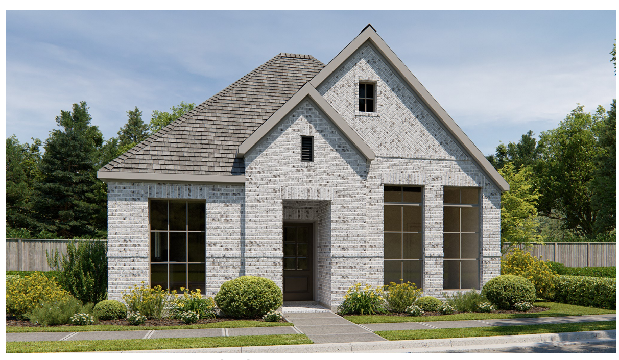
DESIGN 1737W E-2

This design, as originally designed and prior to any changes you make, is estimated to yield approximately the number of square feet shown on page 1. All dimensions are approximate. Square footage may vary based on as-built dimensions, configurations, plan options and/or the method of calculation. Designs are not-to-scale, and are conceptual illustrations that may differ from construction plans or completed improvements. A design may depict features not available on all homesites or in all communities. Perry Homes reserves the right to make changes in plans and specifications, and to substitute material similar quality. Prices, terms, promotions, plans, dimensions, features, options, amenities, elevations, designs, square footages, specifications, materials, and availability of homes or communities contact. This design does not constitute a commitment to build a particular floor plan or home in any given community. Some floor plans, options, and/or elevations may not be available on certain homesites or in a particular community and may require additional charges. Please check with Perry Homes to verify current offerings in the communities you are considering. This rendering is the property of Perry Homes. LLC. Any reproduction or exhibition is strictly prohibited. © Perry Homes. LLC 2023