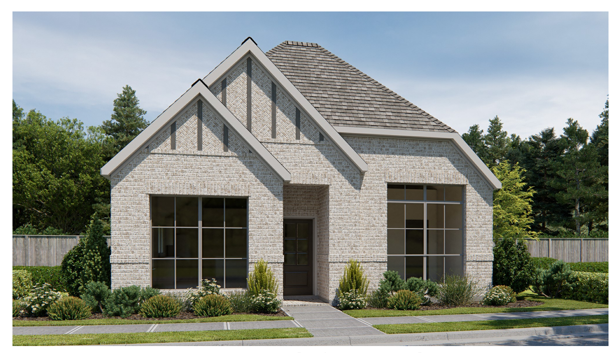
DESIGN 1737W E-1