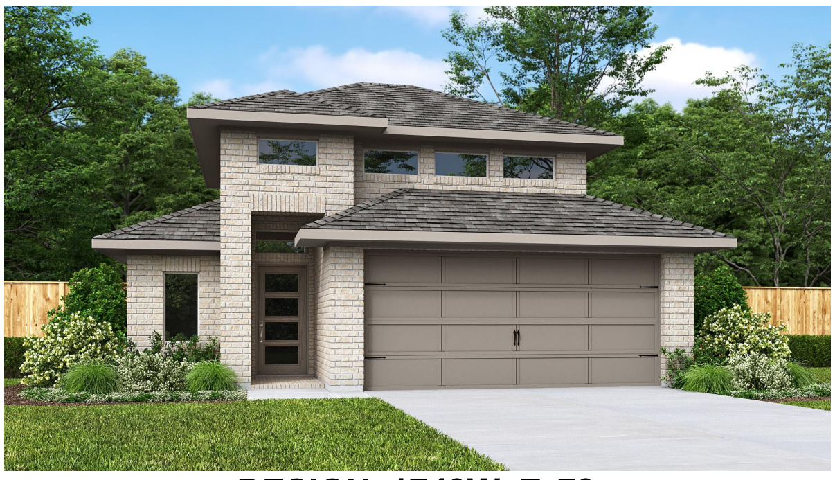
DESIGN 1743W E-73

In sesignt, as originarily designed and prior to any charges you make, is estimated to yield approximately fire further of square reox, stourn of page 1. All dimensions are approximate. Square rook vary based on as-built dimensions, configurations, plan options and/or the method of calculation. Designs are not-to-scale, and are conceptual illustrations that may depict features not available on all homesites or in all communities. Perry Homes reserves the right to make changes in plans and specifications, and to substitute material of similar quality. Prices, terms, promotions, plans, dimensions, features, options, amenities, elevations, designs, square footages, specifications, materials, and availability of homes or communities are subject to change without notice or obligation. All obligations will be governed by a written contract. This design does not constitute a commitment to build a particular floor plan or home in any given community. Some floor plans, options, and/or elevations may not be available on certain homesites or in a particular community and may require additional charges. Please check with Perry Homes to verify current offerings in the communities you are considering. This rendering is the property of Perry Homes, LLC. Any reproduction or exhibition is strictly prohibited. © Perry Homes, LLC 2022