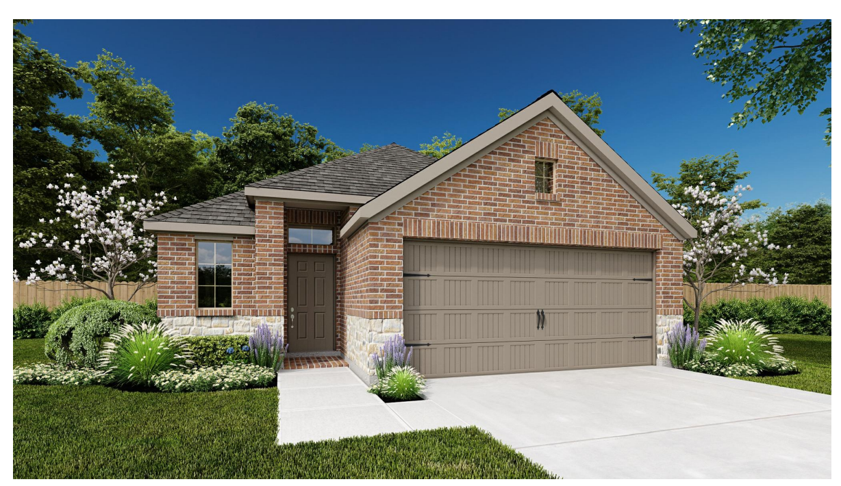
DESIGN 1743W E-30