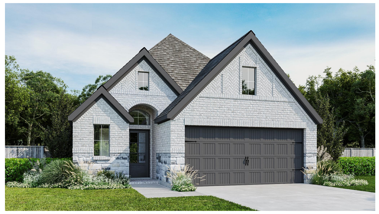
DESIGN 1743W E-52