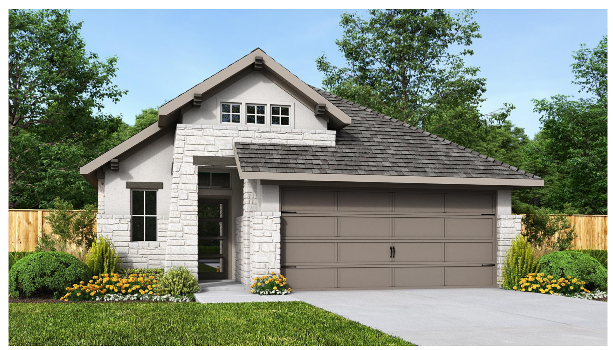
DESIGN 1743W E-71