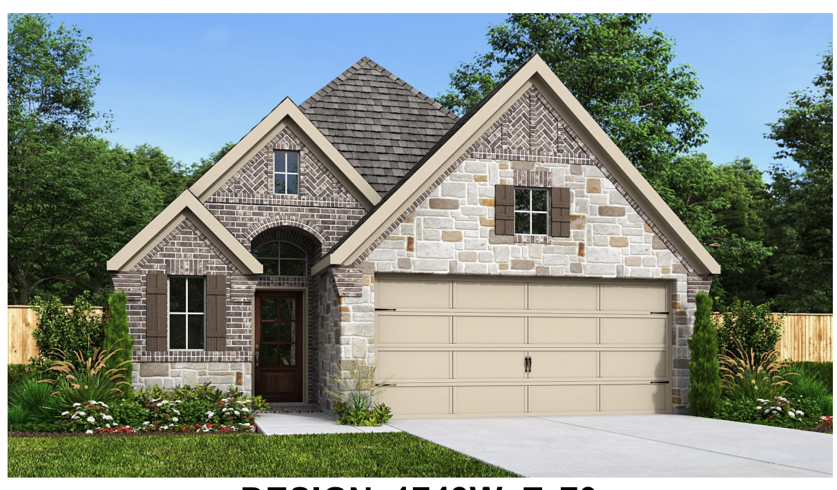
DESIGN 1743W E-70