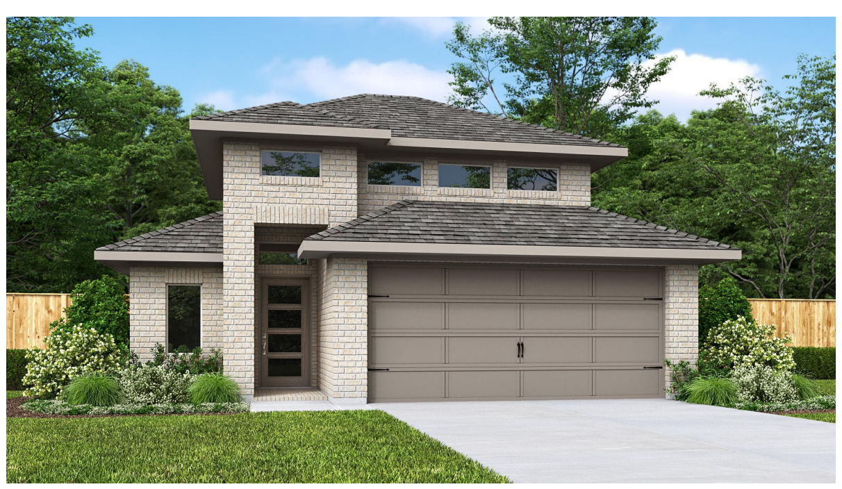
DESIGN 1743W E-73

In sesign, as originary designed and prior to any charges you make, is estimated to yield approximately fire further of square reox, stourn of page 1. All dimensions are approximate. Square rook vary based on as-built dimensions, configurations, plan options and/or the method of calculation. Designs are not-to-scale, and are conceptual illustrations that may depict features not available on all homesites or in all communities. Perry Homes reserves the right to make changes in plans and specifications, and to substitute material of similar quality. Prices, terms, promotions, plans, dimensions, features, options, amenities, elevations, designs, square footages, specifications, materials, and availability of homes or communities are subject to change without notice or obligation. All obligations will be governed by a written contract. This design does not constitute a commitment to build a particular floor plan or home in any given community. Some floor plans, options, and/or elevations may not be available on certain homesites or in a particular community and may require additional charges. Please check with Perry Homes to verify current offerings in the communities you are considering. This rendering is the property of Perry Homes, LLC. Any reproduction or exhibition is strictly prohibited. © Perry Homes, LLC 2024