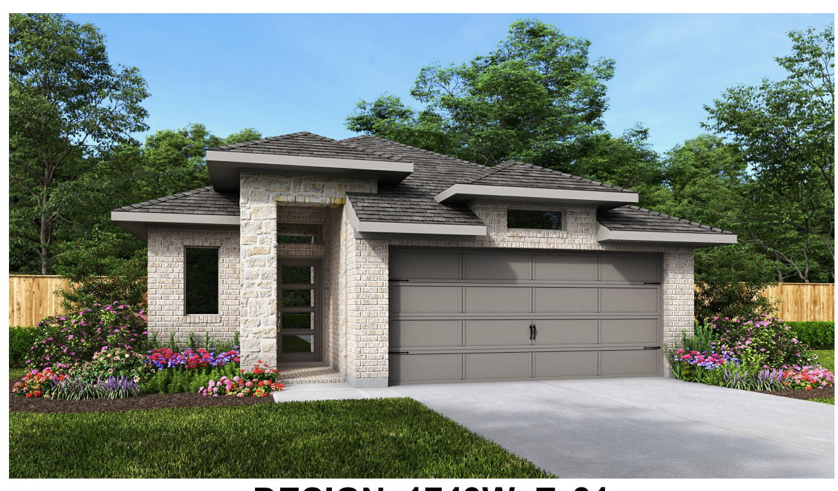
DESIGN 1743W E-31