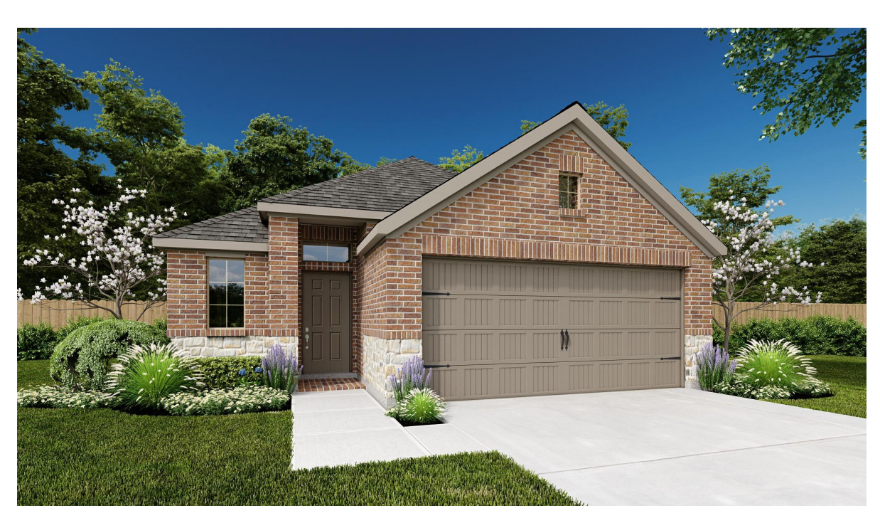
DESIGN 1743W E-30