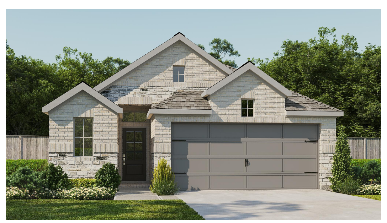
DESIGN 1743W E-54