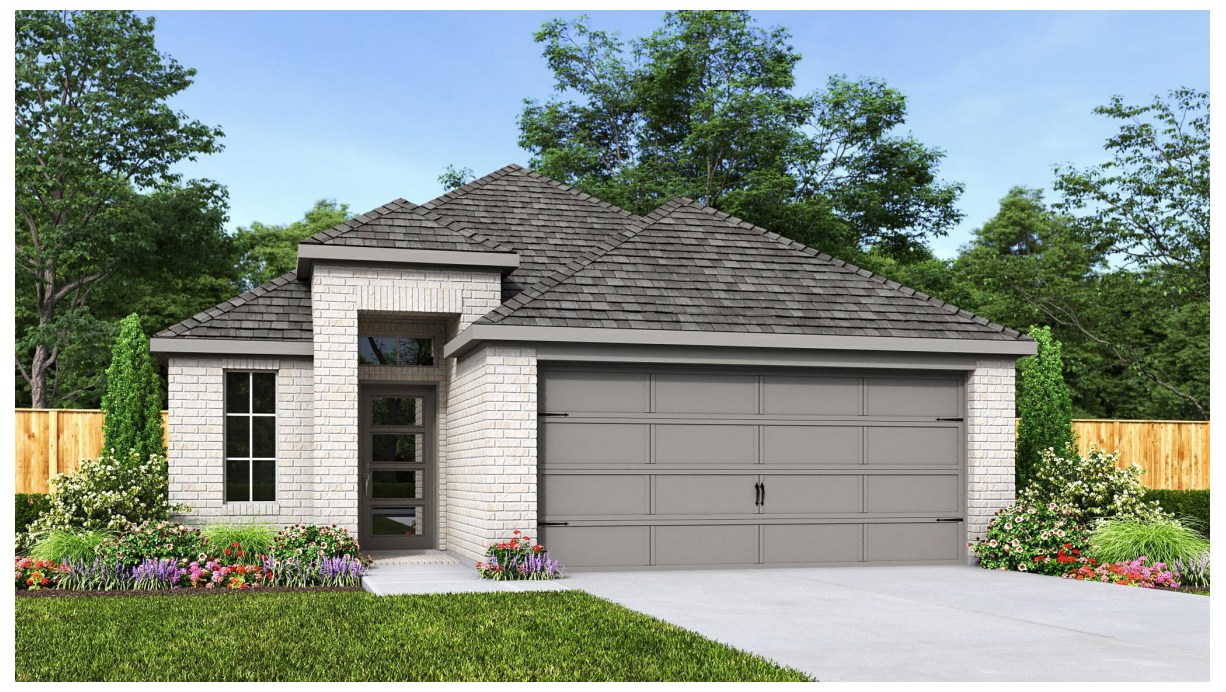
DESIGN 1743W E-1