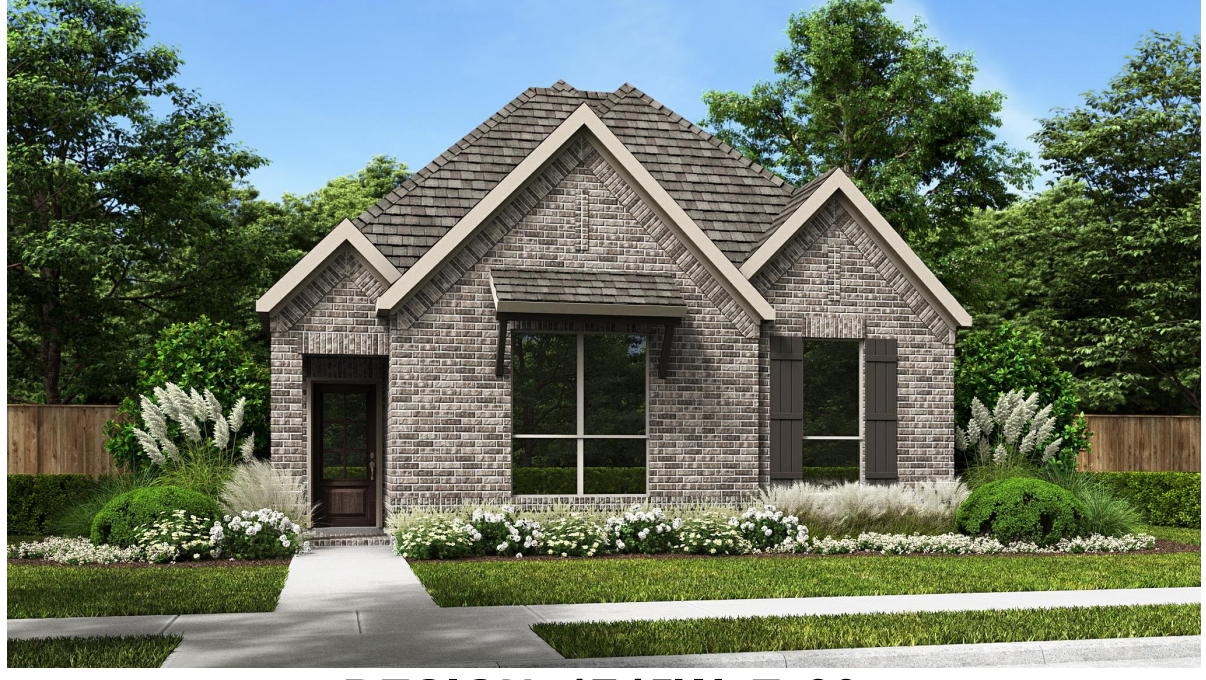
DESIGN 1745W E-30

This design, as originally designed and prior to any changes you make, is estimated to yield approximately the number of square feet shown on page 1. All dimensions are approximate. Square footage may vary based on as-built dimensions, configurations, plan options and/or the method of calculation. Designs are not-to-scale, and are conceptual illustrations that may differ from construction plans or completed improvements. A design may depict features not available on all homesites or in all communities. Perry Homes reserves the right to make changes in plans and specifications, and to substitute material of similar quality. Prices, terms, promotions, plans, dimensions, features, options, amenities, elevations, design does not constitute a committee accommunities are subject to change without notice or obligation. All obligations will be governed by a written contract. This design does not constitute a committee a committee floor plan or home in any given community. Some floor plans, options, and/or elevations may not be available on certain homesites or in a particular community and require additional charges. Please check with Perry Homes to verify current of ferings in the communities you are considering. This rendering is the property of Perry Homes, LLC. Any reproduction or exhibition is strictly prohibited. © Perry Homes, LLC 2022