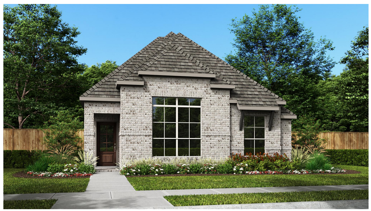
DESIGN 1745W E-1