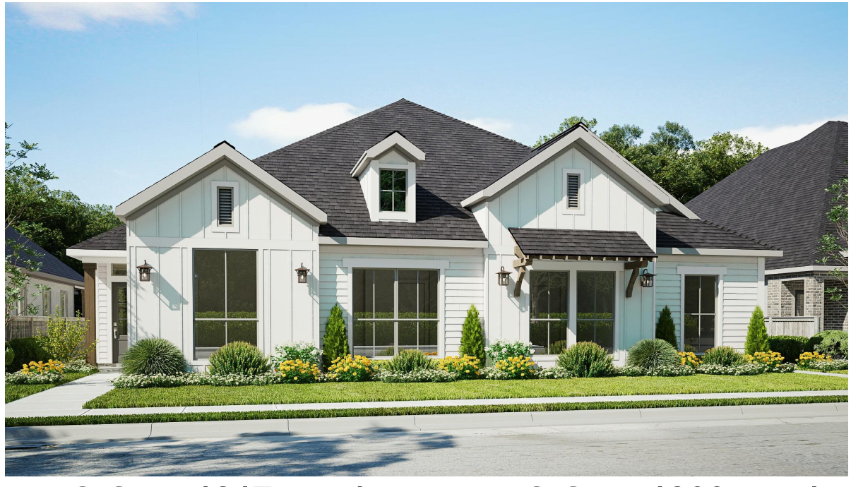
DESIGN 1817 E-1 DESIGN 1800 E-1