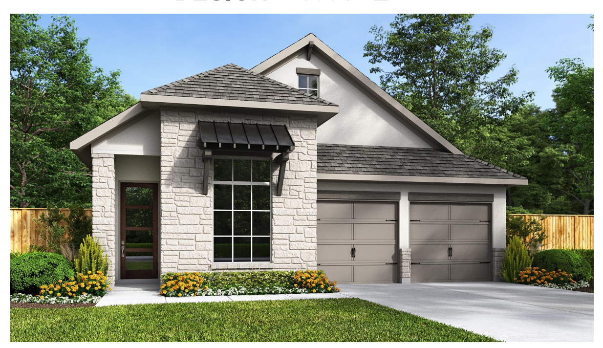
DESIGN 1800S E-50