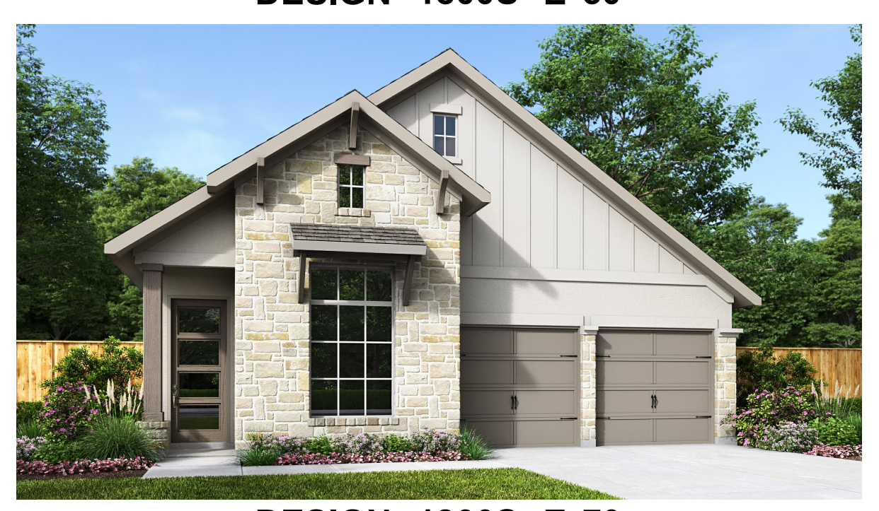
DESIGN 1800S E-70

This design, as originally designed and prior to any changes you make, is estimated to yield approximately the number of square feet shown on page 1. All dimensions are approximate. Square footage may vary based on as-built dimensions, configurations, plan options and/or the method of calculation. Designs are not-to-scale, and are conceptual illustrations that may differ from construction plans or completed improvements. A design may depict features not available on all homesites or in all communities. Perry Homes reserves the right to make changes in plans and specifications, and to substitute material of similar quality. Prices, terms, promotions, plans, dimensions, features, options, amenities, elevations, designs, square footages, specifications, materials, and availability of homes or communities to change without notice or obligation. All obligations will be governed by a written contract. This design does not constitute a commitment to build a particular floor plan or home in any given community. Some floor plans, options, and/or elevations may not be available on certain homesites or in a particular community and may require additional charges. Please check with Perry Homes to verify current offerings in the communities and are considering. This rendering is the property of Perry Homes. LLC. Any reproduction or exhibition is strictly prohibited @ Perry Homes LLC. 2013.