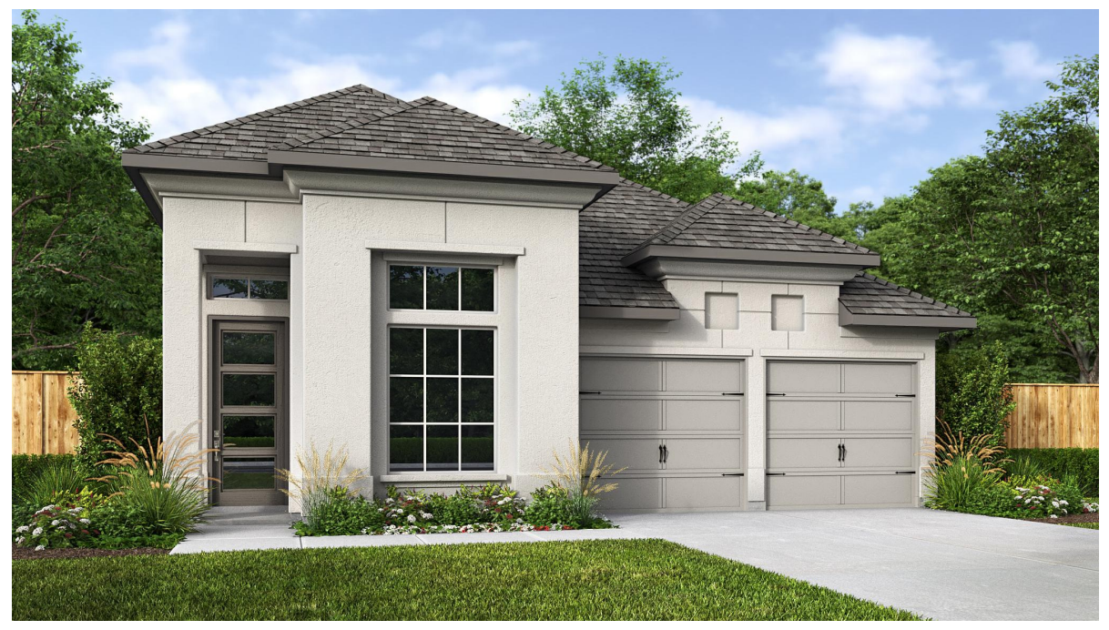
DESIGN 1800S E-1