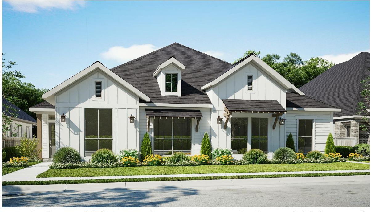
DESIGN 1817 E-1 DESIGN 1800 E-1