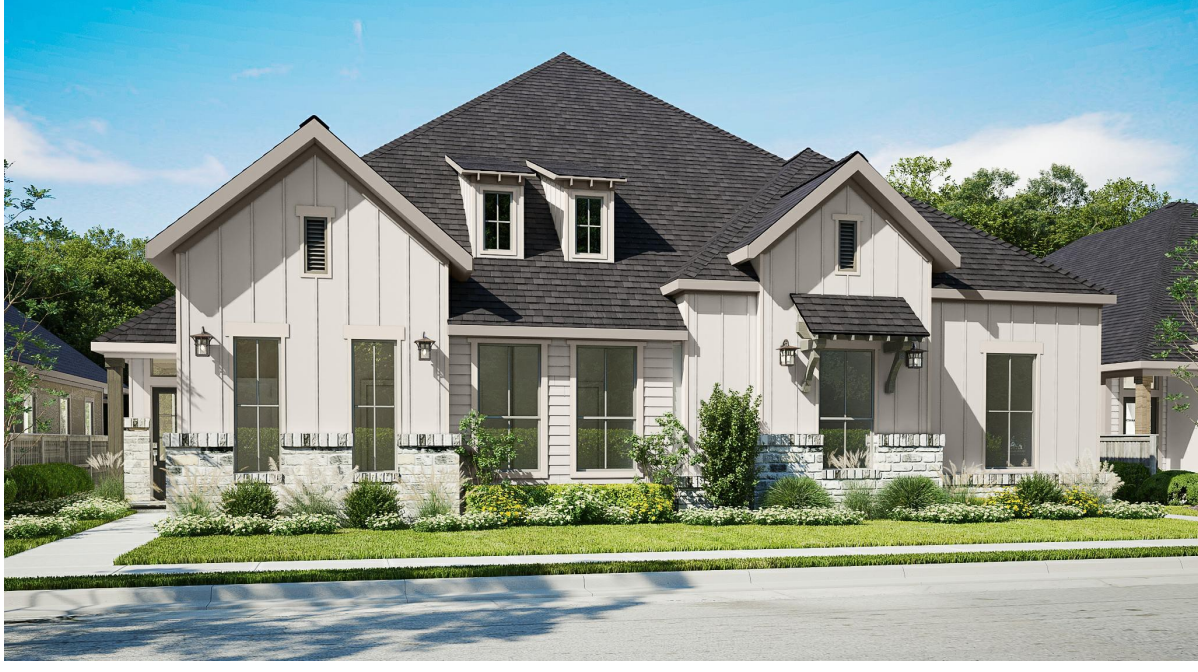
DESIGN 1817 E-50 DESIGN 1800 E-50