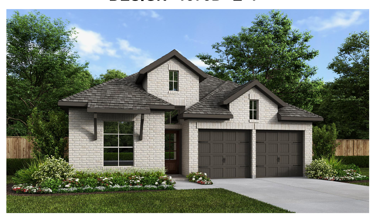
DESIGN 1873D E-2