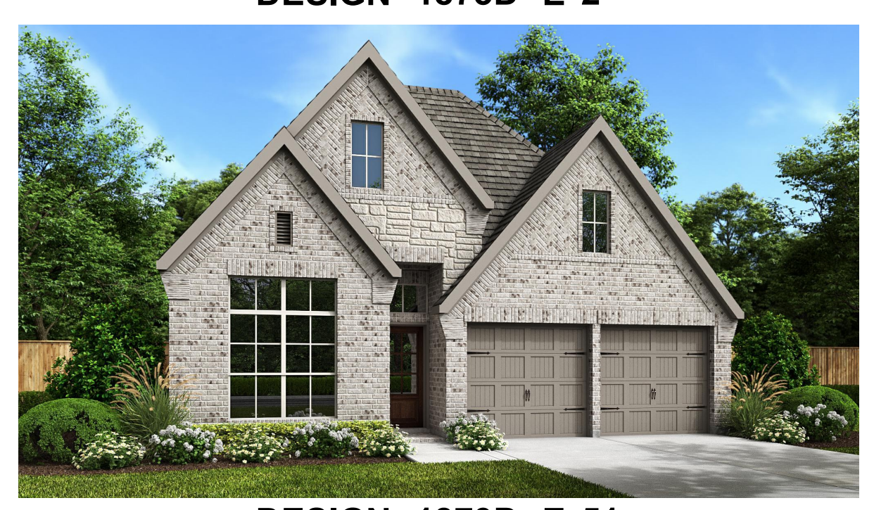
DESIGN 1873D E-51

This design, as originally designed and prior to any changes you make, is estimated to yield approximately the number of square feet shown on page 1. All dimensions are approximate. Square footage may vary based on as-built dimensions, configurations, plan options and/or the method of calculation. Designs are not-to-scale, and are conceptual illustrations that may differ from construction plans or completed improvements. A design may depict features not available on all homesites or in all communities. Perry Homes reserves the right to make changes in plans and specifications, and to substitute material of similar quality. Prices, terms, promotions, plans, dimensions, features, options, amenities, elevations, designs, square footages, specifications, materials, and availability of homes or communities are subject to change without notice or obligation. All obligations will be governed by a written contract. This design does not constitute a commitment to build a particular floor plan or home in any given community Some floor plans, options, and/or elevations may not be available on certain homesites or in a particular community and may require additional charges. Please check with Perry Homes to verify current offerings in the communities you are considering. This rendering is the property of Perry Homes. LLC. Any reproduction or exhibition is strictly prohibited. © Perry Homes. LLC 2024