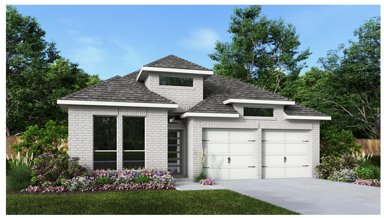
DESIGN 1873D E-1