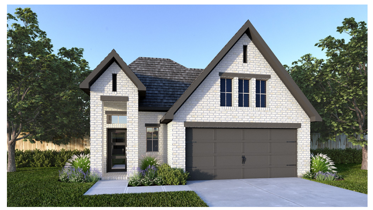
DESIGN 1878W E-1