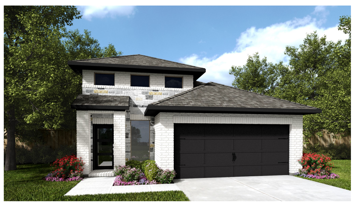
DESIGN 1878W E-30