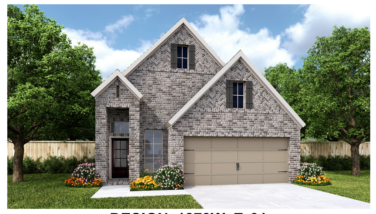
DESIGN 1878W E-31

This design, as originally designed and prior to any changes you make, is estimated to yield approximately the number of square feet shown on page 1. All dimensions are approximate. Square footage may vary based on as-built dimensions, configurations, plan options and/or the method of calculation. Designs are not-to-scale, and are conceptual illustrations that may differ from construction plans or completed improvements. A design may depict features not available on all homesites or in all communities. Perry Homes reserves the right to make changes in plans and specifications, and to substitute material of similar quality. Prices, terms, promotions, plans, dimensions, features, options, amenities, elevations, designs, square footages, specifications, materials, and availability of homes or communities are subject to change without notice or obligation. All obligations will be governed by a written contract. This design does not constitute a commitment to build a particular floor plan or home in any given community of the property of perry Homes. LLC and the community and may require additional charges. Please check with Perry Homes to verify current offerings in the communities you are considering. This rendering is the property of Perry Homes. LLC. Any reproduction or exhibition is strictly prohibited. © Perry Homes. LLC 2023