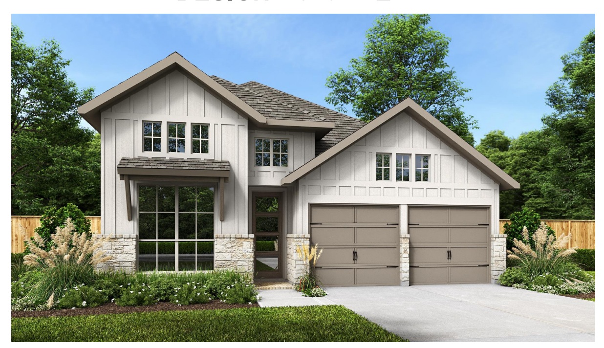
DESIGN 1910W E-30