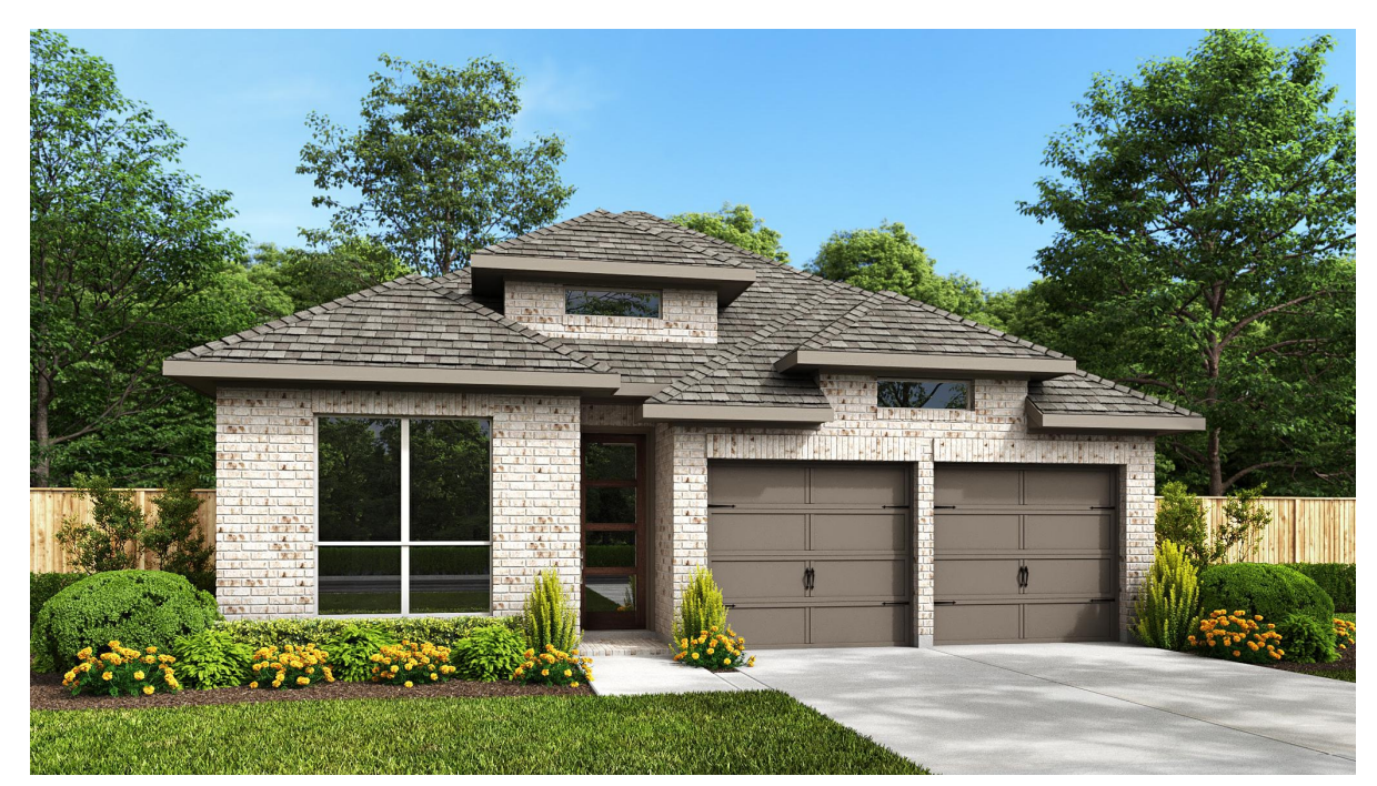
DESIGN 1910W E-1