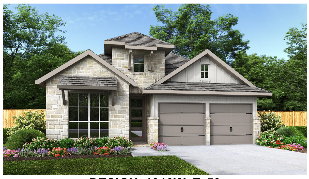
DESIGN 1910W E-50

This design, as originally designed and prior to any changes you make, is estimated to yield approximately the number of square feet shown on page 1. All dimensions are approximate. Square footage may vary based on as-built dimensions, configurations, plan options and/or the method of calculation. Designs are not-to-scale, and are conceptual illustrations that may differ from construction plans or completed improvements. A design may depict features not available on all homesites or in all communities. Perry Homes reserves the right to make changes in plans and specifications, and to substitute material of similar quality. Prices, terms, promotions, plans, dimensions, features, options, amenities, elevations, designs, square footages, specifications, materials, and availability of homes or communities to change without notice or obligation. All obligations will be governed by a written contract. This design does not constitute a commitment to build a particular floor plan or home in any given community. Some floor plans, options, and/or elevations may not be available on certain homesites or in a particular community and may require additional charges. Please check with Perry Homes to verify current offerings in the communities on are considering. This rendering is the property of Perry Homes. LLC. Any reproduction or exhibition is strictly prohibited @ Perry Homes LLC. 2019.