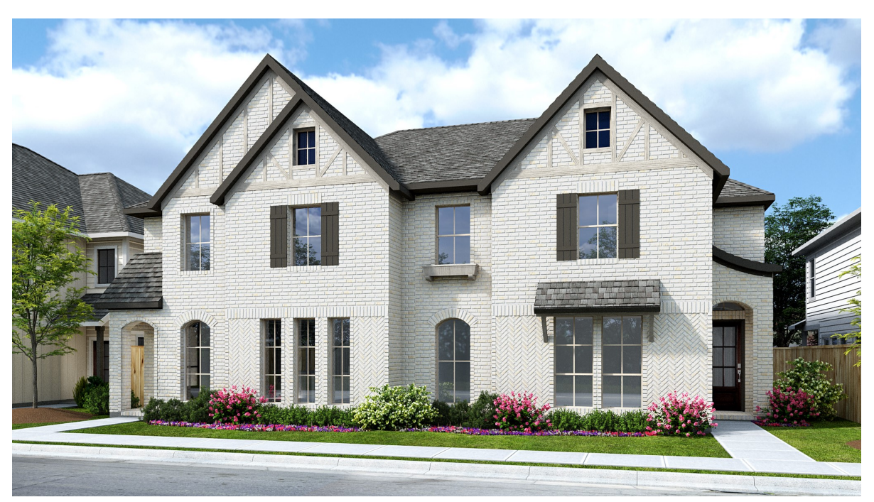
DESIGN 1915 E-71 DESIGN 1929 E-71

This design, as originally designed and prior to any changes you make, is estimated to yield approximately the number of square feet shown on page 1. All dimensions are approximate. Square footage may vary based on as-built dimensions, configurations, plan options and/or the method of calculation. Designs are not-to-scale, and are conceptual illustrations that may differ from construction plans or completed improvements. A design may depict features not available on all homesites or in all communities. Perry Homes reserves the right to make changes in plans and specifications, and to substitute material or similar quality. Prices, terms, promotions, plans, dimensions, features, options, amenities, elevations, designs, square footages, specifications, materials, and availability of homes or communities are subject to change without notice or obligation. All obligations will be governed by a written contract. This design does not constitute a commitment to build a particular floor plan or home in any given community some floor plans, options, and/or elevations may not be available on certain homesites or in a particular community and may require additional charges. Please check with Perry Homes to verify current offerings in the communities you are considering. This rendering is the property of Perry Homes, LLC. Any reproduction or exhibition is strictly prohibited. © Perry Homes, LLC 2023