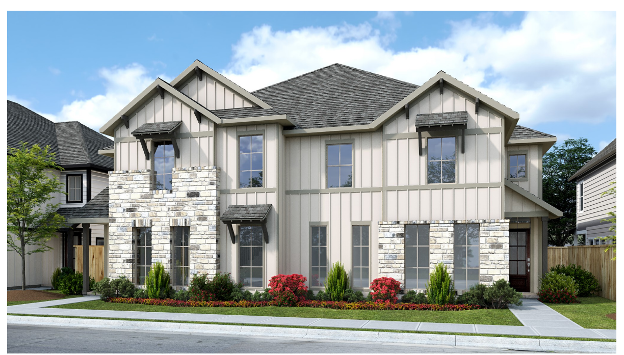
DESIGN 1915 E-50 DESIGN 1929 E-50