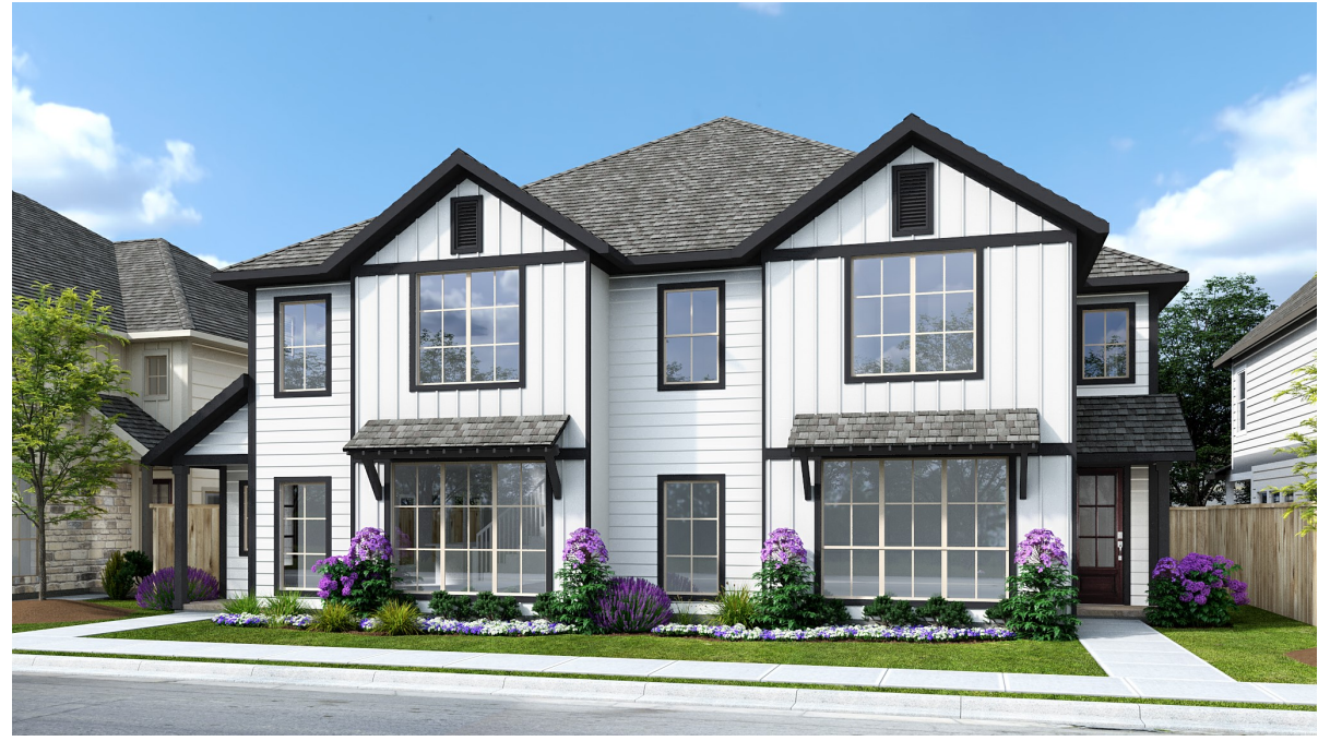
DESIGN 1915 E-1 DESIGN 1929 E-1