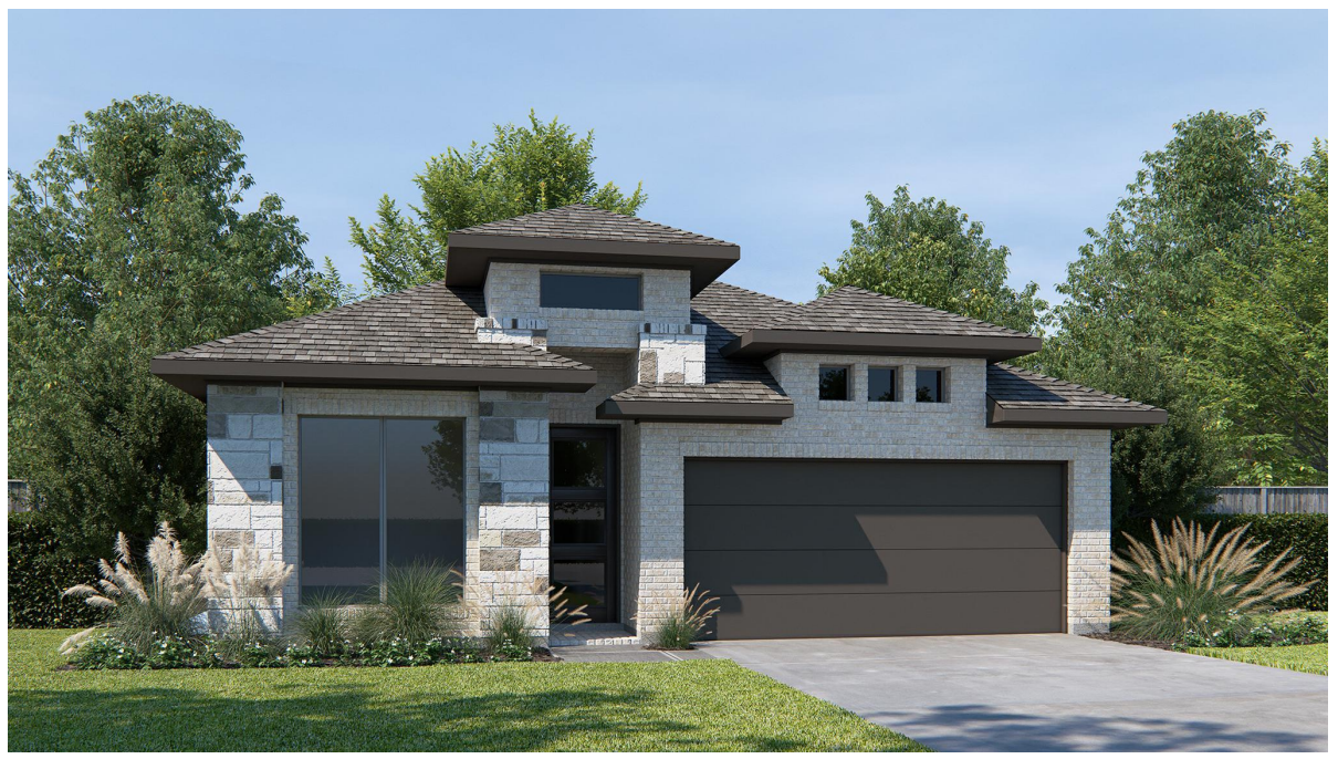
DESIGN 1950P E-30

This design, as originally designed and prior to any changes you make, is estimated to yield approximately the number of square feet shown on page 1. All dimensions are approximate. Square footage may vary based on as-built dimensions, configurations, plan options and/or the method of calculation. Designs are not-to-scale, and are conceptual illustrations that may differ from construction plans or completed improvements. A design may depict features not available on all homesites or in all communities. Perry Homes reserves the right to make changes in plans and specifications, and to substitute material of similar quality. Prices, terms, promotions, plans, dimensions, features, options, amenities, elevations, design des not constitute a committee acommunities are subject to change without notice or obligation. All obligations will be governed by a written contract. This design does not constitute a committen to build a particular floor plan or home in any given community. Some floor plans, options, and/or elevations may not be available on certain homesites or in a particular community and may require additional charges. Please check with Perry Homes to verify current of ferings in the communities you are considering. This rendering is the property of Perry Homes, LLC. Any reproduction or exhibition is strictly prohibited. © Perry Homes, LLC 2023