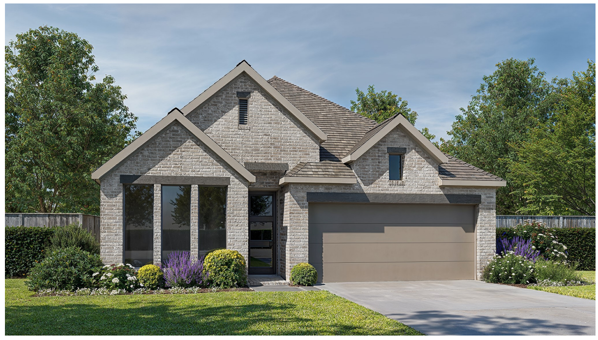
DESIGN 1950P E-1