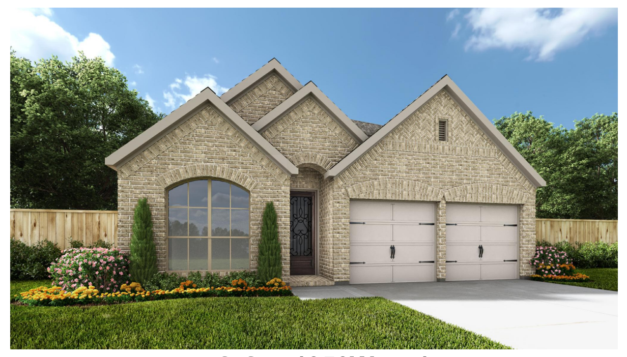
DESIGN 1950W E-1