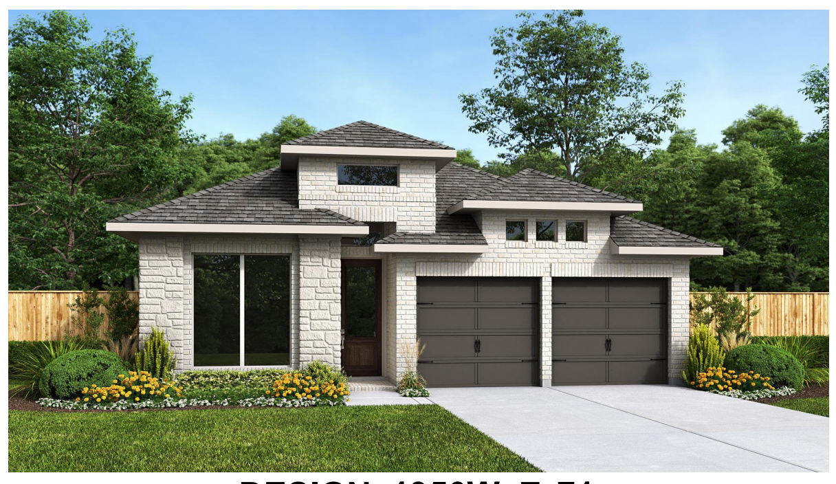
DESIGN 1950W E-71

This design, as originally designed and prior to any changes you make, is estimated to yield approximately the number of square feet shown on page 1. All dimensions are approximate. Square footage may vary based on as-built dimensions, configurations, plan options and/or the method of calculation. Designs are not-to-scale, and are conceptual illustrations that may differ from construction plans or completed improvements. A design may depict features not available on all homesites or in all communities. Perry Homes reserves the right to make changes in plans and specifications, and to substitute material of similar quality. Prices, terms, promotions, plans, dimensions, features, options, amenities, elevations, designs, square footages, specifications, materials, and availability of homes or communities are subject to change without notice or obligation. All obligations will be governed by a written contract. This design does not constitute a commitment to build a particular floor plan or home in any given community Some floor plans, and/or elevations may not be available on certain homesites or in a particular community and may require additional charges. Please check with Perry Homes to verify current offerings in the communities you are considering. This rendering is the property of Perry Homes. LLC. Any reproduction or exhibition is strictly prohibited. © Perry Homes. LLC 2023