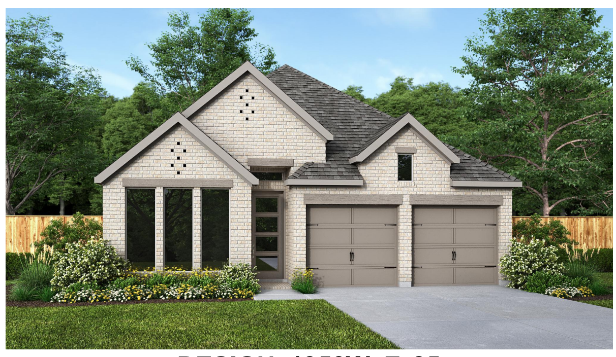
DESIGN 1950W E-35