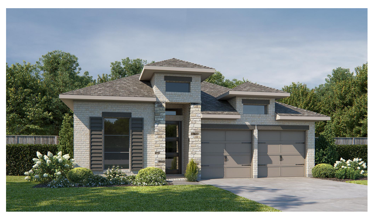
DESIGN 1950W E-53