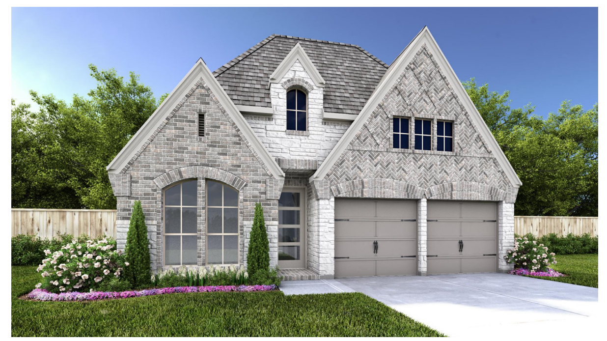
DESIGN 1950W E-52