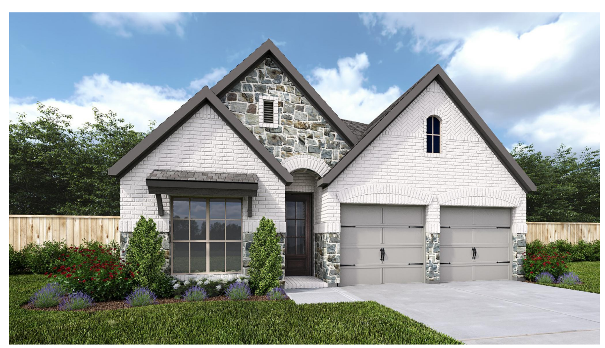
DESIGN 1950W E-33