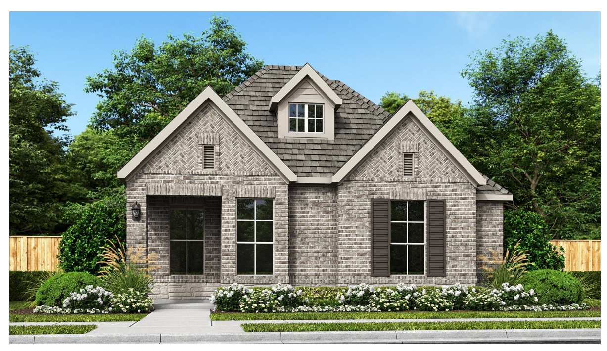
DESIGN 1957W E-1