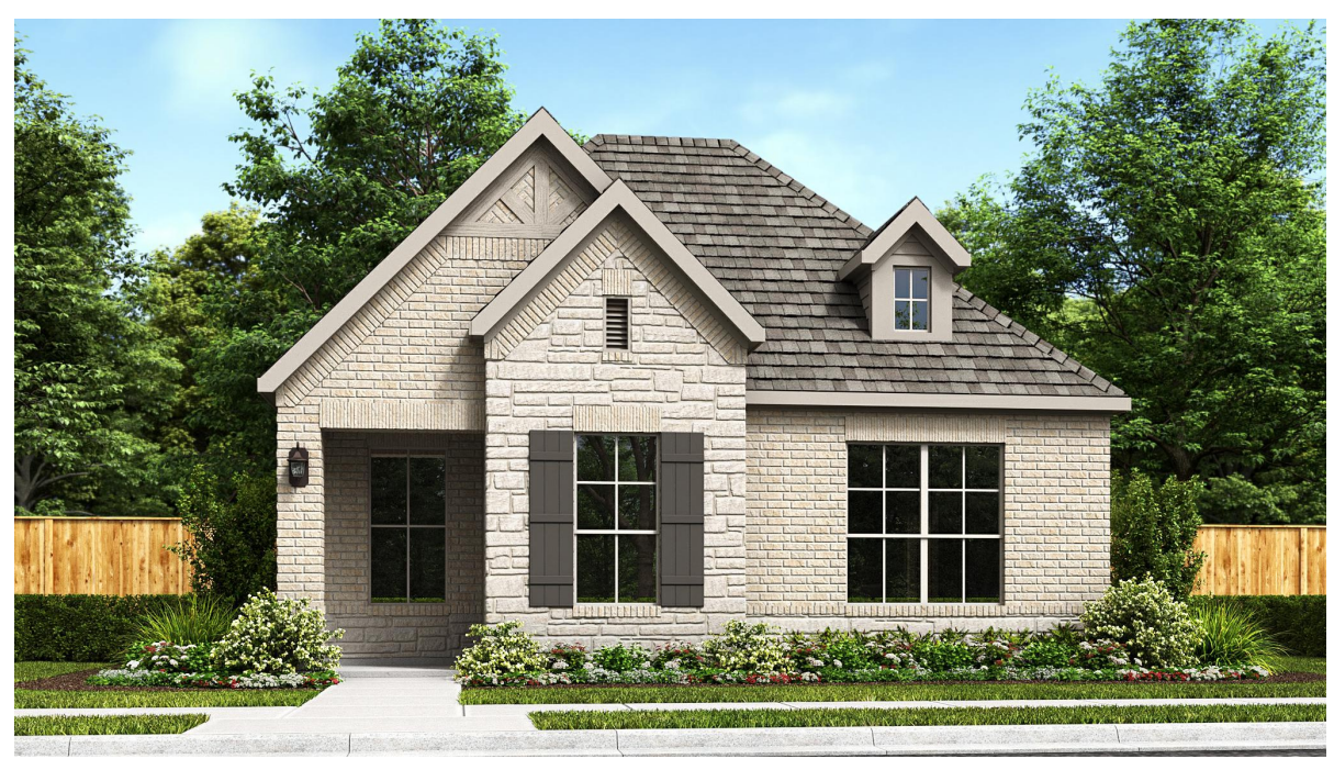
DESIGN 1957W E-30

This design, as originally designed and prior to any changes you make, is estimated to yield approximately the number of square feet shown on page 1. All dimensions are approximate. Square footage may vary based on as-built dimensions, configurations, plan options and/or the method of calculation. Designs are not-to-scale, and are conceptual illustrations that may differ from construction plans or completed improvements. A design may depict features not available on all homesites or in all communities. Perry Homes reserves the right to make changes in plans and specifications, and to substitute material of similar quality. Prices, terms, promotions, plans, dimensions, features, options, amenities, elevations, designs, square footages, specifications, materials, and availability of homes or communities are subject to change without notice or obligation. All obligations will be governed by a written contract. This design does not constitute a commitment to build a particular floor plan or home in any given community of the property of perry Homes. LLC and may require additional charges. Please check with Perry Homes to verify current offerings in the communities you are considering. This rendering is the property of Perry Homes. LLC. Any reproduction or exhibition is strictly prohibited. © Perry Homes. LLC 2024