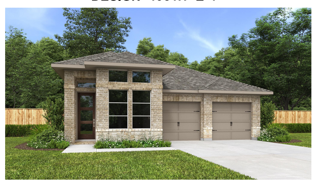
DESIGN 1981H E-31