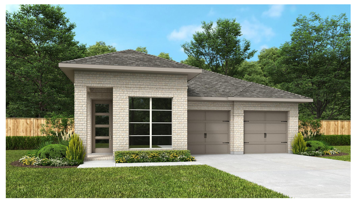
DESIGN 1981H E-1