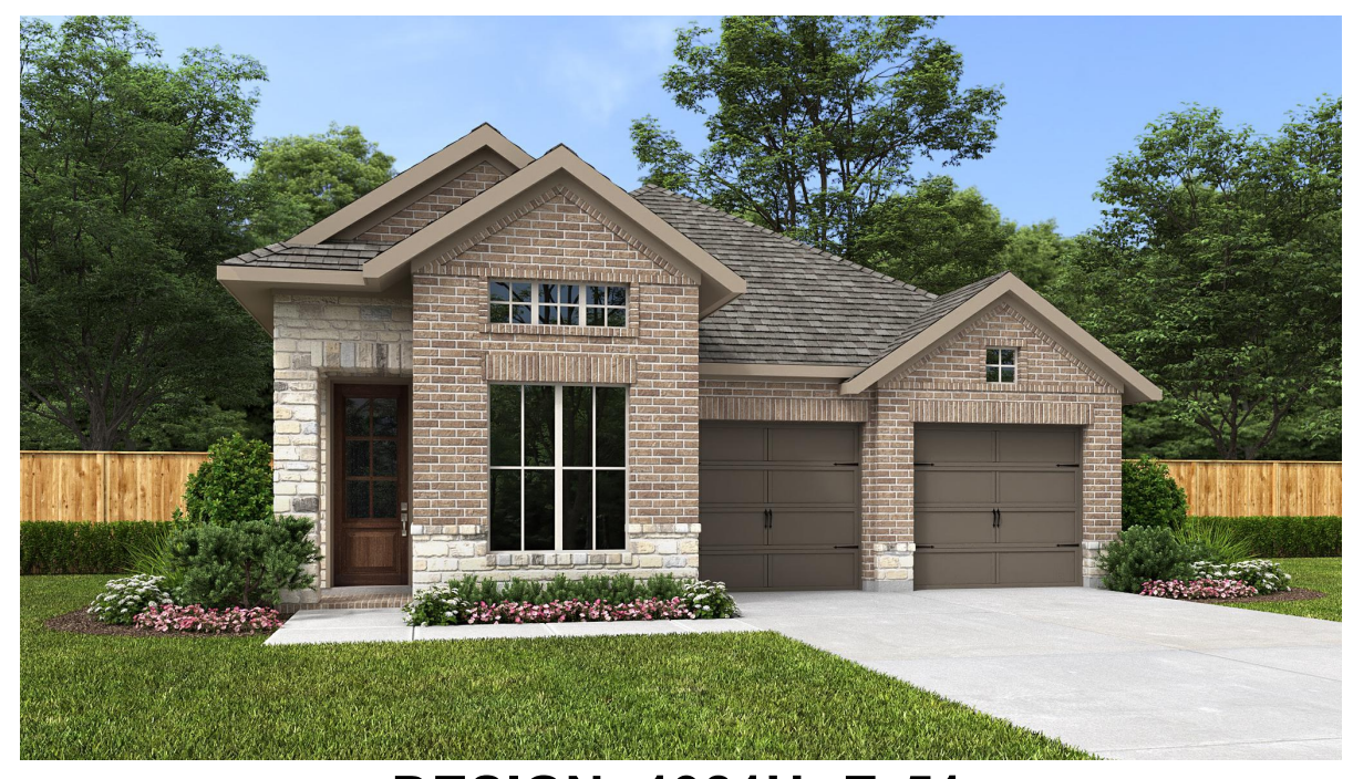
DESIGN 1981H E-51

This design, as originally designed and prior to any changes you make, is estimated to yield approximately the number of square feet shown on page 1. All dimensions are approximate. Square footage may vary based on as-built dimensions, configurations, plan options and/or the method of calculation. Designs are not-to-scale, and are conceptual illustrations that may differ from construction plans or completed improvements. A design may depict features not available on all homesites or in all communities. Perry Homes reserves the right to make changes in plans and specifications, and to substitute material of similar quality. Prices, terms, promotions, plans, dimensions, features, options, amenities, elevations, designs, square footages, specifications, materials, and availability of homes or communities are subject to change without notice or obligation. All obligations will be governed by a written contract. This design does not constitute a commitment to build a particular floor plan or home in any given community Some floor plans, options, and/or elevations may not be available on certain homesites or in a particular community and may require additional charges. Please check with Perry Homes to verify current offerings in the communities vou are considering. This rendering is the property of Perry Homes LLC. Any reproduction or exhibition is strictly prohibited. @ Perry Homes LLC. 2013.