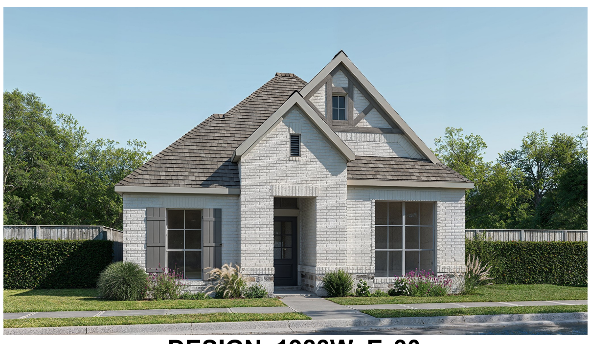
DESIGN 1983W E-30

This design, as originally designed and prior to any changes you make, is estimated to yield approximately the number of square feet shown on page 1. All dimensions are approximate. Square footage may vary based on as-built dimensions, configurations, plan options and/or the method of calculation. Designs are not-to-scale, and are conceptual illustrations that may differ from construction plans or completed improvements. A design may depict features not available on all homesites or in all communities. Perry Homes reserves the right to make changes in plans and specifications, and to substitute material of similar quality. Prices, terms, promotions, plans, dimensions, features, options, amenities, elevations, designs, square footages, specifications, materials, and availability of homes or communities to change without notice or obligation. All obligations will be governed by a written contract. This design does not constitute a commitment to build a particular floor plan or home in any given community. Some floor plans, options, and/or elevations may not be available on certain homesites or in a particular community and may require additional charges. Please check with Perry Homes to verify current offerings in the communities and are considering. This rendering is the property of Perry Homes. LLC. Any reproduction or exhibition is strictly prohibited @ Perry Homes LLC. 2019.