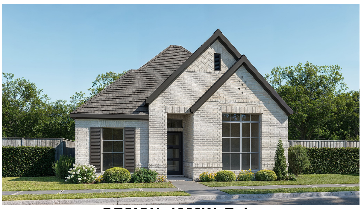
DESIGN 1983W E-1