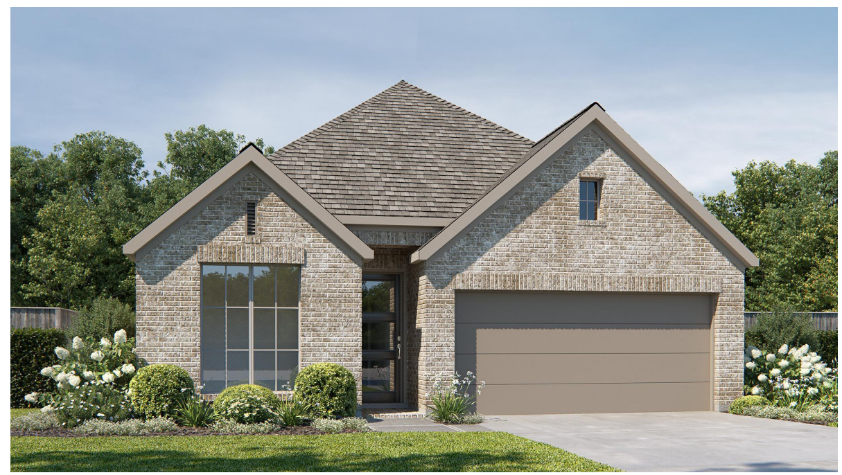
DESIGN 1984P E-1