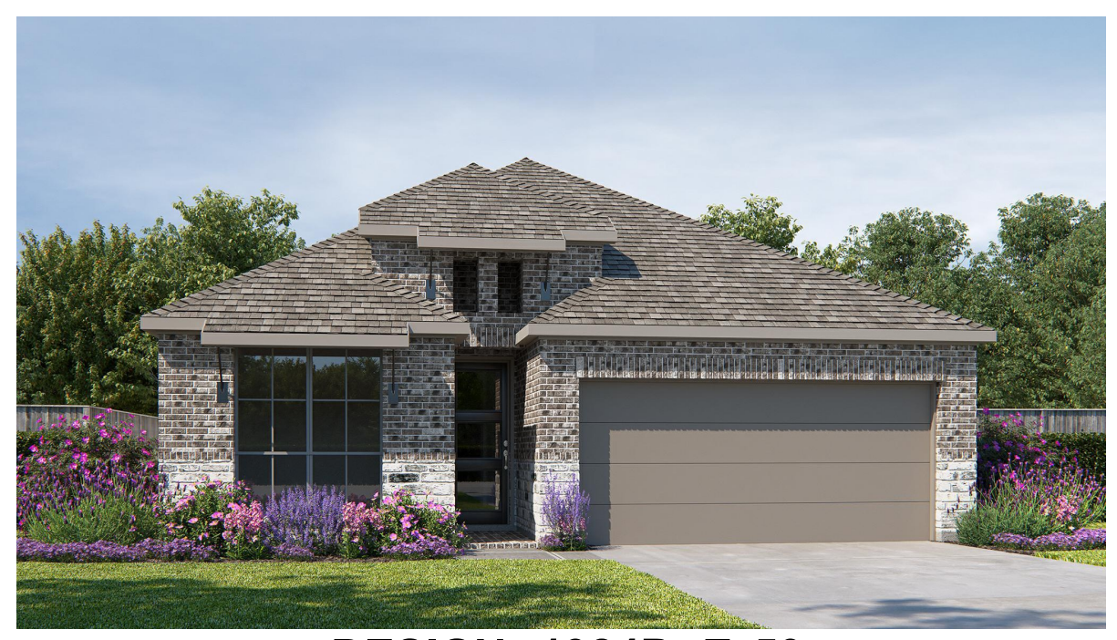
DESIGN 1984P E-50