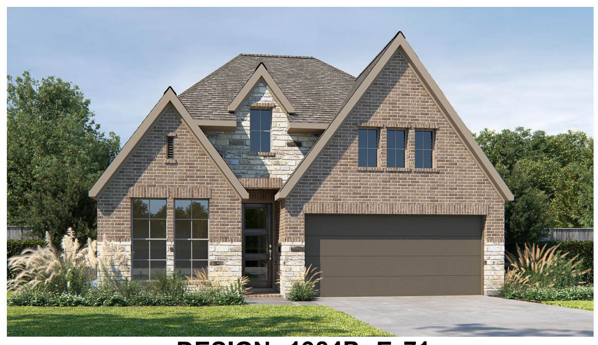
DESIGN 1984P E-71

This design, as originally designed and prior to any changes you make, is estimated to yield approximately the number of square feet shown on page 1. All dimensions are approximate. Square footage may vary based on as-built dimensions, configurations, plan options and/or the method of calculation. Designs are not-to-scale, and are conceptual illustrations that may differ from construction plans or completed improvements. A design may depict features not available on all homesites or in all communities. Perry Homes reserves the right to make changes in plans and specifications, and to substitute material of similar quality. Prices, terms, promotions, plans, dimensions, features, options, amenities, elevations, designs, square footages, specifications, materials, and availability of homes or communities to change without notice or obligation. All obligations will be governed by a written contract. This design does not constitute a commitment to build a particular floor plan or home in any given community. Some floor plans, options, and/or elevations may not be available on certain homesites or in a particular community and may require additional charges. Please check with Perry Homes to verify current offerings in the communities on a green considering. This rendering is the property of Perry Homes. LLC. Any reproduction or exhibition is strictly prohibited @ Perry Homes LLC. 2019