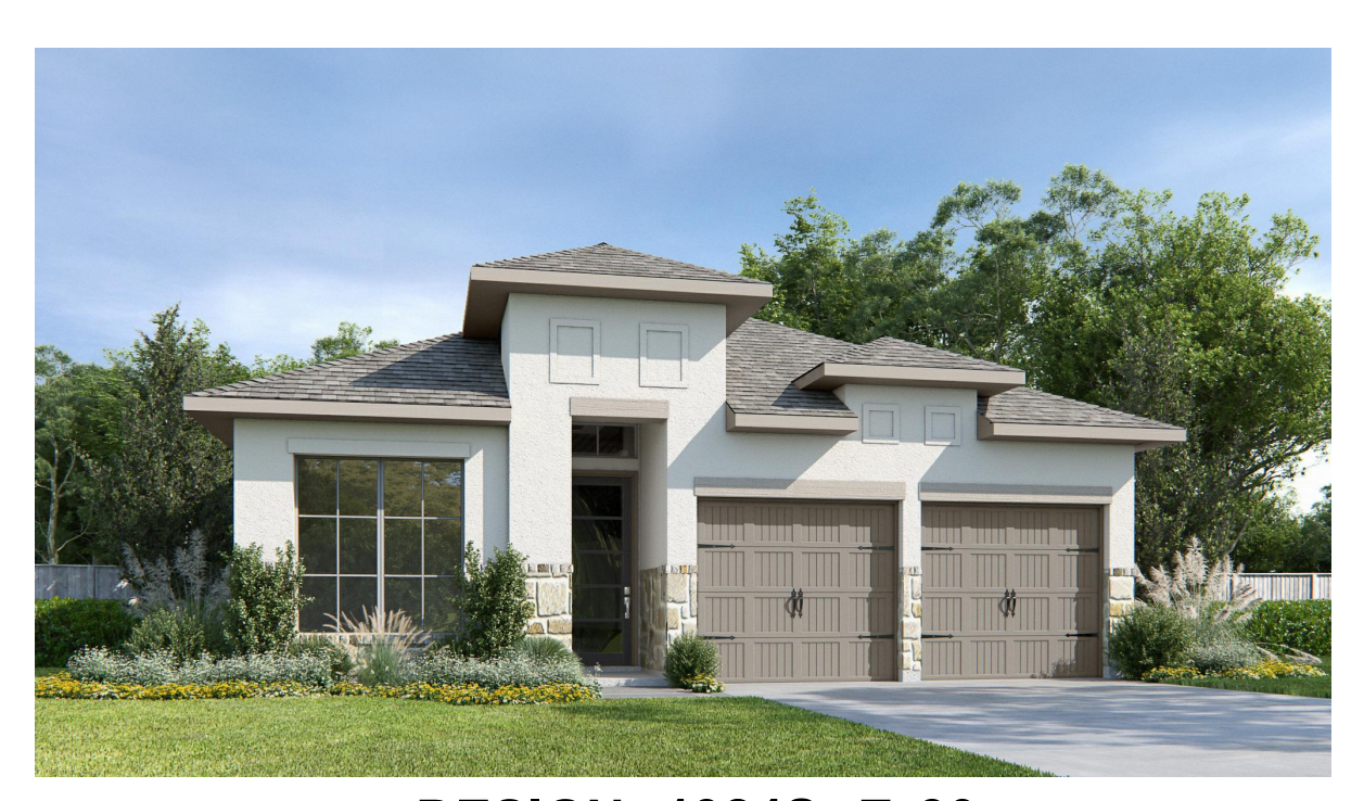
DESIGN 1984S E-30