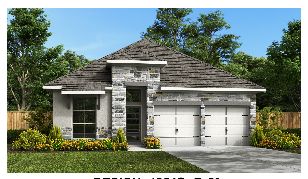
DESIGN 1984S E-50

This design, as originally designed and prior to any changes you make, is estimated to yield approximately the number of square feet shown on page 1. All dimensions are approximate. Square footage may vary based on as-built dimensions, configurations, plan options and/or the method of calculation. Designs are not-to-scale, and are conceptual illustrations that may differ from construction plans or completed improvements. A design may depict features not available on all homesites or in all communities. Perry Homes reserves the right to make changes in plans and specifications, and to substitute material of similar quality. Prices, terms, promotions, plans, dimensions, features, options, amenities, elevations, designs, square footages, specifications, materials, and availability of homes or communities to change without notice or obligation. All obligations will be governed by a written contract. This design does not constitute a commitment to build a particular floor plan or home in any given community. Some floor plans, options, and/or elevations may not be available on certain homesites or in a particular community and may require additional charges. Please check with Perry Homes to verify current offerings in the communities and are considering. This rendering is the property of Perry Homes. LLC. Any reproduction or exhibition is strictly prohibited @ Perry Homes LLC. 2018