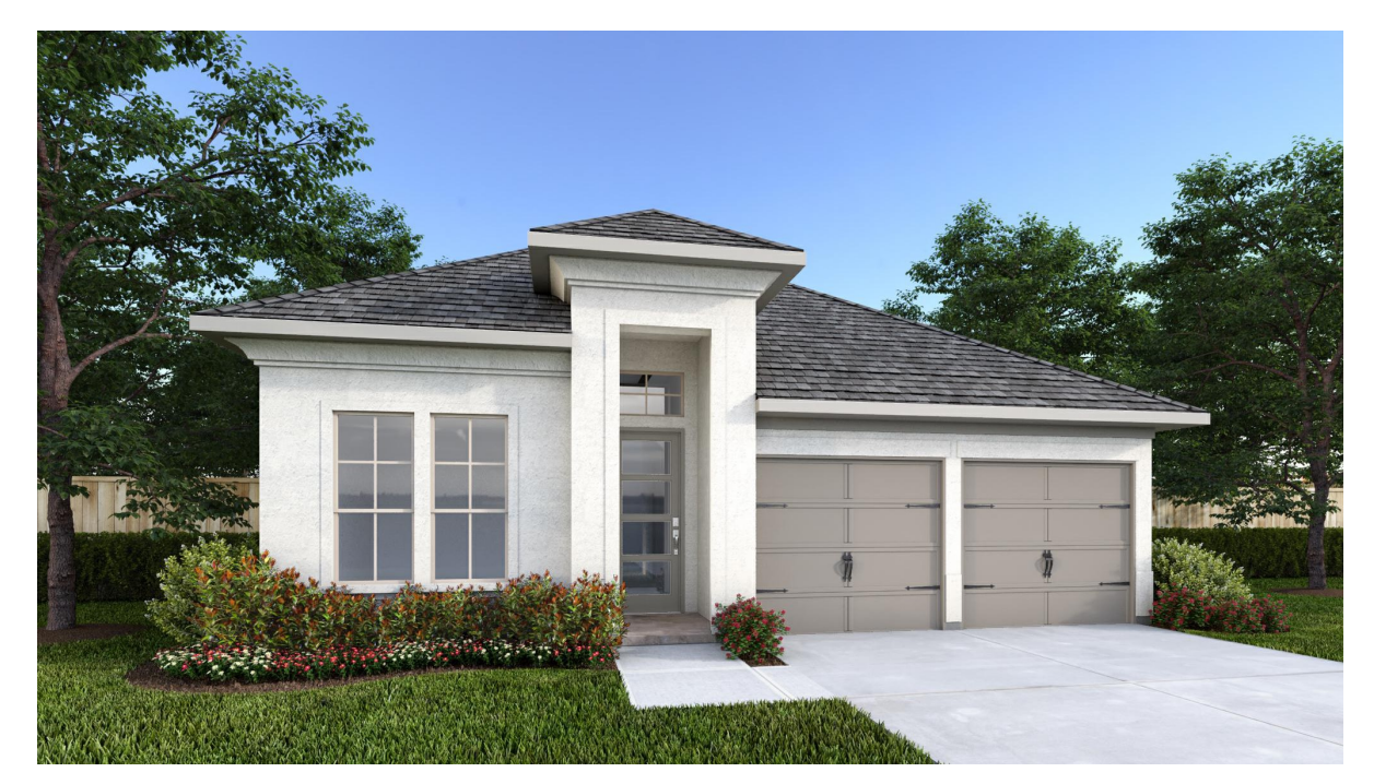
DESIGN 1984S E-1