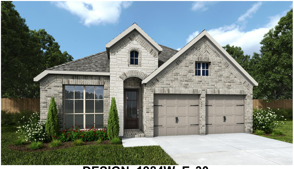
DESIGN 1984W E-30