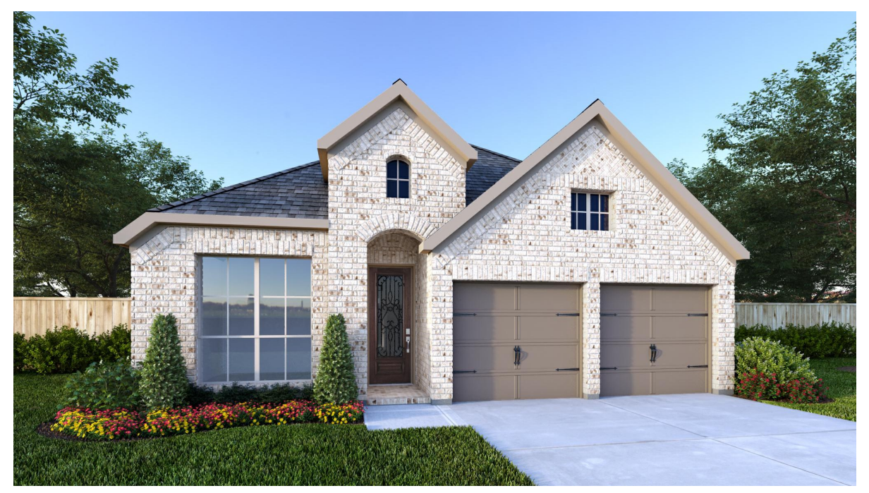
DESIGN 1984W E-1