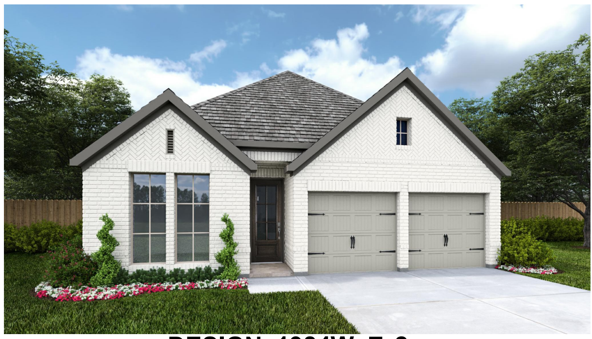
DESIGN 1984W E-2