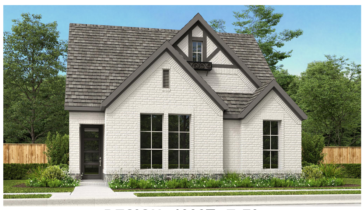
DESIGN 1993T E-70

This design, as originally designed and prior to any changes you make, is estimated to yield approximately the number of square feet shown on page 1. All dimensions are approximate. Square footage may vary based on as-built dimensions, configurations, plan options and/or the method of calculation. Designs are not-to-scale, and are conceptual illustrations that may differ from construction plans or completed improvements. A design may depict features not available on all homesites or in all communities. Perry Homes reserves the right to make changes in plans and specifications, and to substitute material of similar quality. Prices, terms, promotions, plans, dimensions, features, options, amenities, elevations, designs, square footages, specifications, materials, and availability of homes or communities are subject to change without notice or obligation. All obligations will be governed by a written contract. This design does not constitute a commitment to build a particular floor plan or home in any given community some may require additional charges. Please check with Perry Homes to verify current offerings in the communities you are considering. This rendering is the property of Perry Homes. LLC. Any reproduction or exhibition is strictly prohibited. © Perry Homes. LLC 2022