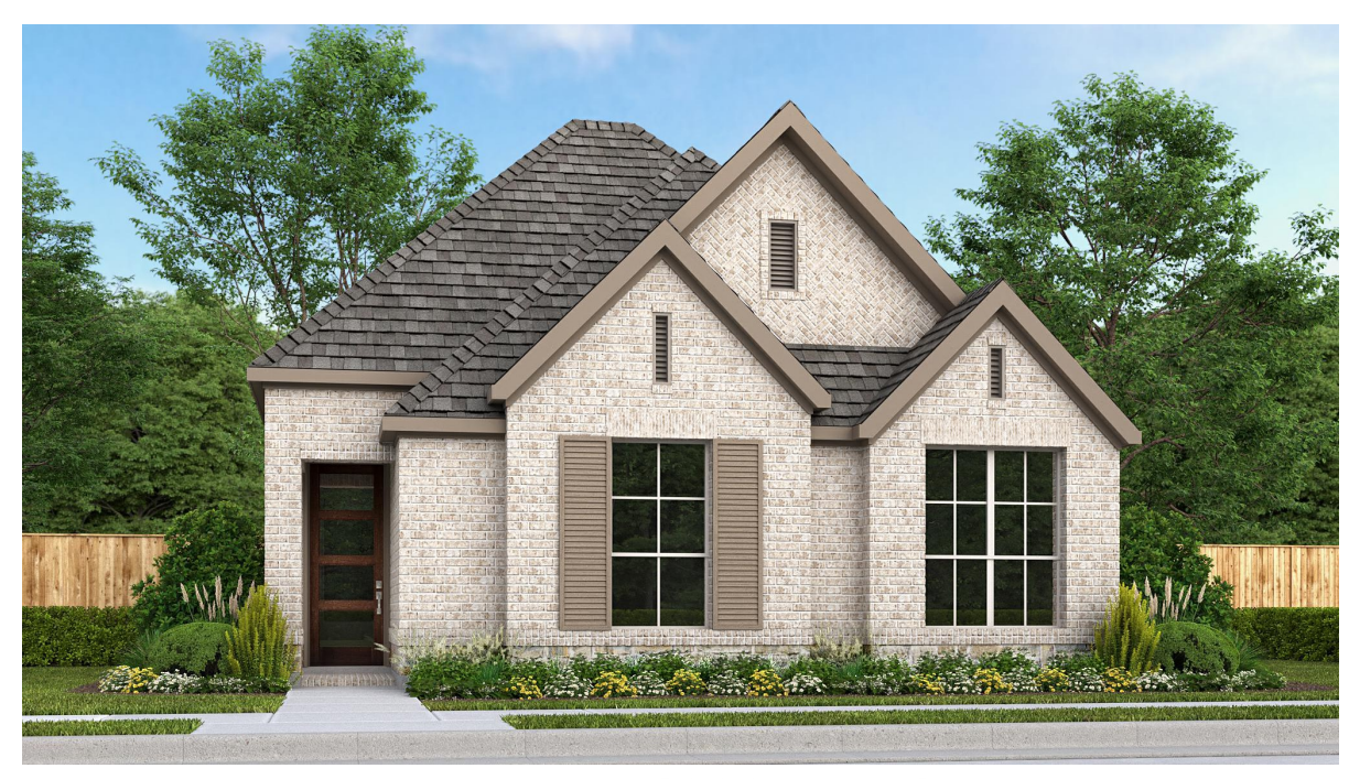
DESIGN 1993T E-1