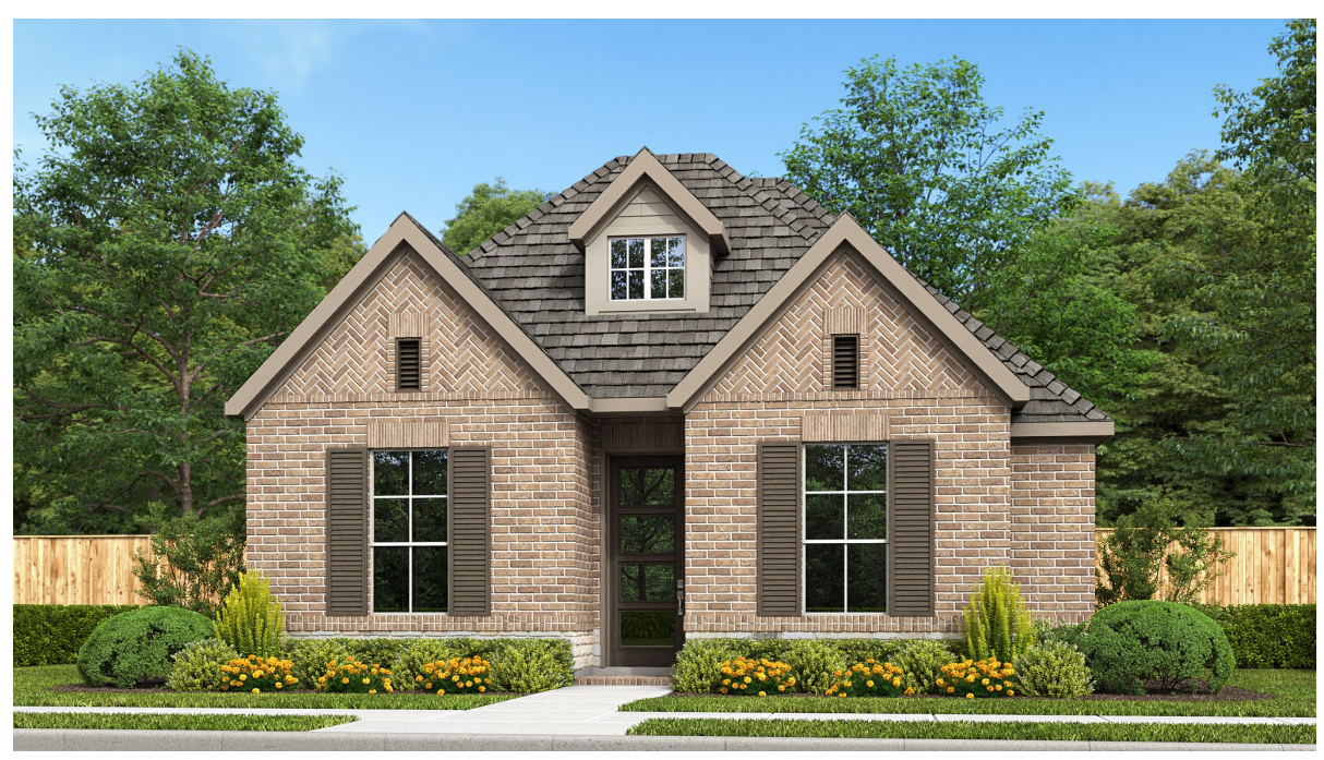
DESIGN 2024T E-1