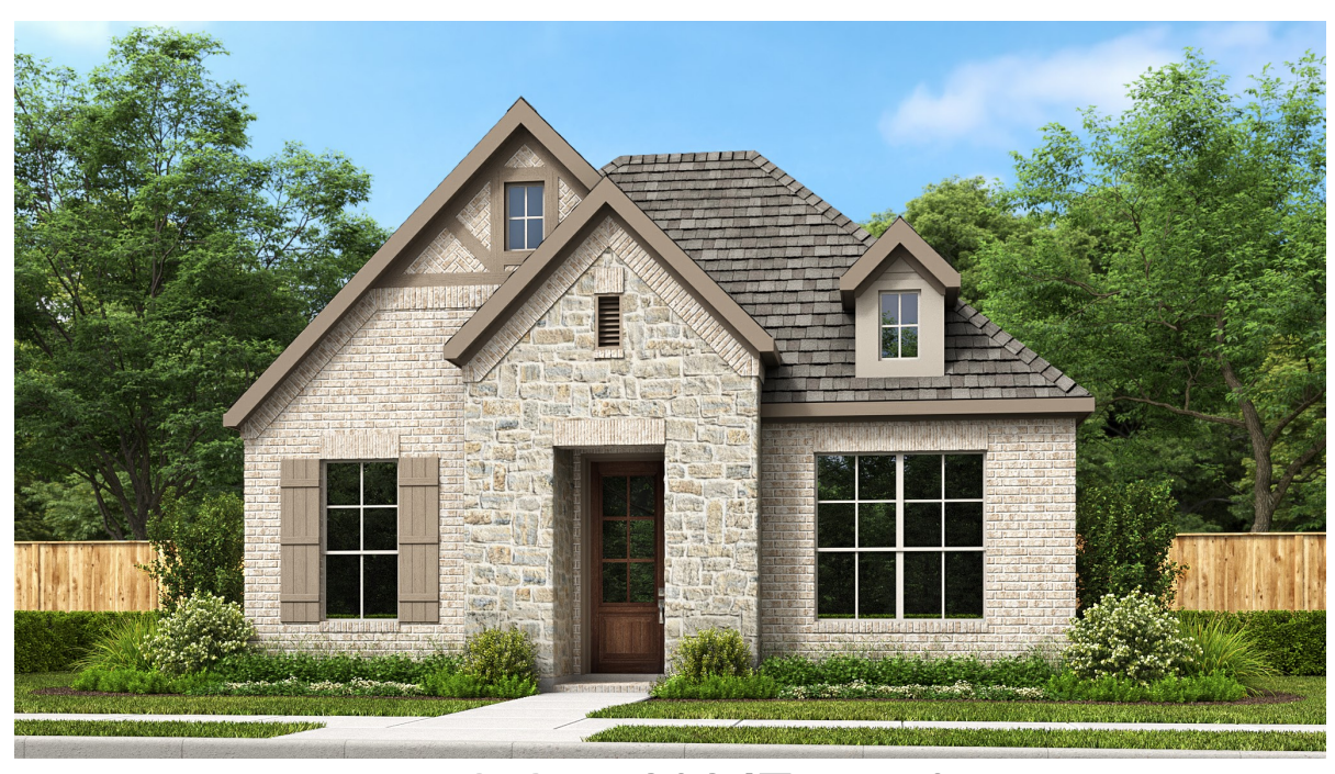
DESIGN 2024T E-50

This design, as originally designed and prior to any changes you make, is estimated to yield approximately the number of square feet shown on page 1. All dimensions are approximate. Square footage may vary based on as-built dimensions, configurations, plan options and/or the method of calculation. Designs are not-to-scale, and are conceptual illustrations that may differ from construction plans or completed improvements. A design may depict features not available on all homesites or in all communities. Perry Homes reserves the right to make changes in plans and specifications, and to substitute material of similar quality. Prices, terms, promotions, plans, dimensions, features, options, amenities, elevations, designs, square footages, specifications, materials, and availability of homes or communities are subject to change without notice or obligation. All obligations will be governed by a written contract. This design does not constitute a commitment to build a particular floor plan or home in any given community some floor plans, options, and/or elevations may not be available on certain homesites or in a particular community and may require additional charges. Please check with Perry Homes to verify current offerings in the communities you are considering. This rendering is the property of Perry Homes. LLC. Any reproduction or exhibition is strictly prohibited. © Perry Homes. LLC. 2023