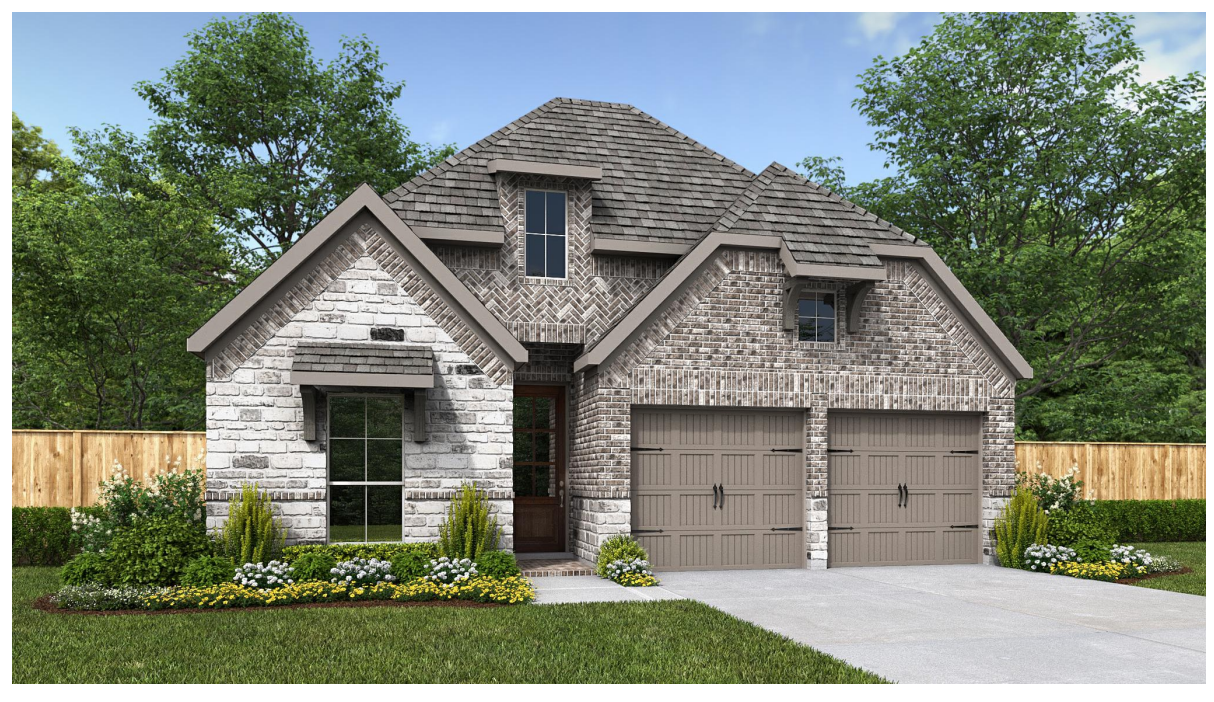
DESIGN 2026W E-51