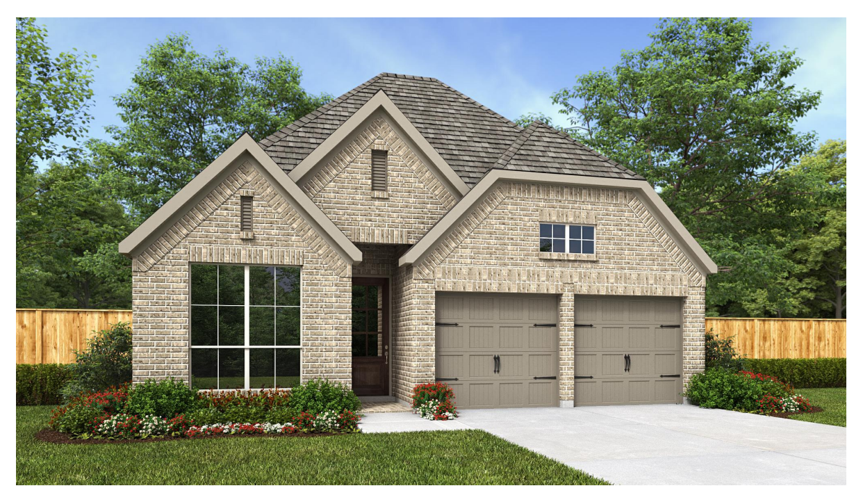
DESIGN 2026W E-1