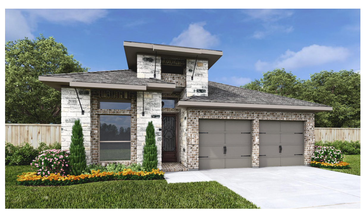
DESIGN 2026W E-71

This design, as originally designed and prior to any changes you make, is estimated to yield approximately the number of square feet shown on page 1. All dimensions are approximate. Square footage may vary based on as-built dimensions, configurations, plan options and/or the method of calculation. Designs are not-to-scale, and are conceptual illustrations that may differ from construction plans or completed improvements. A design may depict features not available on all homesites or in all communities. Perry Homes reserves the right to make changes in plans and specifications, and to substitute material of similar quality. Prices, terms, promotions, plans, dimensions, features, options, amenities, elevations, designs, square footages, specifications, materials, and availability of homes or communities are subject to change without notice or obligation. All obligations will be governed by a written contract. This design does not constitute a commitment to build a particular floor plan or home in any given community some plans, options, and/or elevations may not be available on certain homesites or in a particular community and may require additional charges. Please check with Perry Homes to verify current offerings in the communities you are considering. This rendering is the property of Perry Homes, LLC. Any reproduction or exhibition is strictly prohibited. © Perry Homes, LLC 2023