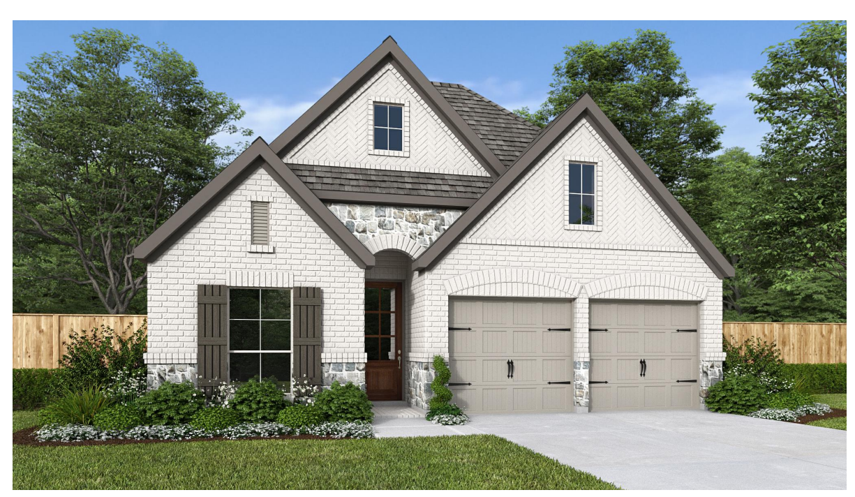
DESIGN 2026W E-50