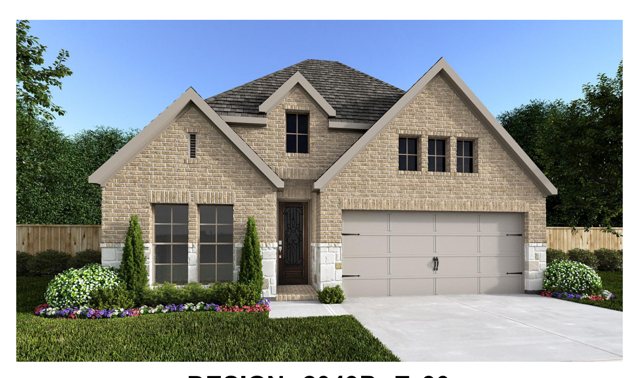
DESIGN 2049P E-30

In sesign, as originary designed and prior to any charges you make, is estimated to yield approximately fire further of square reox, stourn of page 1. All dimensions are approximate. Square rook vary based on as-built dimensions, configurations, plan options and/or the method of calculation. Designs are not-to-scale, and are conceptual illustrations that may depict features not available on all homesites or in all communities. Perry Homes reserves the right to make changes in plans and specifications, and to substitute material of similar quality. Prices, terms, promotions, plans, dimensions, features, options, amenities, elevations, designs, square footages, specifications, materials, and availability of homes or communities are subject to change without notice or obligation. All obligations will be governed by a written contract. This design does not constitute a commitment to build a particular floor plan or home in any given community. Some floor plans, options, and/or elevations may not be available on certain homesites or in a particular community and may require additional charges. Please check with Perry Homes to verify current offerings in the communities you are considering. This rendering is the property of Perry Homes, LLC. Any reproduction or exhibition is strictly prohibited. © Perry Homes, LLC 2024