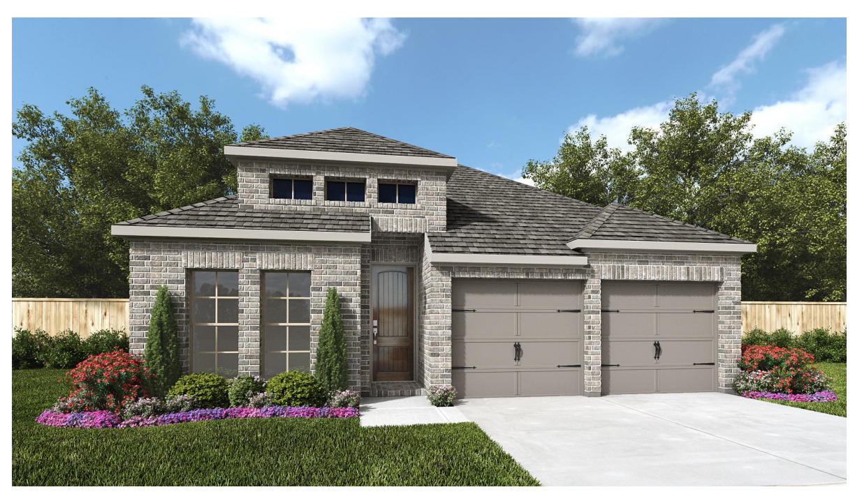
DESIGN 2049P E-1