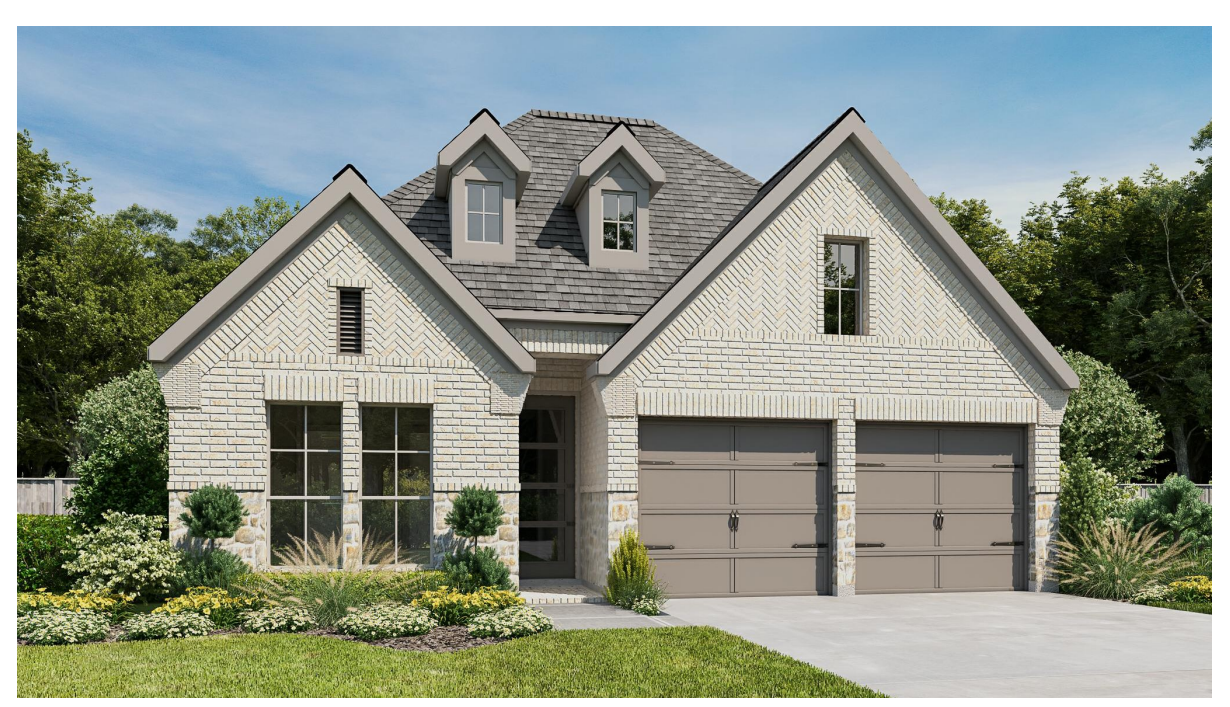
DESIGN 2049W E-50