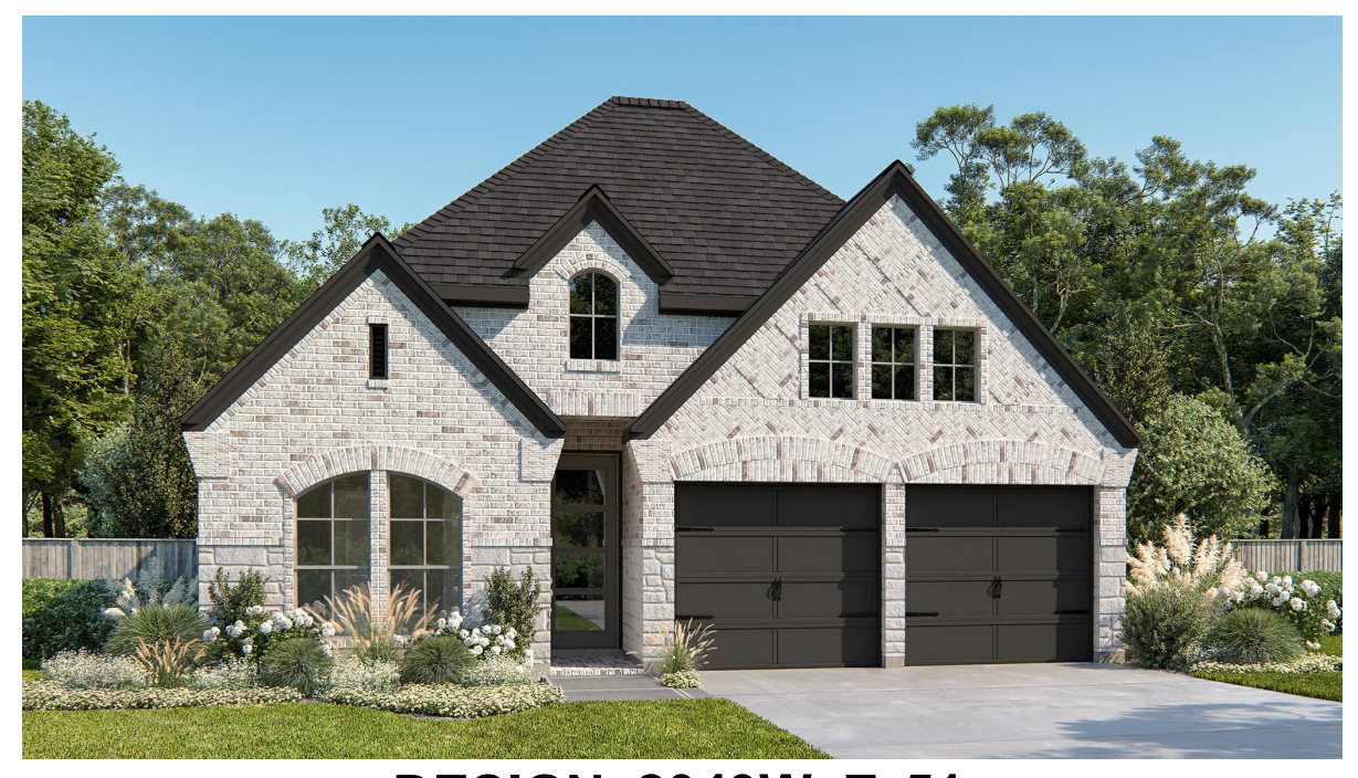
DESIGN 2049W E-51

This design, as originally designed and prior to any changes you make, is estimated to yield approximately the number of square feet shown on page 1. All dimensions are approximate. Square footage may vary based on as-built dimensions, configurations, plan options and/or the method of calculation. Designs are not-to-scale, and are conceptual illustrations that may differ from construction plans or completed improvements. A design may depict features not available on all homesites or in all communities. Perry Homes reserves the right to make changes in plans and specifications, and to substitute material of similar quality. Prices, terms, promotions, plans, dimensions, features, options, amenities, elevations, designs, square footages, specifications, materials, and availability of homes or communities are subject to change without notice or obligation. All obligations will be governed by a written contract. This design does not constitute a commitment to build a particular floor plan or home in any given community Some floor plans, options, and/or elevations may not be available on certain homesites or in a particular community and may require additional charges. Please check with Perry Homes to verify current offerings in the communities you are considering. This rendering is the property of Perry Homes. LLC. Any reproduction or exhibition is strictly prohibited. © Perry Homes. LLC 2024