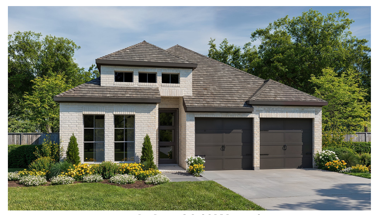
DESIGN 2049W E-1