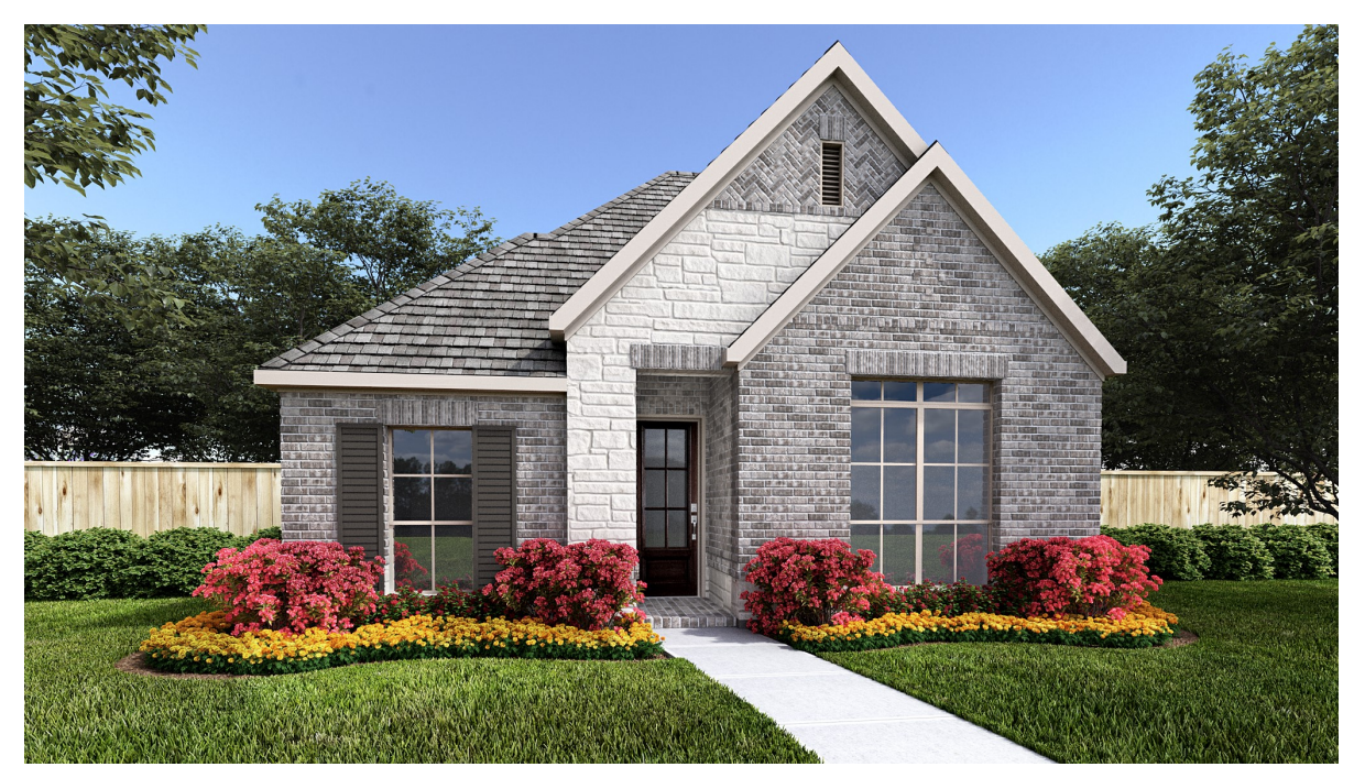
DESIGN 2056T E-1