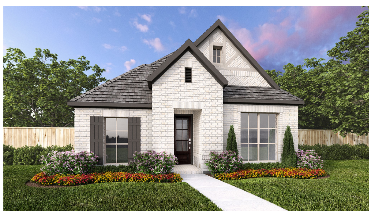
DESIGN 2056T E-2

This design, as originally designed and prior to any changes you make, is estimated to yield approximately the number of square feet shown on page 1. All dimensions are approximate. Square footage may vary based on as-built dimensions, configurations, plan options and/or the method of calculation. Designs are not-to-scale, and are conceptual illustrations that may differ from construction plans or completed improvements. A design may depict features not available on all homesites or in all communities. Perry Homes reserves the right to make changes in plans and specifications, and to substitute material of similar quality. Prices, terms, promotions, plans, dimensions, features, options, amenities, elevations, designs, square footages, specifications, materials, and availability of homes or communities are subject to change without notice or obligation. All obligations will be governed by a written contract. This design does not constitute a commitment to build a particular floor plan or home in any given community some floor plans, options, and/or elevations may not be available on certain homesites or in a particular community and may require additional charges. Please check with Perry Homes to verify current offerings in the communities you are considering. This rendering is the property of Perry Homes. LLC. Any reproduction or exhibition is strictly prohibited. © Perry Homes. LLC. 2023