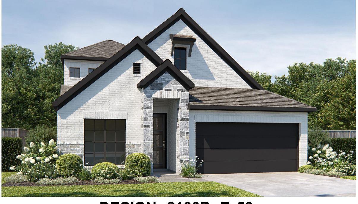
DESIGN 2100P E-50

This design, as originally designed and prior to any changes you make, is estimated to yield approximately the number of square feet shown on page 1. All dimensions are approximate. Square footage may vary based on as-built dimensions, configurations, plan options and/or the method of calculation. Designs are not-to-scale, and are conceptual illustrations that may differ from construction plans or completed improvements. A design may depict features not available on all homesites or in all communities. Perry Homes reserves the right to make changes in plans and specifications, and to substitute material of similar quality. Prices, terms, promotions, plans, dimensions, features, options, amenities, elevations, design does not constitute a commitment to build a particular floor plan or home in any given community. Some floor plans, options, and/or elevations multi be governed by a written contract. This design does not constitute a commitment to build a particular floor plan or home in any given community. Some floor plans, options, and/or elevations multi be property of Perry Homes, LLC. Any reproduction or exhibition is strictly prohibited. © Perry Homes, LLC 2024