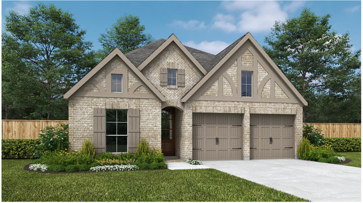
DESIGN 2169W E-31