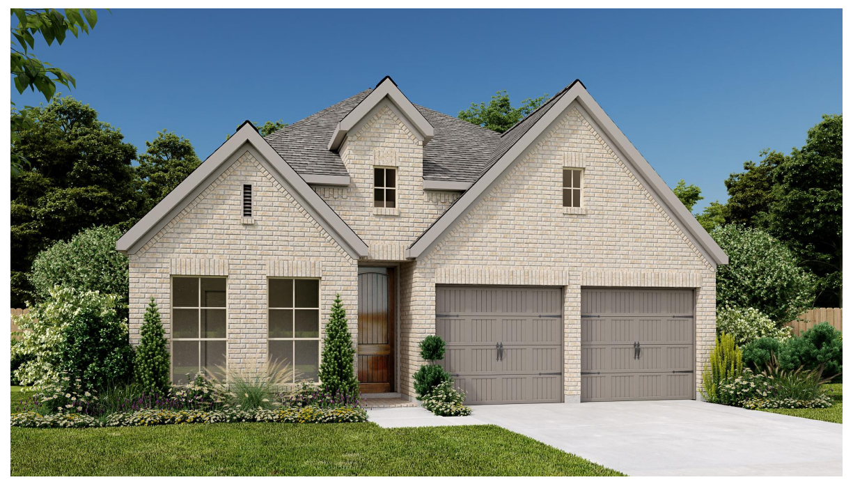
DESIGN 2169W E-1