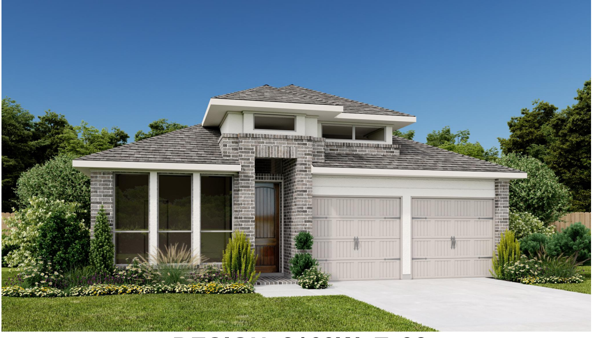
DESIGN 2169W E-32

*See Page 3 for Details and Disclaimers | © Perry Homes, LLC 2023 | 6/26/2023 3:48:19 PM (45' CL) PerryHomes.com