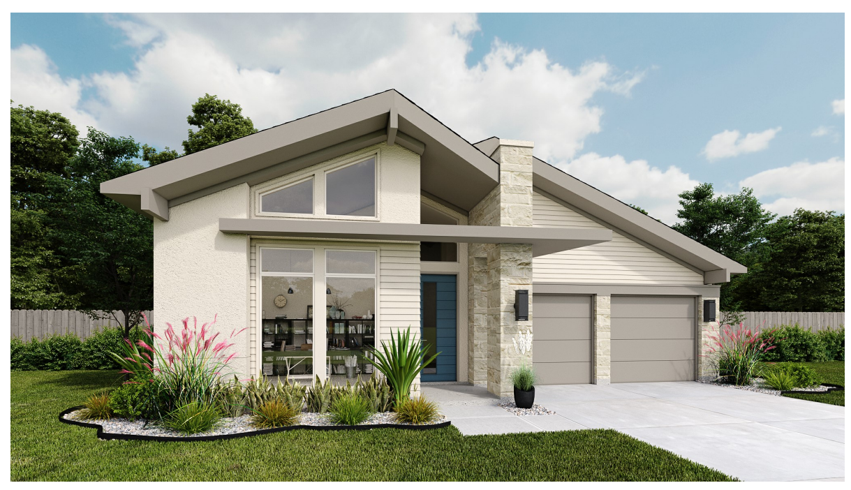
DESIGN 2178E E-70