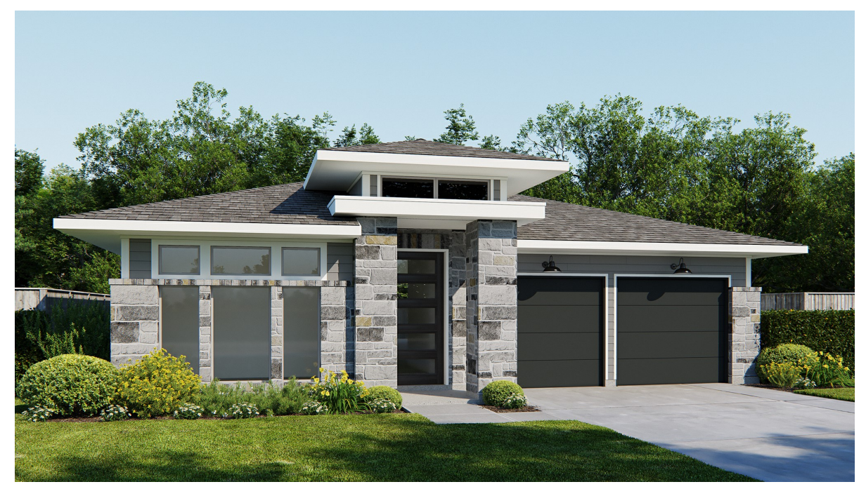
DESIGN 2178E E-1