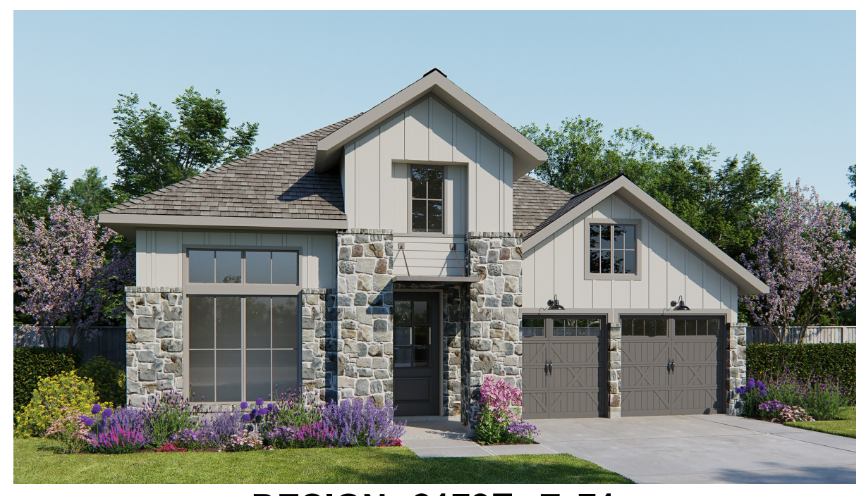
DESIGN 2178E E-71

This design, as originally designed and prior to any changes you make, is estimated to yield approximately the number of square feet shown on page 1. All dimensions are approximate. Square footage may vary based on as-built dimensions, configurations, plan options and/or the method of calculation. Designs are not-to-scale, and are conceptual illustrations that may differ from construction plans or completed improvements. A design may depict features not available on all homesites or in all communities. Perry Homes reserves the right to make changes in plans and specifications, and to substitute material of similar quality. Prices, terms, promotions, plans, dimensions, features, options, amenities, elevations, designs, square footages, specifications, materials, and availability of homes or communities are subject to change without notice or obligation. All obligations will be governed by a written contract. This design does not constitute a commitment to build a particular floor plan or home in any given community Some floor plans, options, and/or elevations may not be available on certain homesites or in a particular community and may require additional charges. Please check with Perry Homes to verify current offerings in the communities you are considering. This rendering is the property of Perry Homes LLC. Any reproduction or exhibition is strictly prohibited. @ Perry Homes LLC. 2013.