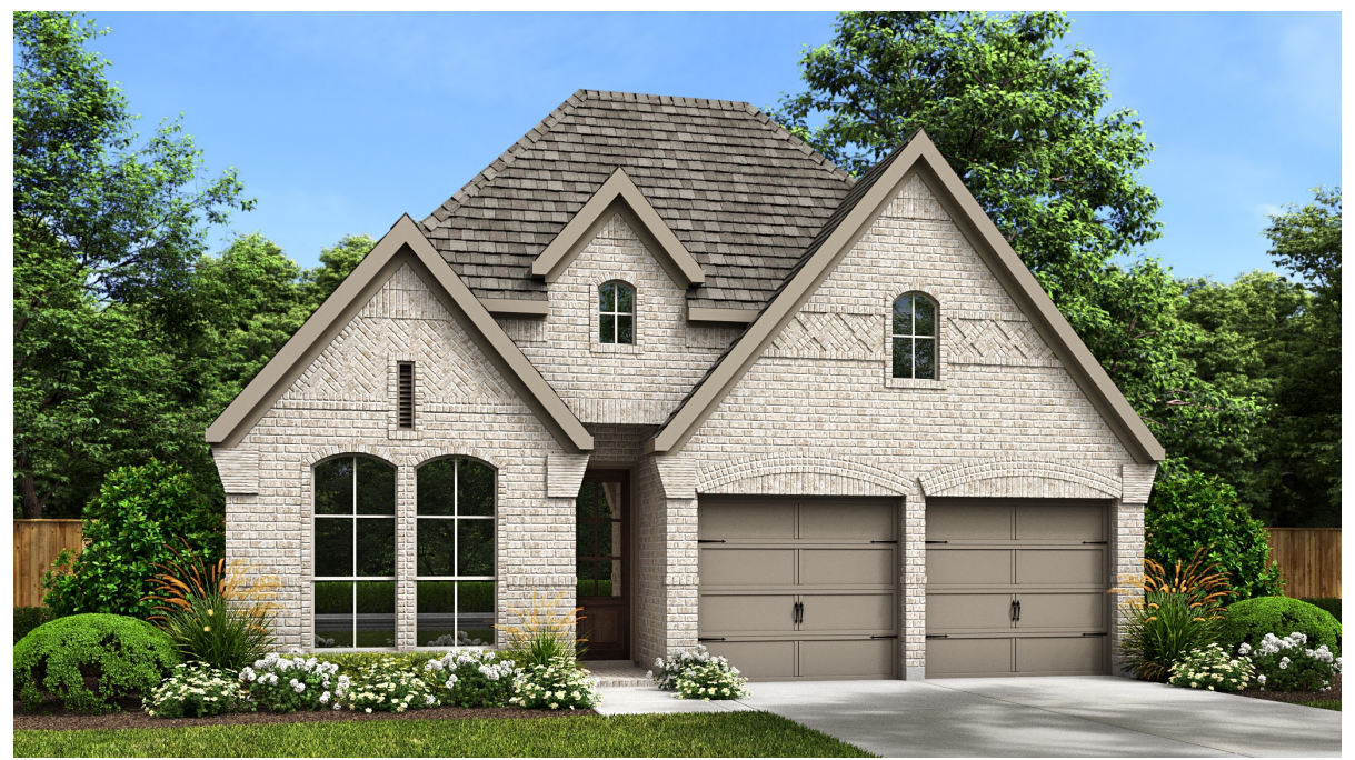
DESIGN 2180W E-1