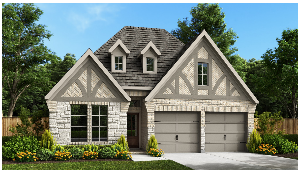
DESIGN 2180W E-70