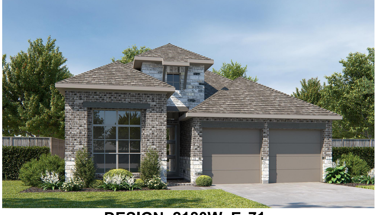
DESIGN 2180W E-71

This design, as originally designed and prior to any changes you make, is estimated to yield approximately the number of square feet shown on page 1. All dimensions are approximate. Square footage may vary based on as-built dimensions, configurations, plan options and/or the method of calculation. Designs are not-to-scale, and are conceptual illustrations that may differ from construction plans or completed improvements. A design may depict features not available on all homesites or in all communities. Perry Homes reserves the right to make changes in plans and specifications, and to substitute material of similar quality. Prices, terms, promotions, plans, dimensions, features, options, amenities, elevations, design design of costage specifications, materials, and availability of homes or communities are subject to change without notice or obligation. All obligations will be governed by a written contract. This design does not constitute a commitment to build a particular floor plan or home in any given community. Some floor plans, options, and/or elevations must be verify or perry Homes, LLC. Any reproduction or exhibition is strictly prohibited. © Perry Homes, LLC 2023