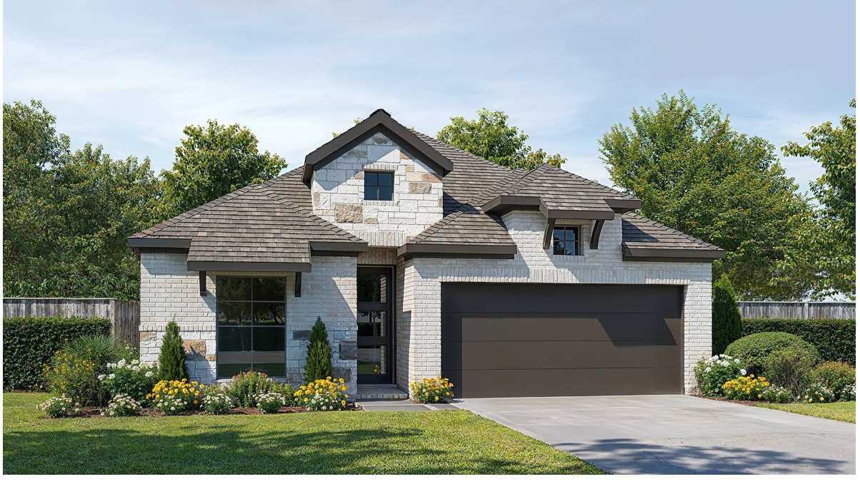
DESIGN 2188P E-32

This design, as originally designed and prior to any changes you make, is estimated to yield approximately the number of square feet shown on page 1. All dimensions are approximate. Square footage may vary based on as-built dimensions, configurations, plan options and/or the method of calculation. Designs are not-to-scale, and are conceptual illustrations that may differ from construction plans or completed improvements. A design may depict features not available on all homesites or in all communities. Perry Homes reserves the right to make changes in plans and specifications, and to substitute material of similar quality. Prices, terms, promotions, plans, dimensions, features, options, amenities, elevations, design does not constitute a commitment to build a particular floor plan or home in any given community. Some floor plans, options, and/or elevations will be governed by a written contract. This design does not constitute a commitment to build a particular floor plan or home in any given community. Some floor plans, options, and/or elevations must be or estimated or in a particular community and/or elevations during in the community and/or elevations must be redeving in the community and require additional charges. Please check with Perry Homes to verify current offerings in the communities you are considering. This rendering is the property of Perry Homes, LLC. Any reproduction or exhibition is strictly prohibited. © Perry Homes, LLC 2023