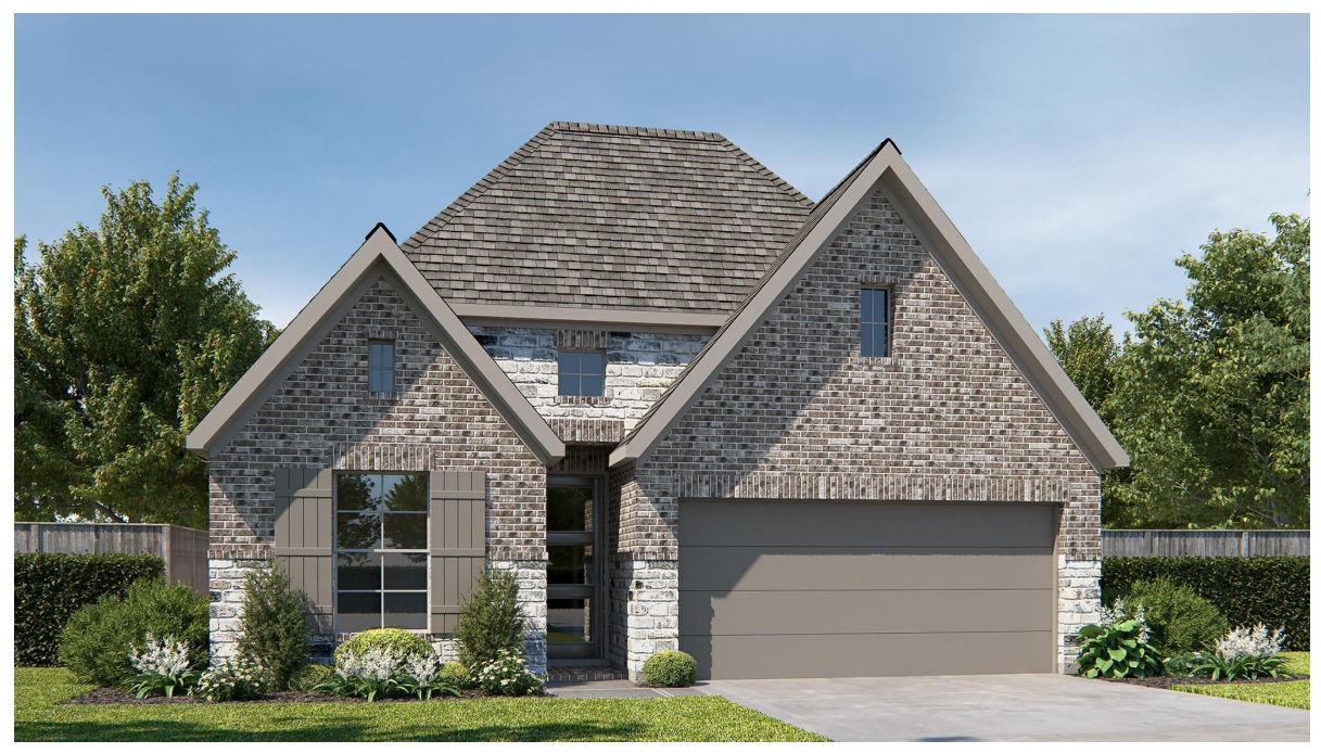
DESIGN 2188P E-1