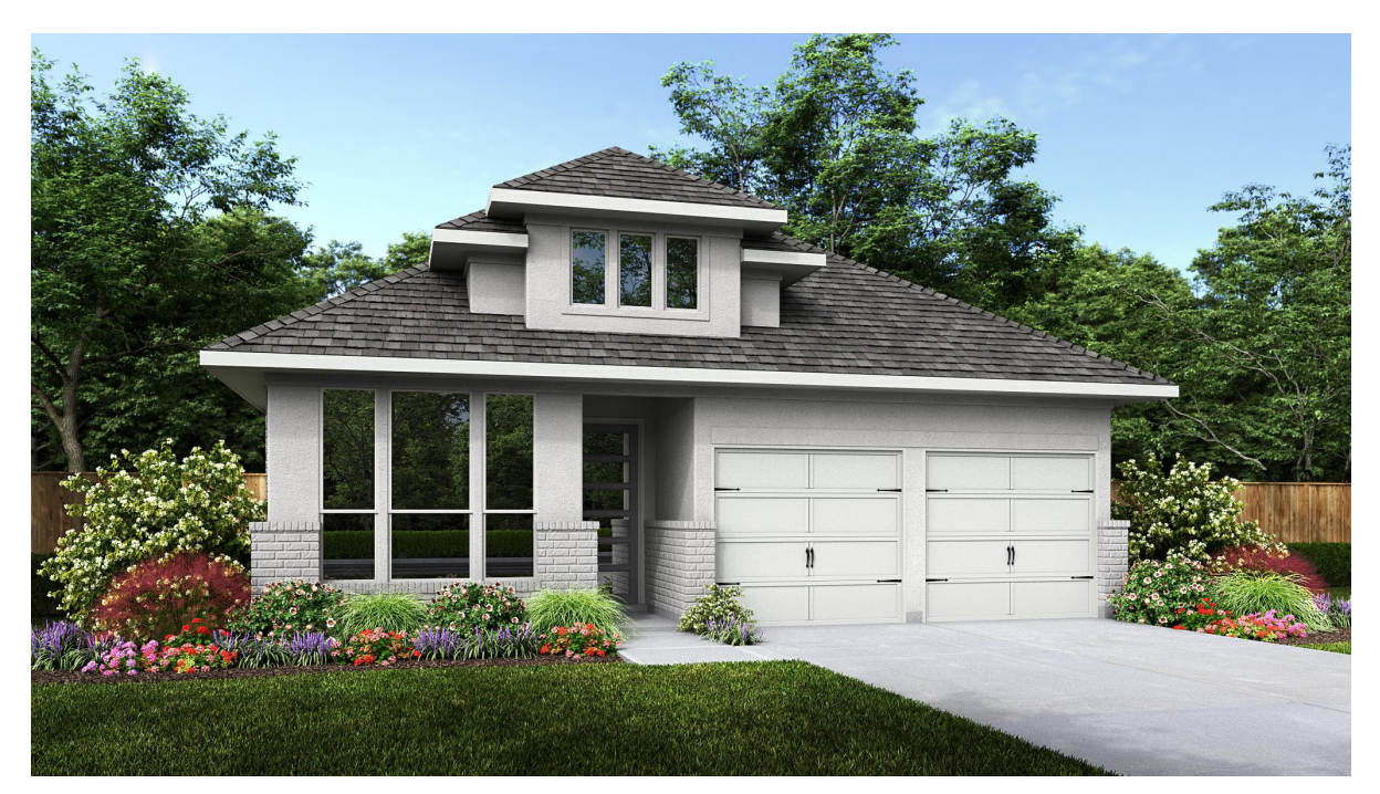
DESIGN 2188W E-1