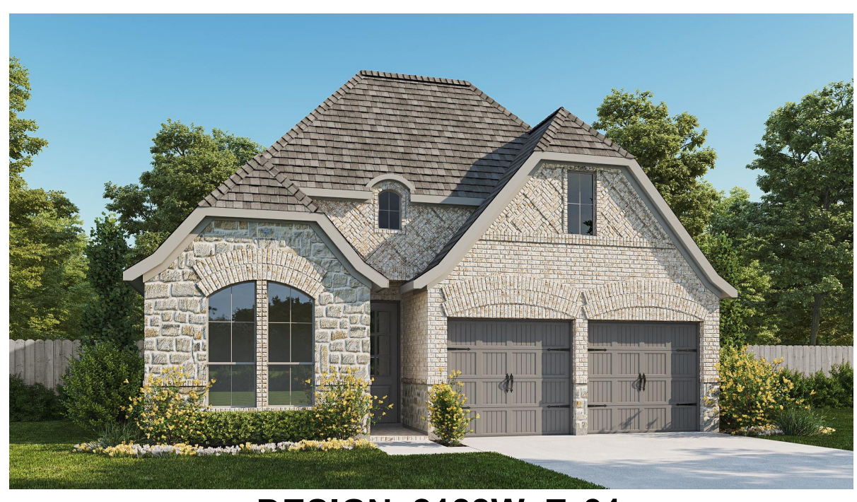
DESIGN 2188W E-31