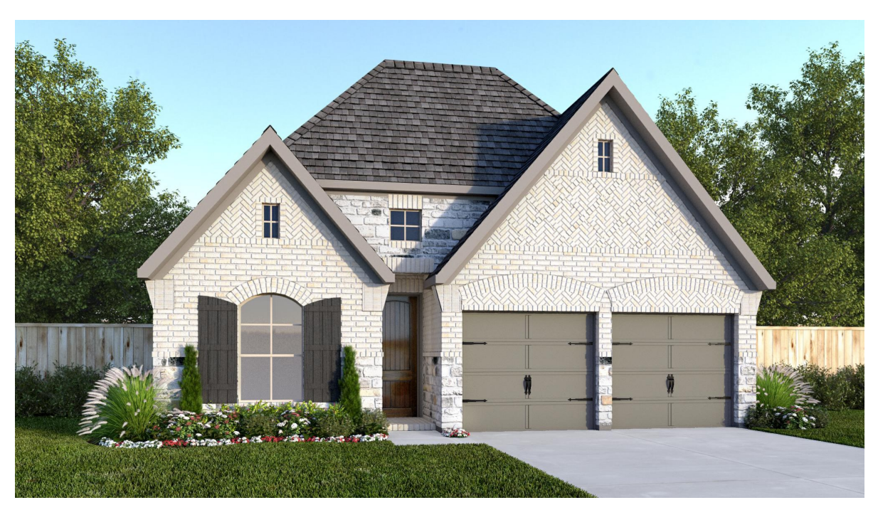
DESIGN 2188W E-30