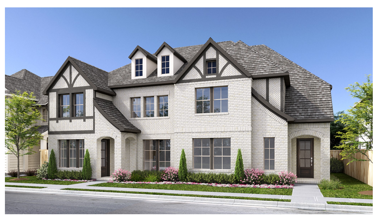
DESIGN 2213 E-71 DESIGN 2189 E-71

This design, as originally designed and prior to any changes you make, is estimated to yield approximately the number of square feet shown on page 1. All dimensions are approximate. Square footage may vary based on as-built dimensions, configurations, plan options and/or the method of calculation. Designs are not-to-scale, and are conceptual illustrations that may differ from construction plans or completed improvements. A design may depict features not available on all homesites or in all communities. Perry Homes reserves the right to make changes in plans and specifications, and to substitute material of similar quality. Prices, terms, promotions, plans, dimensions, features, options, amenities, elevations, designs, square footages, specifications, materials, and availability of homes or communities are subject to change without notice or obligation. All obligations will be governed by a written contract. This design does not constitute a commitment to build a particular floor plan or home in any given community some plans, options, and/or elevations may not be available on certain homesites or in a particular community and may require additional charges. Please check with Perry Homes to verify current offerings in the communities you are considering. This rendering is the property of Perry Homes, LLC. Any reproduction or exhibition is strictly prohibited. © Perry Homes, LLC 2023