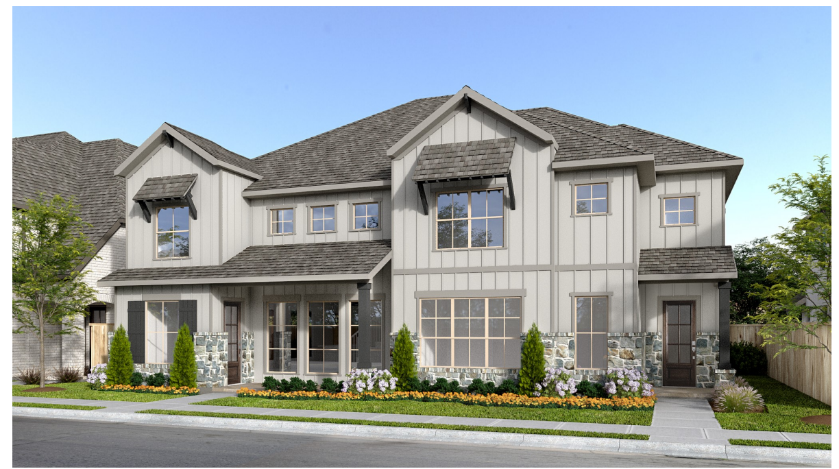
DESIGN 2213 E-70 DESIGN 2189 E-70