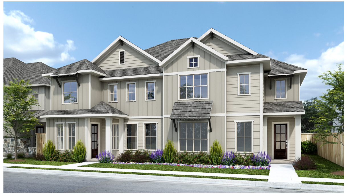
DESIGN 2213 E-1 DESIGN 2189 E-1