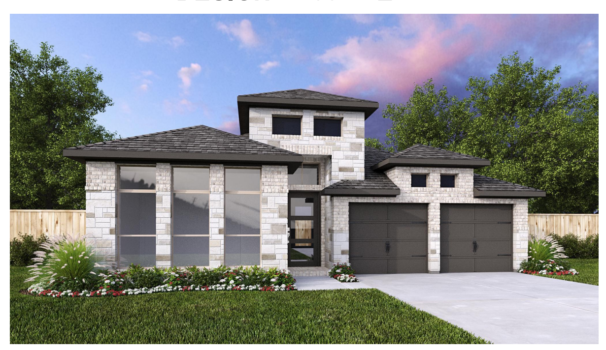
DESIGN 2199W E-30