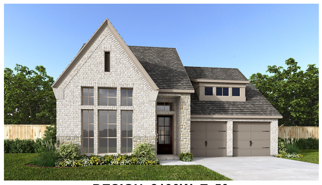
DESIGN 2199W E-50

This design, as originally designed and prior to any changes you make, is estimated to yield approximately the number of square feet shown on page 1. All dimensions are approximate. Square footage may vary based on as-built dimensions, configurations, plan options and/or the method of calculation. Designs are not-to-scale, and are conceptual illustrations that may differ from construction plans or completed improvements. A design may depict features not available on all homesites or in all communities. Perry Homes reserves the right to make changes in plans and specifications, and to substitute material of similar quality. Prices, terms, promotions, plans, dimensions, features, options, amenities, elevations, designs, square footages, specifications, materials, and availability of homes or communities to change without notice or obligation. All obligations will be governed by a written contract. This design does not constitute a commitment to build a particular floor plan or home in any given community. Some floor plans, options, and/or elevations may not be available on certain homesites or in a particular community and may require additional charges. Please check with Perry Homes to verify current offerings in the communities and are considering. This rendering is the property of Perry Homes. LLC. Any reproduction or exhibition is strictly prohibited @ Perry Homes LLC. 2018