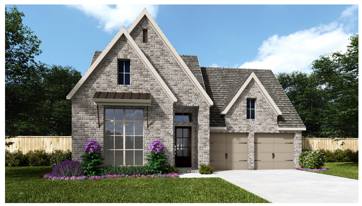
DESIGN 2199W E-1