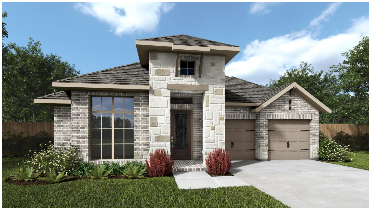
DESIGN 2206H E-30