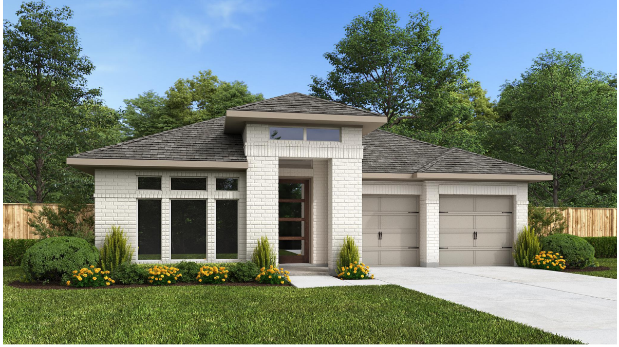
DESIGN 2206H E-1