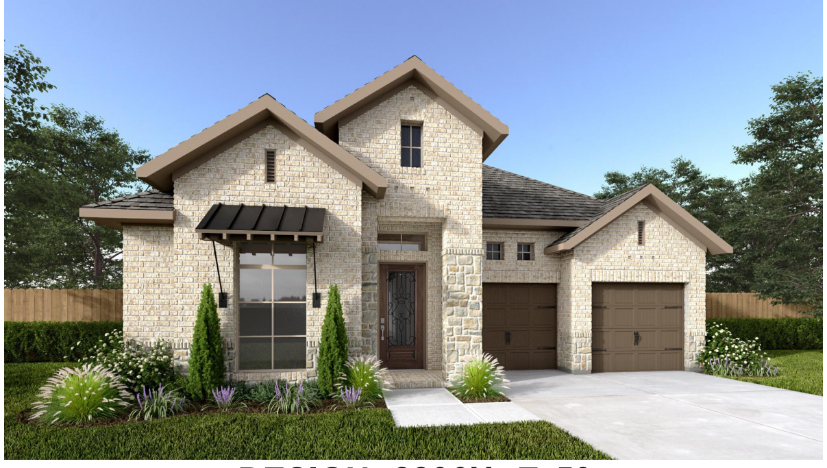
DESIGN 2206H E-50

*See Page 3 for Details and Disclaimers | © Perry Homes, LLC 2022 | 12/29/2022 3:17:17 PM (50' CL) PerryHomes.com