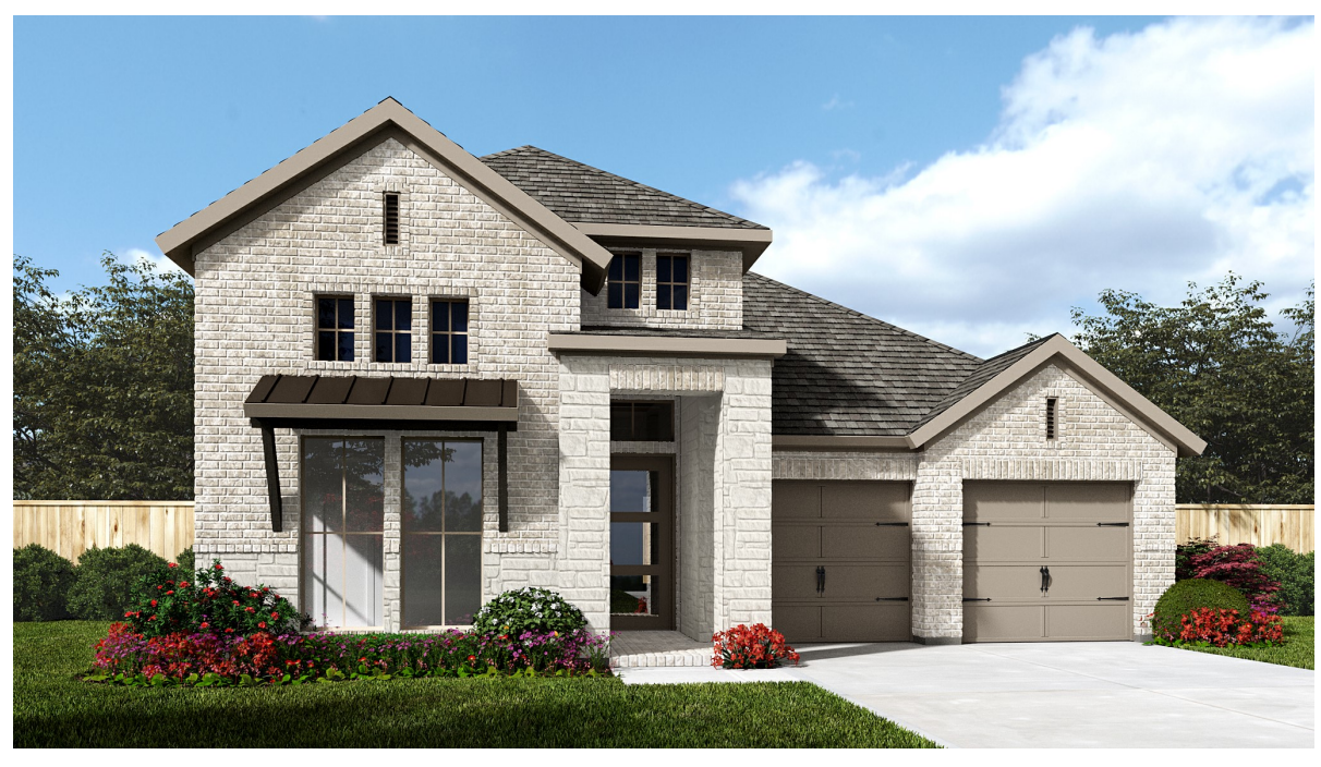
DESIGN 2300H E-70

This design, as originally designed and prior to any changes you make, is estimated to yield approximately the number of square feet shown on page 1. All dimensions are approximate. Square footage may vary based on as-built dimensions, configurations, plan options and/or the method of calculation. Designs are not-to-scale, and are conceptual illustrations that may differ from construction plans or completed improvements. A design may depict features not available on all homesites or in all communities. Perry Homes reserves the right to make changes in plans and specifications, and to substitute material of similar quality. Prices, terms, promotions, plans, dimensions, features, options, amenities, elevations, designs, square footages, specifications, materials, and availability of homes or communities are subject to change without notice or obligation. All obligations will be governed by a written contract. This design does not constitute a commitment to build a particular floor plan or home in any given community Some floor plans, options, and/or elevations may not be available on certain homesites or in a particular community and may require additional charges. Please check with Perry Homes to verify current offerings in the communities are considering. This rendering is the property of Perry Homes. LLC. Any reproduction or exhibition is strictly prohibited @ Perry Homes LLC. 2024