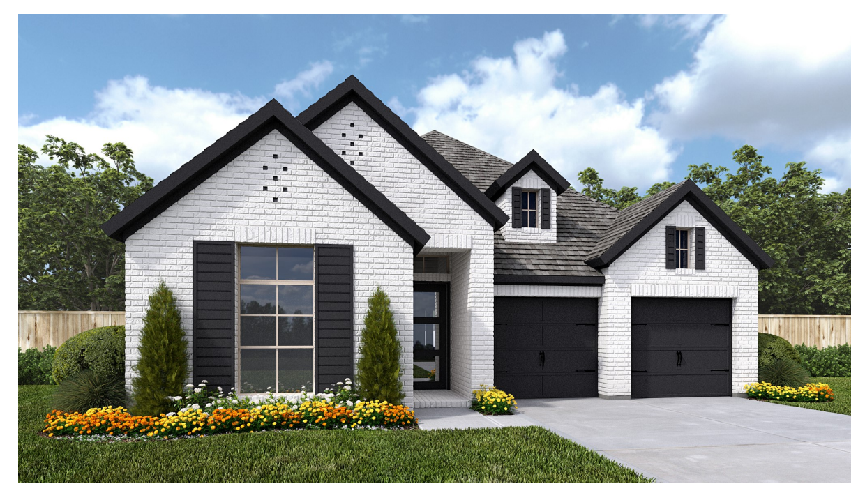
DESIGN 2300H E-1