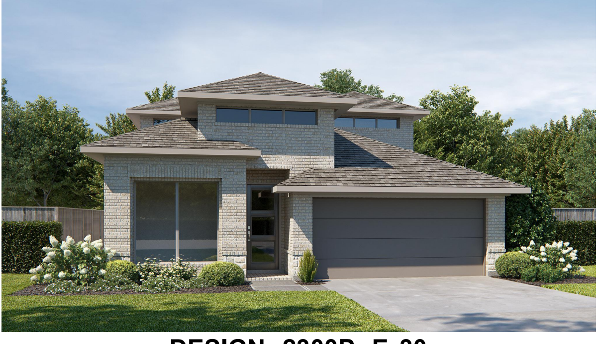
DESIGN 2300P E-30

This design, as originally designed and prior to any changes you make, is estimated to yield approximately the number of square feet shown on page 1. All dimensions are approximate. Square footage may vary based on as-built dimensions, configurations, plan options and/or the method of calculation. Designs are not-to-scale, and are conceptual illustrations that may differ from construction plans or completed improvements. A design may depict features not available on all homesites or in all communities. Perry Homes reserves the right to make changes in plans and specifications, and to substitute material of similar quality. Prices, terms, promotions, plans, dimensions, features, options, amenities, elevations, design does not constitute a commitment to build a particular floor plan or home in any given community. Some floor plans, options, and/or elevations will be governed by a written contract. This design does not constitute a commitment to build a particular floor plan or home in any given community. Some floor plans, options, and/or elevations may not be available on certain homesites or in a particular community and require additional charges. Please check with Perry Homes to verify current of ferings in the communities you are considering. This rendering is the property of Perry Homes, LLC. Any reproduction or exhibition is strictly prohibited. © Perry Homes, LLC 2023