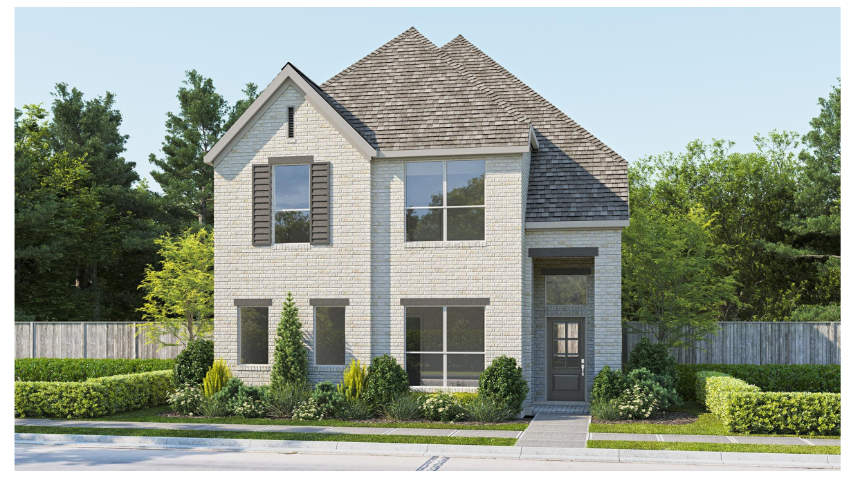
DESIGN 2321W E-1