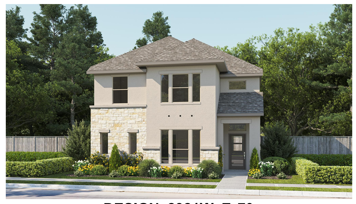
DESIGN 2321W E-70

This design, as originally designed and prior to any changes you make, is estimated to yield approximately the number of square feet shown on page 1. All dimensions are approximate. Square footage may vary based on as-built dimensions, configurations, plan options and/or the method of calculation. Designs are not-to-scale, and are conceptual illustrations that may differ from construction plans or completed improvements. A design may depict features not available on all homesites or in all communities. Perry Homes reserves the right to make changes in plans and specifications, and to substitute material of similar quality. Prices, terms, promotions, plans, dimensions, features, options, amenities, elevations, designs, square footages, specifications, materials, and availability of homes or communities to change without notice or obligation. All obligations will be governed by a written contract. This design does not constitute a commitment to build a particular floor plan or home in any given community. Some floor plans, options, and/or elevations may not be available on certain homesites or in a particular community and may require additional charges. Please check with Perry Homes to verify current offerings in the communities on a green considering. This rendering is the property of Perry Homes. LLC. Any reproduction or exhibition is strictly prohibited @ Perry Homes LLC. 2018