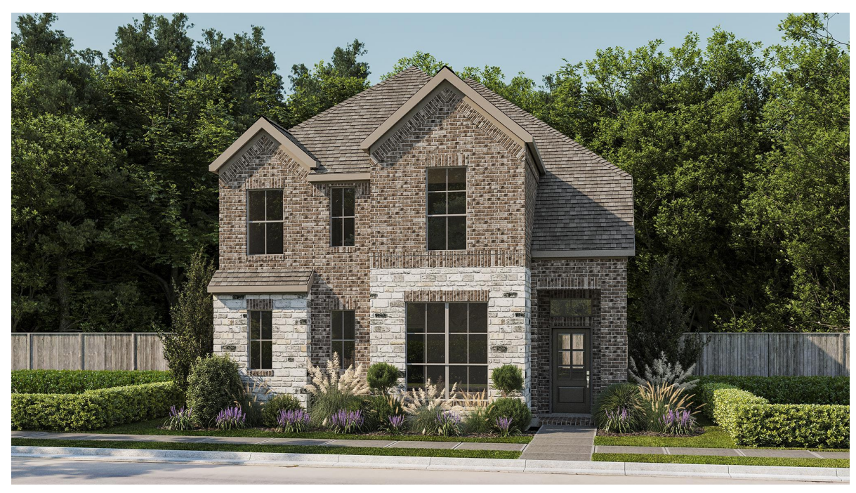
DESIGN 2321W E-30