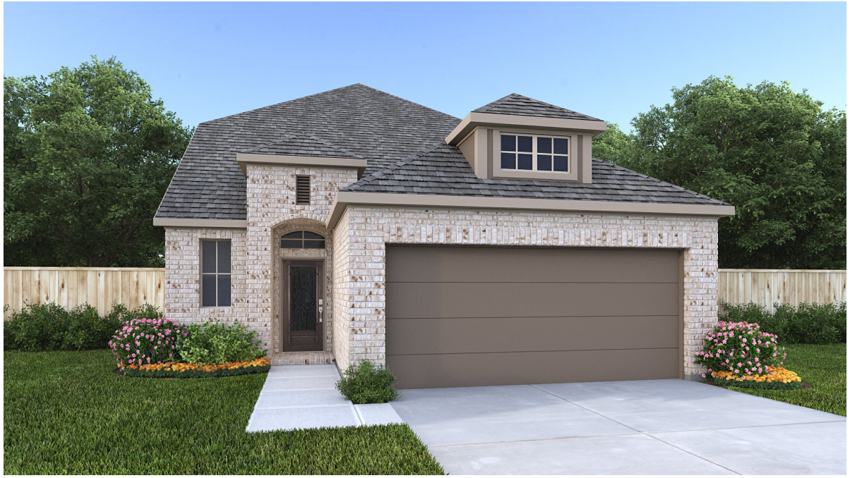
DESIGN 2330W E-1