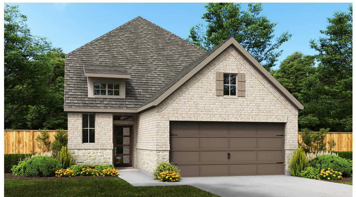
DESIGN 2330W E-30