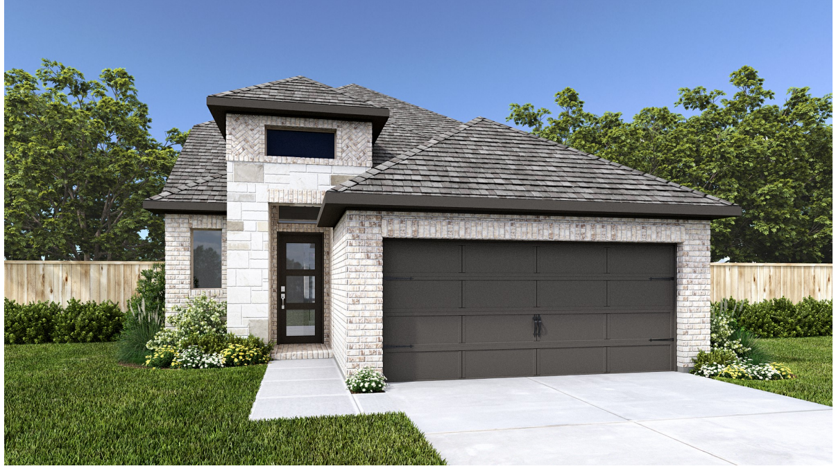
DESIGN 2330W E-31