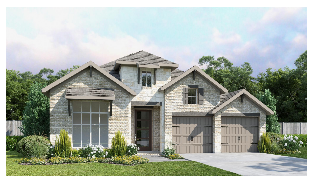
DESIGN 2357W E-30