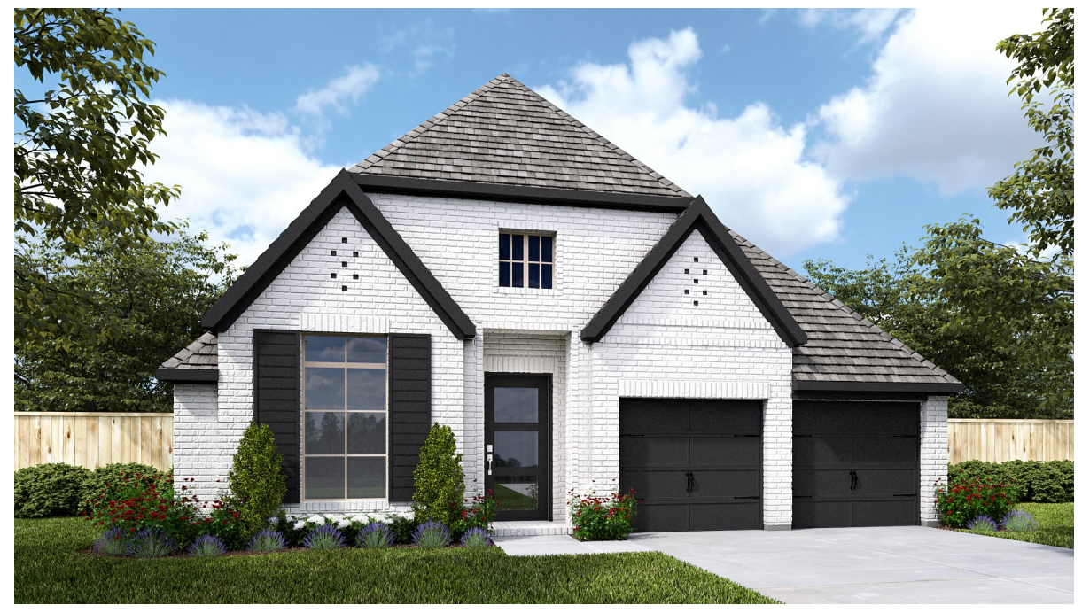
DESIGN 2357W E-1