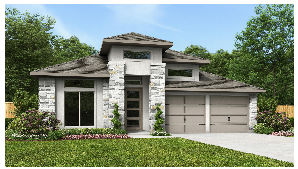
DESIGN 2357W E-32