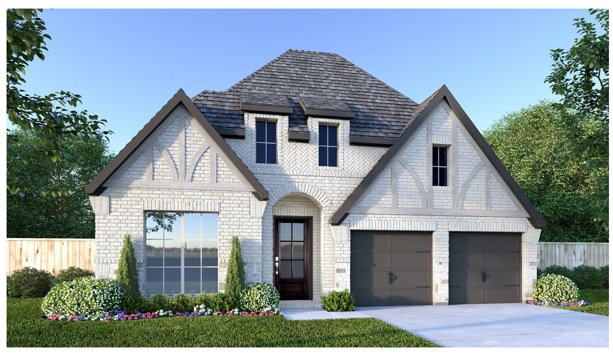
DESIGN 2357W E-50