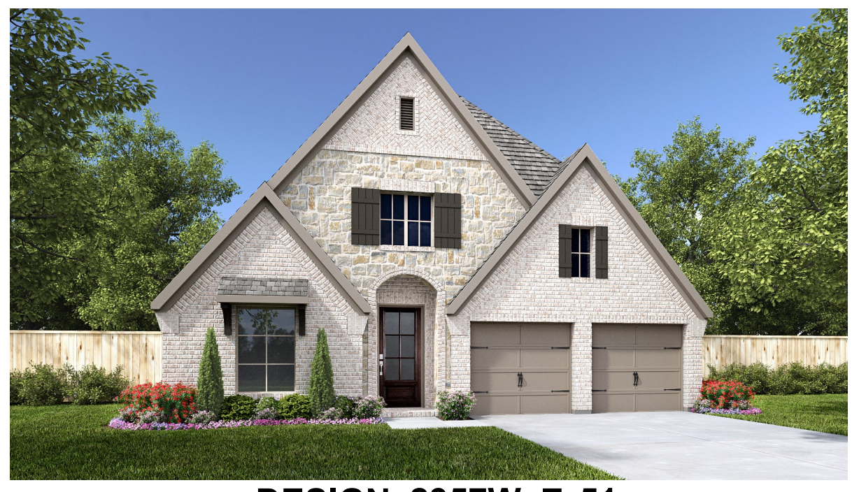
DESIGN 2357W E-51

This design, as originally designed and prior to any changes you make, is estimated to yield approximately the number of square feet shown on page 1. All dimensions are approximate. Square footage may vary based on as-built dimensions, configurations, plan options and/or the method of calculation. Designs are not-to-scale, and are conceptual illustrations that may differ from construction plans or completed improvements. A design may depict features not available on all homesites or in all communities. Perry Homes reserves the right to make changes in plans and specifications, and to substitute material of similar quality. Prices, terms, promotions, plans, dimensions, features, options, amenities, elevations, designs, square footages, specifications, materials, and availability of homes or communities evaluate to change without notice or obligation. All obligations will be governed by a written contract. This design does not constitute a commitment to build a particular floor plan or home in any given community. Some floor plans, options, and/or elevations may not be available on certain homesites or in a particular community and may require additional charges. Please check with Perry Homes to verify current offerings in the communities you are considering. This rendering is the property of Perry Homes. LLC. Any reproduction or exhibition is strictly prohibited. © Perry Homes. LLC 2023