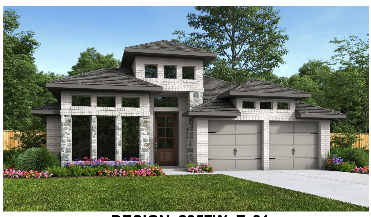
DESIGN 2357W E-31