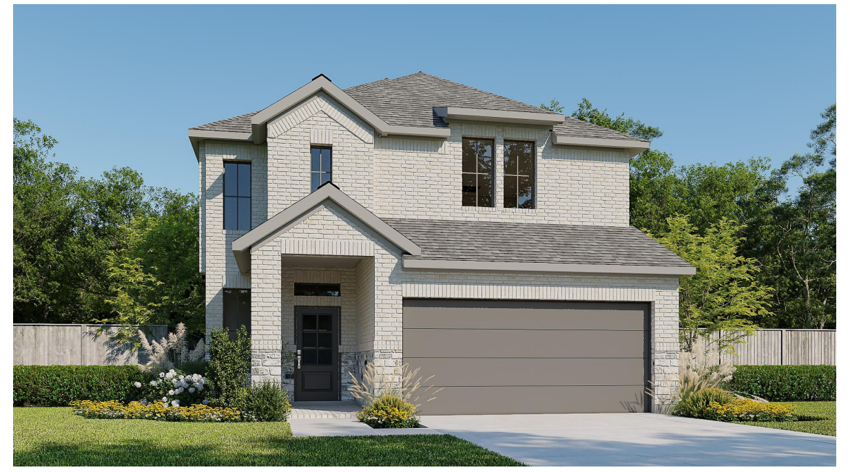
DESIGN 2399W E-52