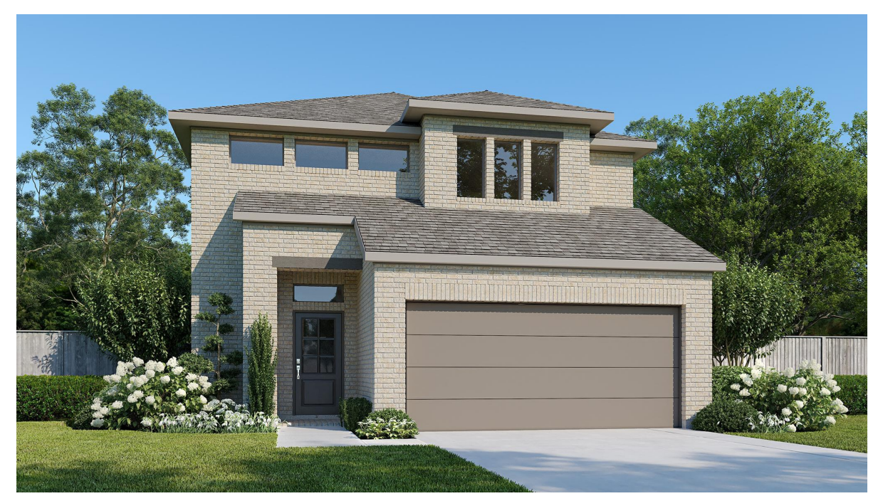
DESIGN 2399W E-33