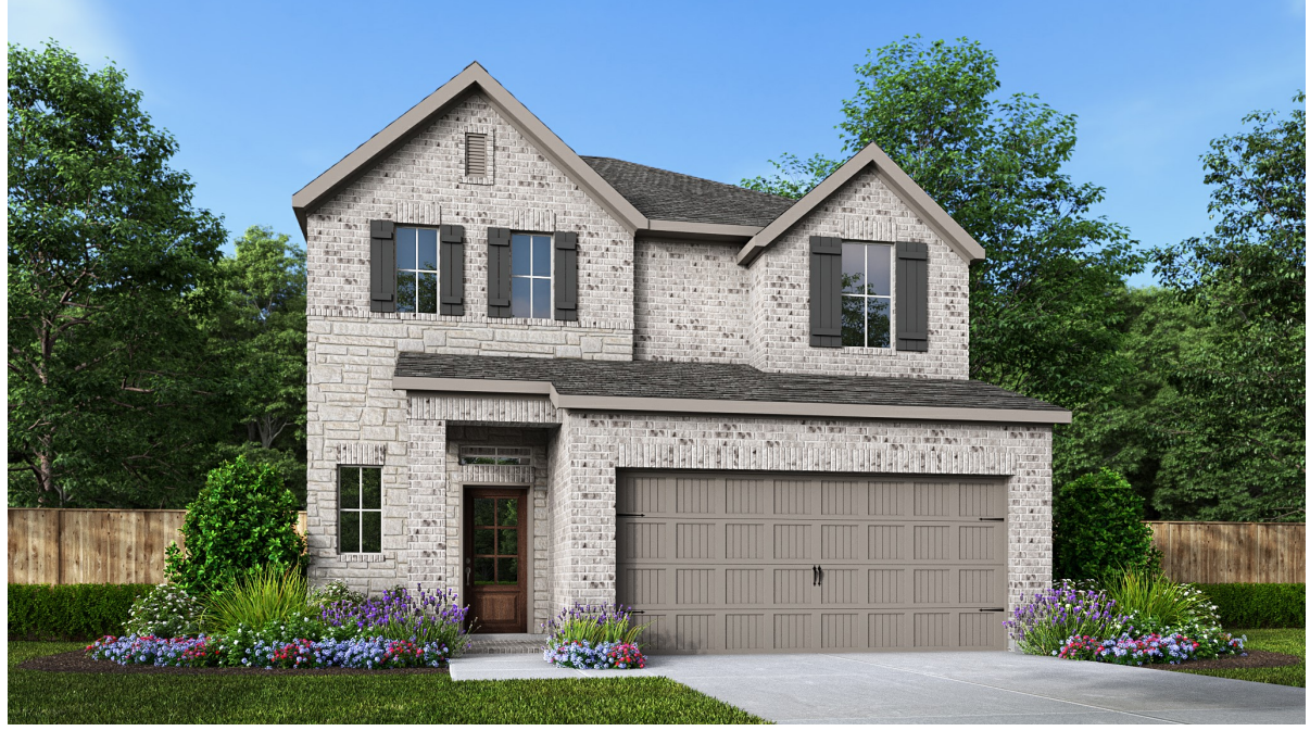
DESIGN 2399W E-51