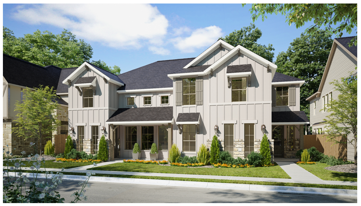
DESIGN 2450 E-70