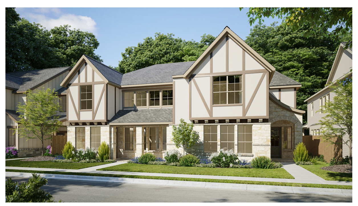
DESIGN 2409 E-70